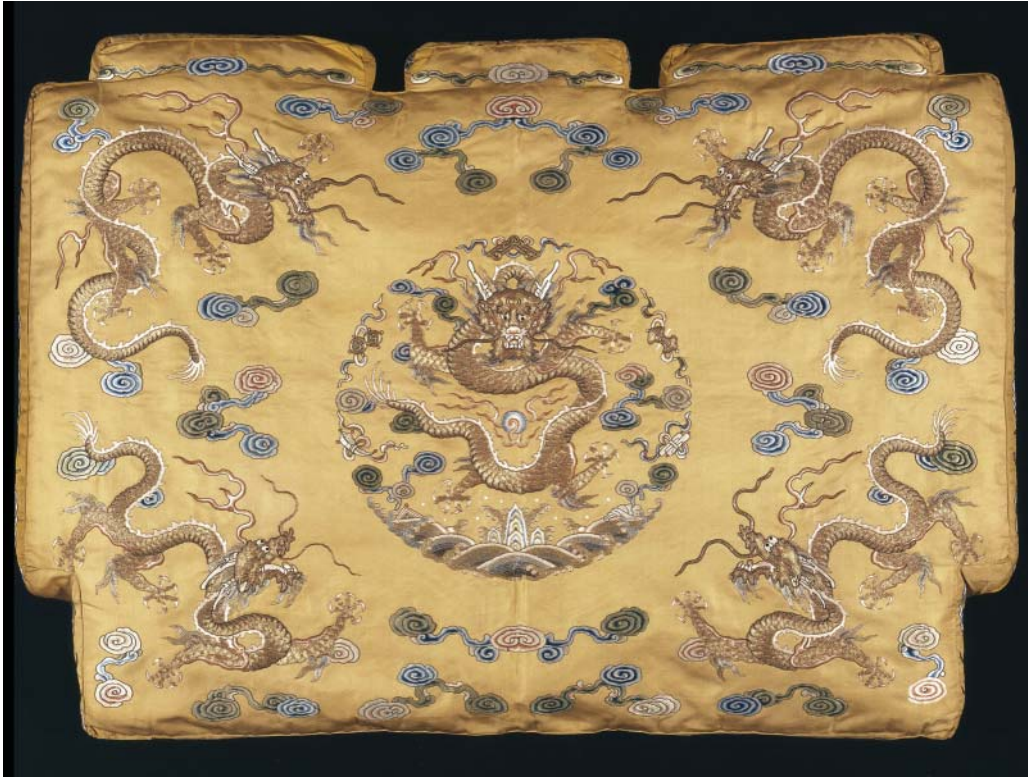
FIG. 2. One of the Wolseley cushion covers from the Summer Palace; silk with gold and silk embroidery, China, c.1800. V&A Accession No. T.139-1917

In the closing stages of these wars, Anglo-French forces stormed the Chinese Emperor's Summer Palace (Yuanmingyuan), and looted or destroyed its contents before burning the building to the ground. Amidst a chaotic and 'carnavalesque atmosphere', first-hand accounts of the looting tell how the soldiers put on the Chinese embroidered robes that they found and used bolts of imperial silk to make tents for their encampment. 15 Such details were ultimately played down in favour of accounts of a more orderly redistribution of Chinese material culture as a sign of righteous conquest, and of European civilized conduct, when the spoils of the Emperor's palace were exhibited and auctioned off in France and Britain. 16 Articles that related directly to the Emperor's person took on a special significance as symbols of conquest, playing a role in colonial masquerade, appropriation and domination.