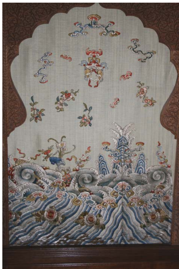
FIG. 5. Arrangement of Chinese embroidery motifs, Quex House.

The Quex House embroideries consist of 25 separate designs, each set within 25 arched spaces in a carved-wood dado all around the drawing room. They were made by cutting out Chinese embroidered motifs and patterns, and then fixing them onto a silk backing in new arrangements (Fig. 5). Included among the many butterflies, bats and flowers are a total of eight five-clawed dragons (Fig. 6), possibly all sourced from one robe, as well as the bottom edges of a dragon robe with its characteristic blue and white stripes representing water. There are also two gold pheasant badges that are examples