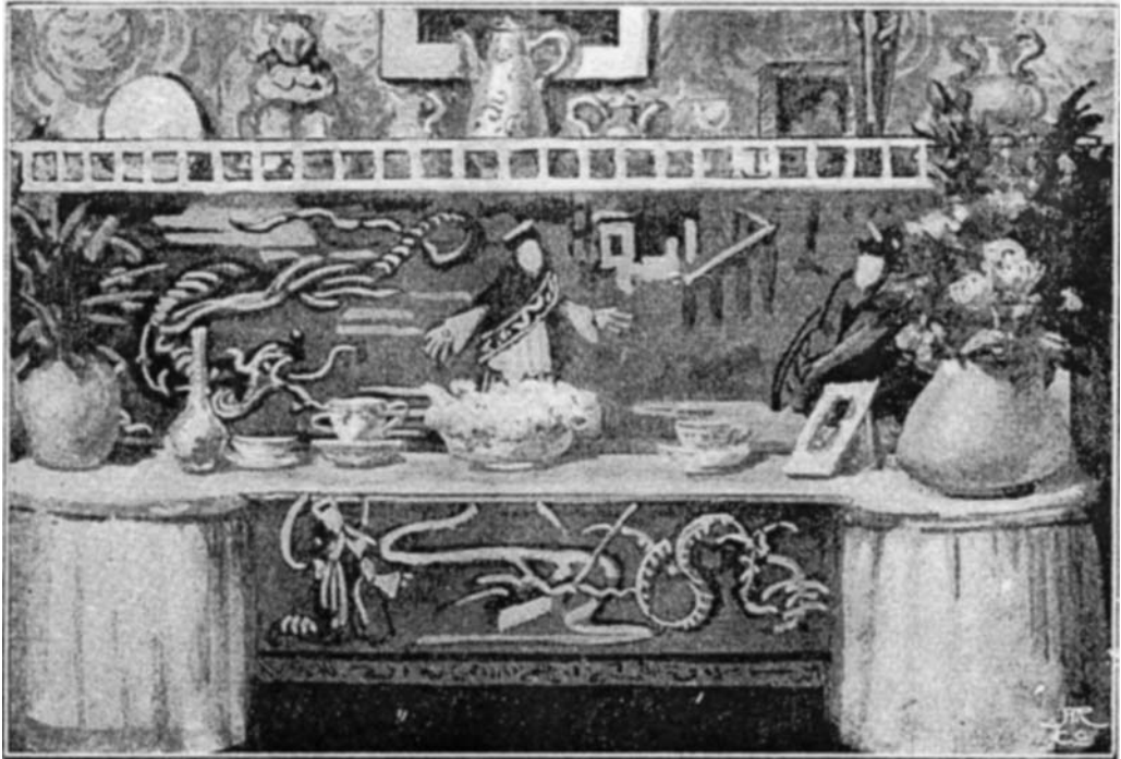
FIG. 8. Use of Chinese/Japanese embroideries around the fireplace. C. S. Peel, The New Home: Treating of the Arrangements Decoration and Furnishing of a Home of Medium Size to be Maintained by a Moderate Income (2nd ed. Rev. London: Constable, 1903) p. 151.