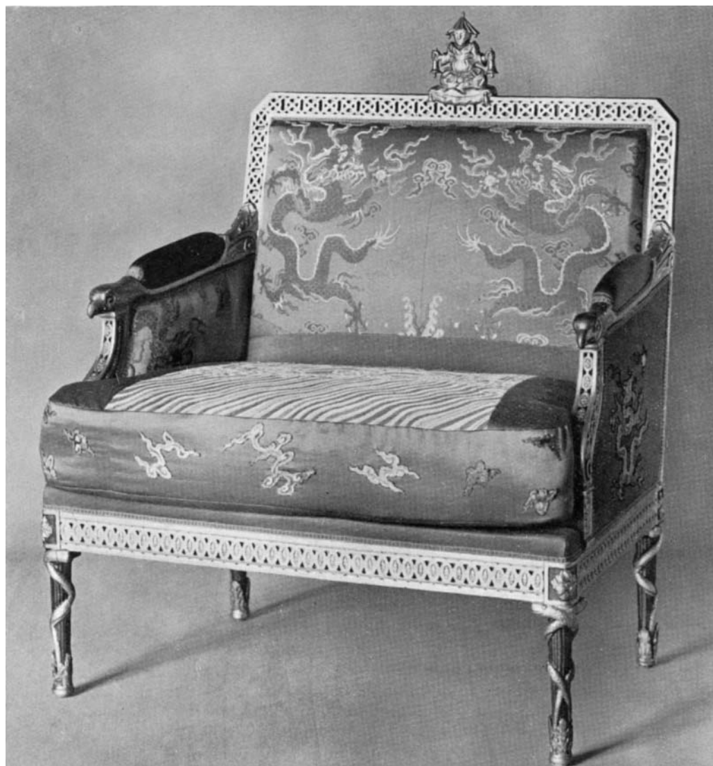
FIG. 4. Armchair in the Centre Room, Buckingham Palace, upholstered with Chinese embroidery. Harold Clifford Smith, Buckingham Palace: Its Furniture, Decoration and History: By Harold Clifford Smith (London: Country Life, 1931), pl. 287.

a balcony where the Royal family show themselves to the public at moments of national importance. Under Mary's direction, six panels of yellow embroidered Chinese silk were hung from new gilt wooden poles carved with dragons and bordered by Chinese fretwork. 25 'Chinese' ceiling decoration was added to match the silks, and new green curtains were decorated with panels of old Chinese embroideries cut from the textiles found in the stores (Fig. 3). Thus, the balcony curtains of the Centre Room with