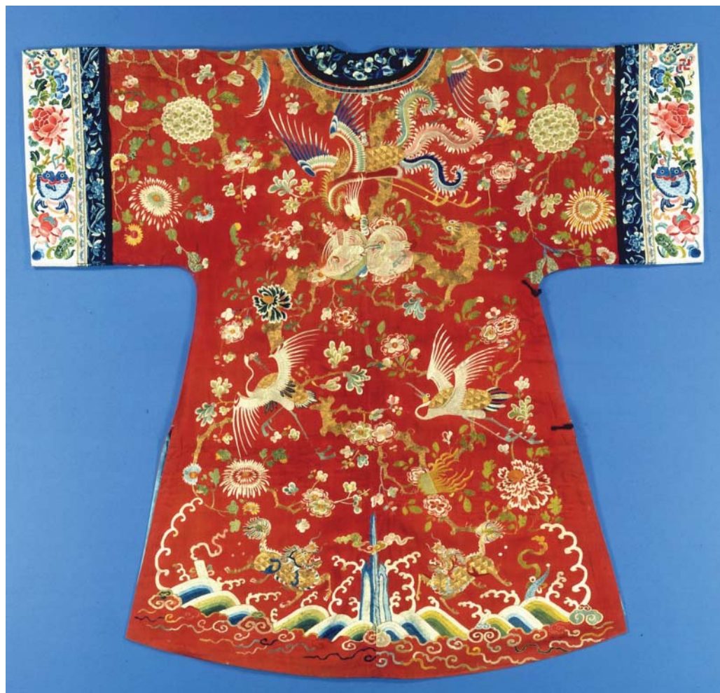
FIG. 1. Lady's coat. Silk. China, 17th–18th century. V&A Accession No. T.184–1948