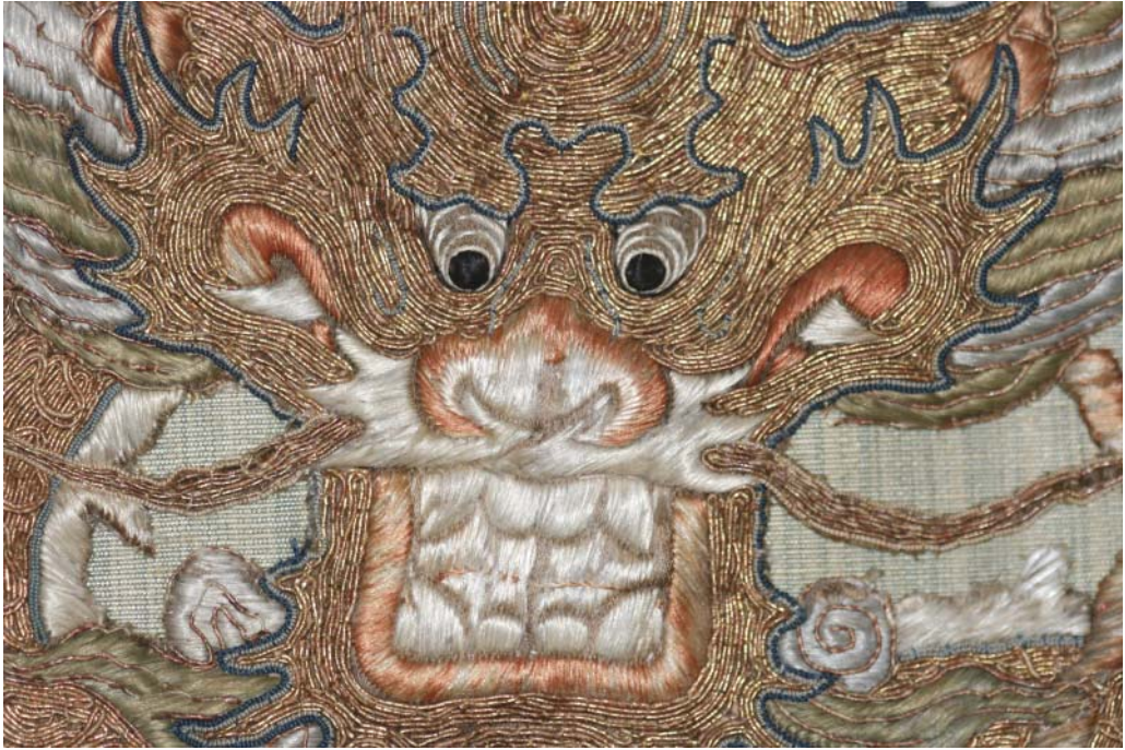
FIG. 6. Dragon motif at Quex House (detail).

of the large rectangular embroidered panels which were sewn onto the front and back of Chinese government officials' clothing during the Qing dynasty to denote rank. Other possible sources for the embroideries are women's robes, priest's mantles, domestic hangings and furniture covers, whilst one embroidered group of people is probably Japanese in origin.