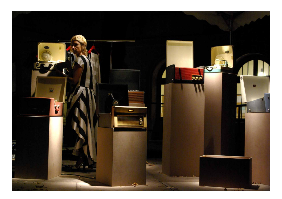
Captive Bird Society, 2009 12-hour performance-installation, incorporating the Haute Couture collection of Didier Ludot, Nuit Blanche commission, École Normale Supérieure, Paris

As far back as 1992 Margarita Gluzberg walked down Bond Street in the West End of London, camera in hand, taking black and white photographs of exclusive shop fronts and people in front of them window shopping. From this point on one of her central interests has been the psychological dimension of consumer culture and an exploration of the manner in which consumers are affected by desire and the promise inherent in the luxury object intermediated by the gaze; the way in which viewers look at images of people.