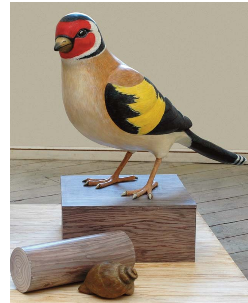
Denise de Cordova: Quiet Hunting 2006–2024 acrylic and mixed media, c. 75 x 100 x 100 cm