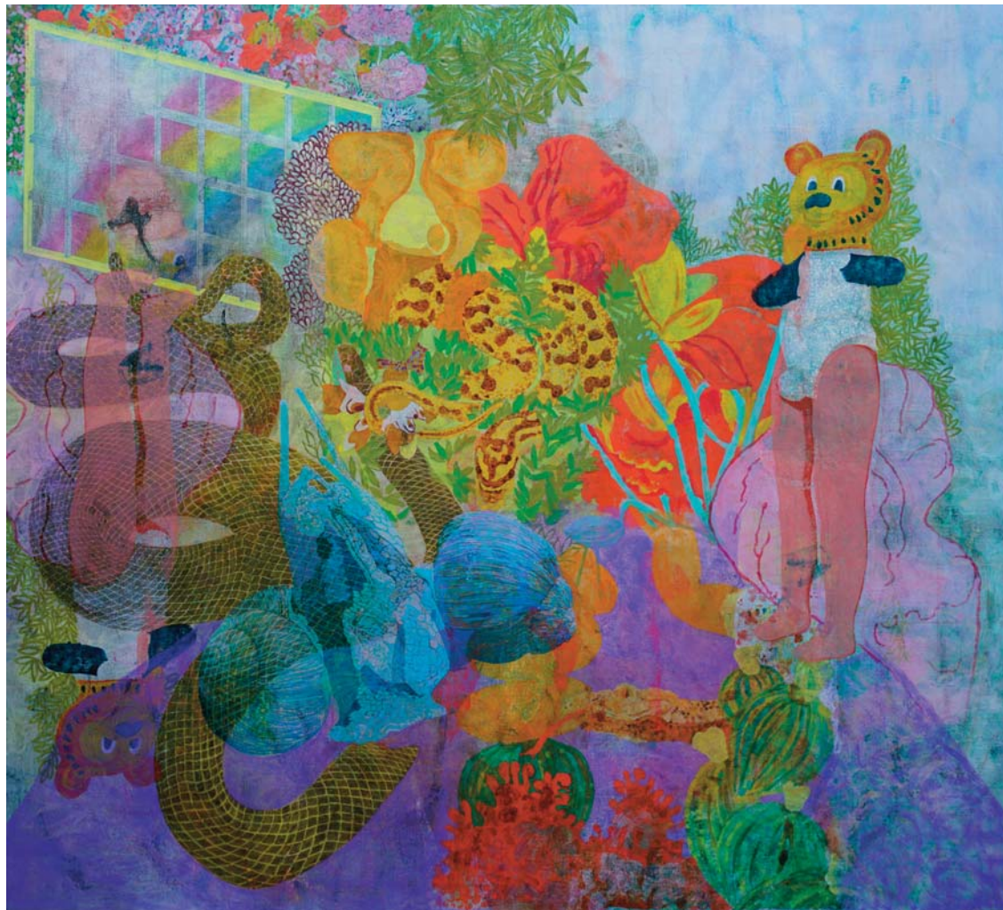
James Fisher: Nuts Odden 2024 oil on linen, 200 x 220 cm