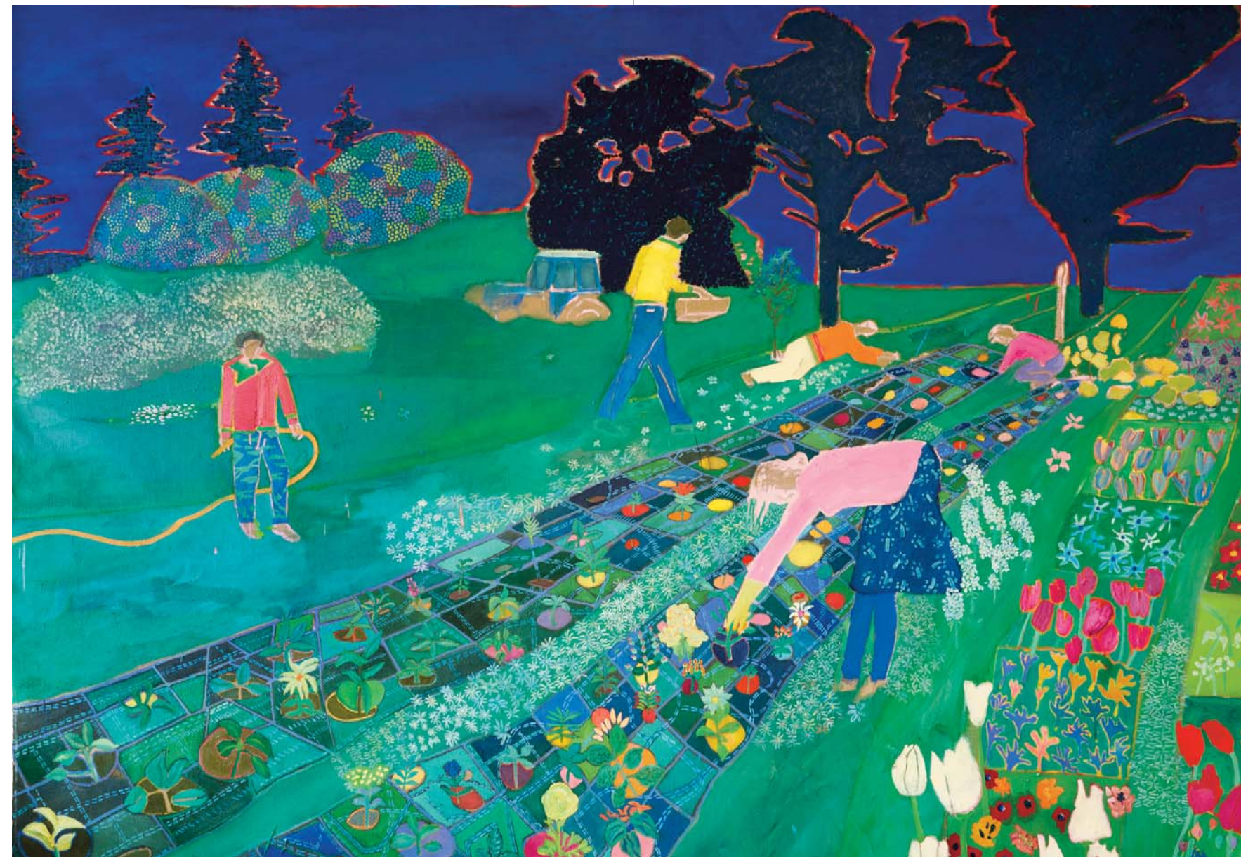
Tom Hammick: Planting Out 2024 oil on linen, 180 x 269 cm

If that the heavens do not their visible spirits Send quickly down to tame these vile offences, It will come, Humanity must perforce prey on itself, Like monsters of the deep.