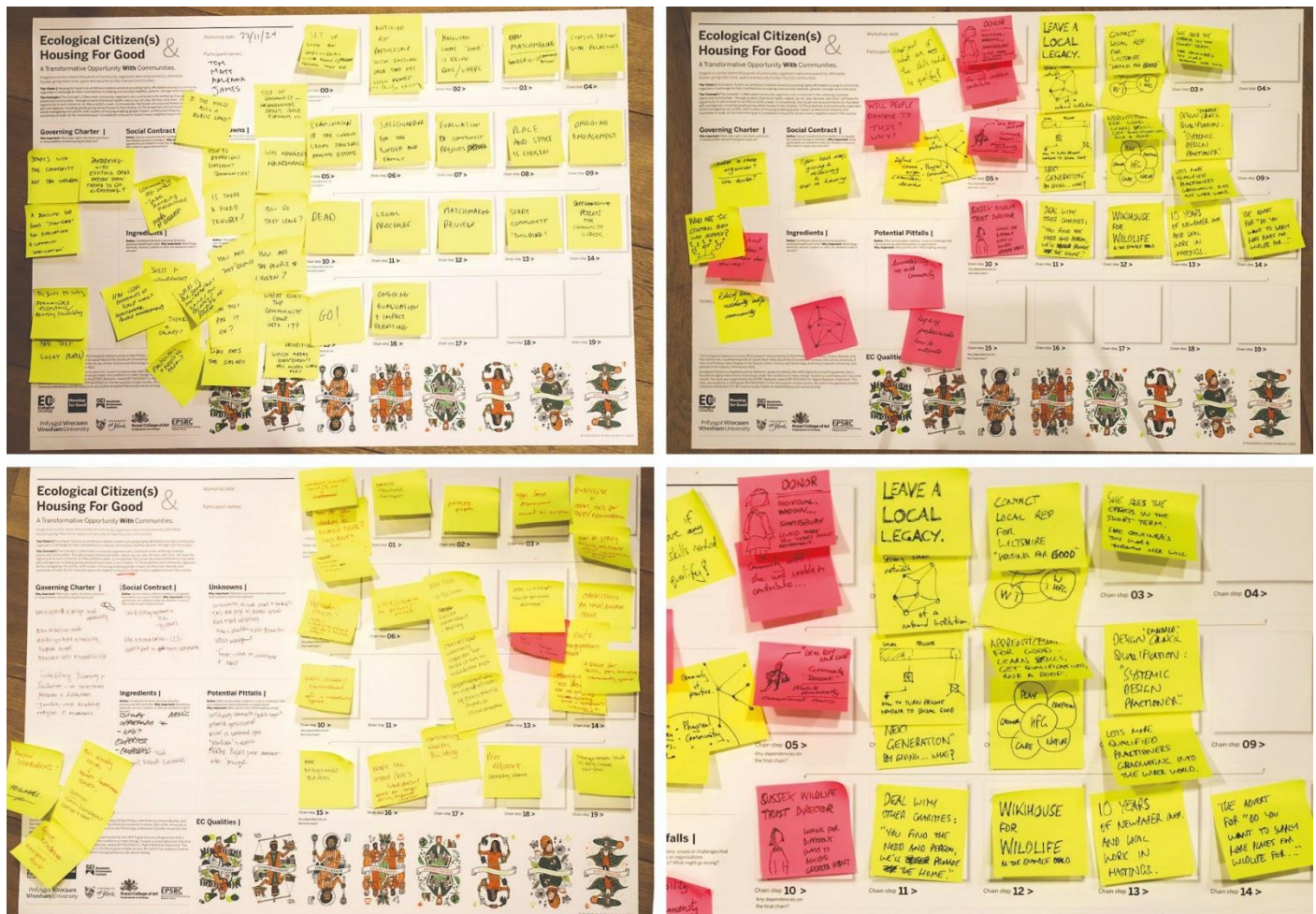
Figure 4; Mapping work from the Toynbee Hall session.