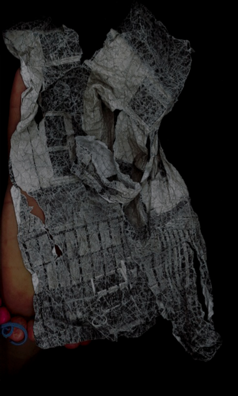
...bit thi' hinkin' aat remains, an thi' spikkin inside are nae fit is externalised an like the matters atween a liminality o something or ither is aire present aye deferred bit isnae iver absent...