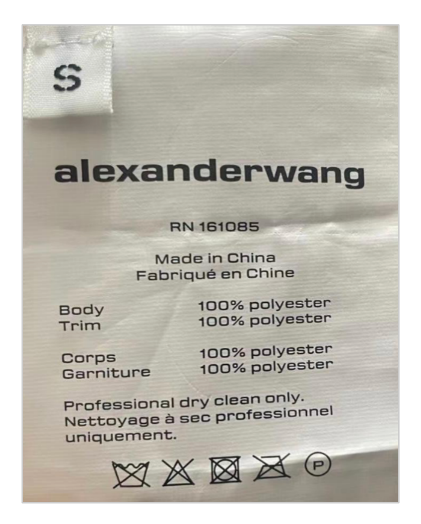
Figure 2. Analysing items of clothing from their wardrobes. £1180 Alexander Wang evening dress 100% polyester made in China.

We asked students to come prepared with photographs of 2 items of clothing from their wardrobe (see Figure 2). One from a high-street retailer or high-volume brand and the other from a high-end or vintage second-hand brand. We asked students to identify the country of origin and the fibre content (e.g., 20% cotton, 80% polyester). Following that, they discussed the pros and cons of each of the fibres (e.g., cotton as water-intensive) and the impact of mixed-fibre (e.g. cotton and polyester) content on the end-of-life phase. Many students have described this moment as a pivotal, eye-opening and awakening experience that inspired them to take action as designers in subsequent projects.