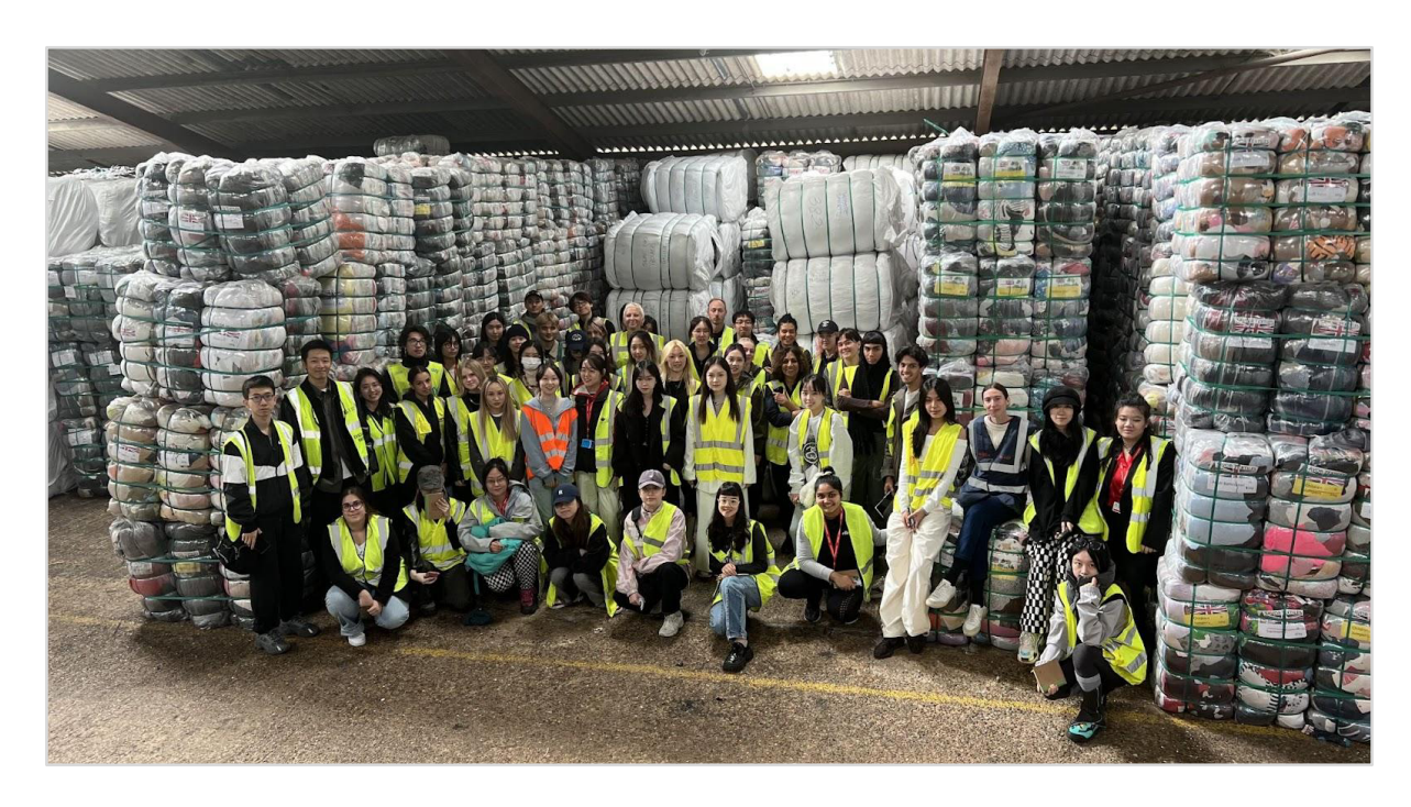
Figure 3. Students experiencing volume and the sorting of clothes into bales for export to the Global South.