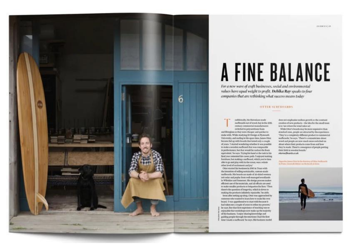
Crafts Magazine Issue 291 Restore, Repair, Renew pp 58-59.

Considering crafts and applied arts through the lens of sustainability is far from simple. However, certain common themes do emerge. The material basis of craft disciplines means that material issues are a very large part of the story. This has positive and negative inflections. Some materials (e.g. lead crystal) are inherently problematic, whilst with others their level of sustainability depends on the context of their sourcing and processing. The relatively low volumes of materials needed and the low-tech nature of the preparation processes can make localised production and processing a more viable option. Craft offers much in terms of repair expertise, and in some disciplines repair activities are established and unremarkable practices. The potential this holds for shifting expectations elsewhere could be exploited. Lastly, craft overall holds strong potential for changing attitudes towards a more circular economy, though this potential has not yet been capitalised on to the extent it could be.