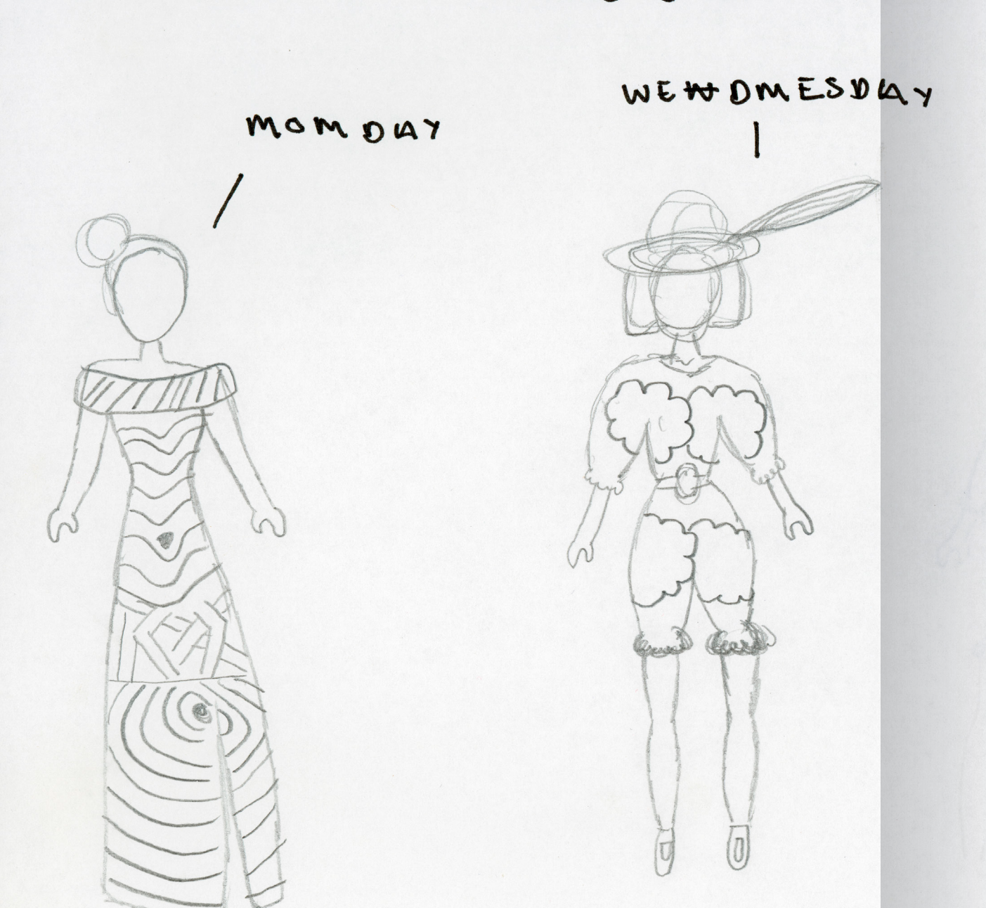
DEAR MUM THIS IS HOW ISEE TOO OW