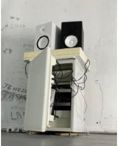
BIOME 2021 90 x 105 x 165 cm Fridge, Modified Turntable x 2, speakers, insulation board, Wagner LP, Birdsong LP