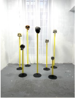
The Discovery of Beauty I, II, III, IV, V, VI, VII 2021 20 x 20 x 180 cm Resin, Clay, Jesmonite, aluminum,