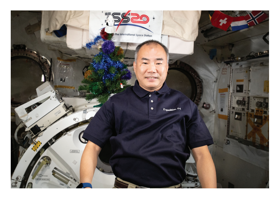
Figure 2. JAXA astronaut Soichi Noquchi wears a polo shirt on board the International Space Station. Waves and folds can be seen where the fabric might normally be expected to drape against the torso. Additional volume appears to exist between the shoulders and neck where the collar rises upwards, with an effect of appearing to flatten the curve of the shoulders. In these ways, the silhouette of the shirt does not conform to the contours of the body.

Spacewear design has so far tended to follow the example of functional garments worn by professional astronauts. A common approach to spacewear design is demonstrated in the flight suits designed for Virgin Galactic by clothing brand Under Armour (2019), with form-fitting garments that continue a tradition of close-fitting flight suits established in the Jet Age. If the designer's aim is to maintain close contact between the body and a garment, throughout the whole garment, then this approach is appropriate and wellestablished. However, this approach minimizes the tactile and visual evidence of weightlessness, by limiting the potential for separation of cloth from skin. It is reasonable to assume that space tourists will one day want to use spacewear for personal expression, just as they do on Earth. Overly functional and form-fitting designs neglect the potential for spacewear to have esthetic or expressive purposes.