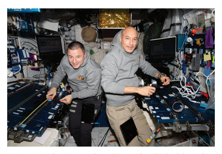
Figure 1. Astronauts Andrew Morgan and Luca Parmitano dressed in hooded sweatshirts in the microgravity environment of the International Space Station. Due to weightlessness the sweatshirts billow away from the body, with hoods rising upwards towards the wearers' heads, and fabric distorting at the chest where it is out of contact with the body.

On Earth, where we consider clothes in reference to the body, we might imagine clothes in two main states – worn and unworn – where they are draped upon and shaped by the body, or else, when unworn, crumpled, limp, and "lack[ing] fullness" (Entwistle 2002, 137). In microgravity we encounter a third state for clothes, in which they appear to have form and fullness, but adopt contours that are uncannily otherworldly. There is an impression of intermittent collision between garment and body, as if clothes are partly worn and partly unworn (see Figure 2). Here, cloth is not a second skin that is swept along with the motions of the body, rather, it is an independent form that is interrupted by the body.