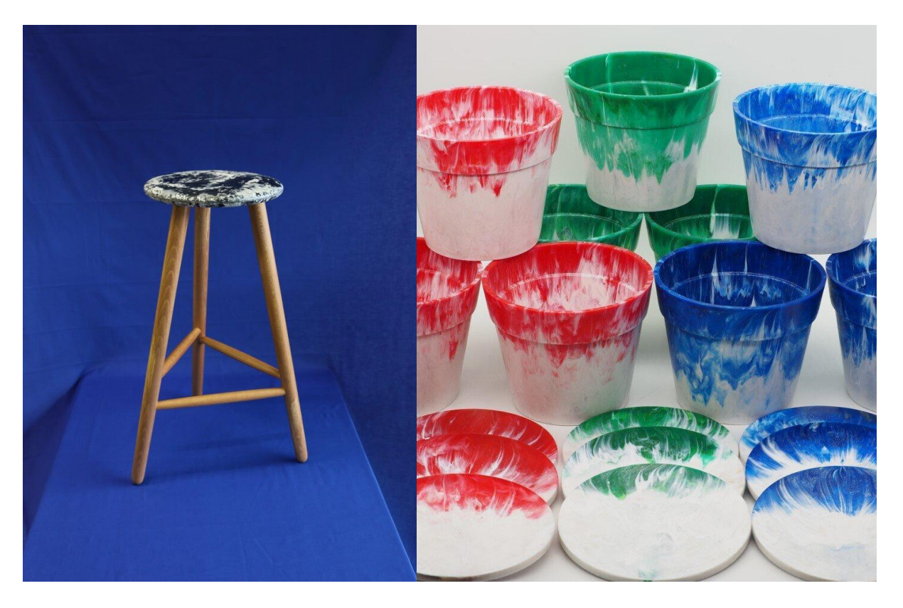
Still Life product on the left, Relic Plastics products on the right

"The very basis of our business is dependent upon Precious Plastics as it was created as an open-source framework for others to copy, adapt and expand upon. The machines we use are reiterations of the designs created by Precious Plastics, and even they even provide documents to help with basic business calculations like establishing product costs, break-even points, etc. The fact that there is a community of people connected to this work who are mostly open, friendly and share experience and knowledge is a bonus but was driven by the way that Precious Plastics has operated from the beginning."