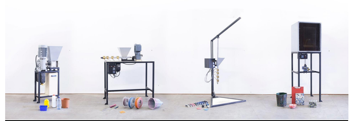
Plastic Processing Equipment

Wikipedia describes Precious Plastics (PP) as 'an open hardware plastic recycling project and is a type of open-source digital commons project' (Wikipedia, 2021). PP presents itself as "a global movement of thousands of people applying their creative genius to solve the plastic waste problem. Together. As a recycling army." (Precious Plastics, 2021).