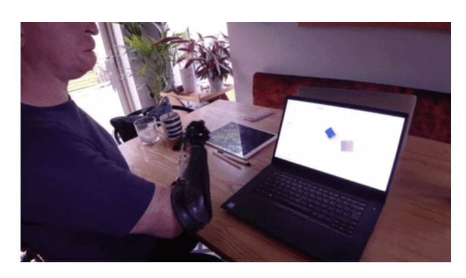
Figure 1: Experiment with a target user

embodied interface. The next subsections provide instructions on how to insert figures, tables, and equations in your document.