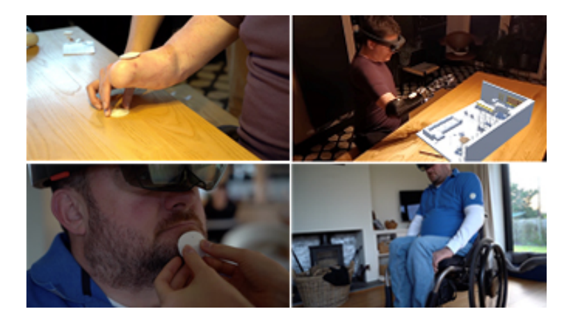
Figure 4: Some use cases of the Dots. This inclusive interface enables people with disability to interact with the Mixed Reality and Internet of Things by leveraging their own body parts and even the environment surrounding them. https://youtu.be/s8dWghnvQqo

The two dots respectively consist of one IMU sensor, one Bluetooth module and one lithium battery. The dimension of the PCB that contains an IMU sensor and Bluetooth is approximately 15*15*2 mm. The dimension of each dot is 30*45*9 mm, which is a sufficient size to contain all components.