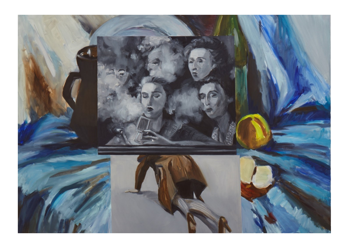
Yifei He, Solo show, Emotional Labour, J: Gallery, Shanghai, 2018. (installation 2, view 3)