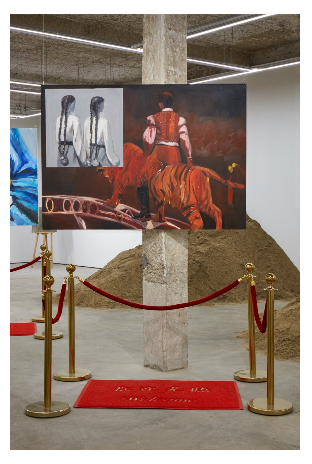
Yifei He, Solo show, Emotional Labour, J: Gallery, Shanghai, 2018. (installation 2, view 4)