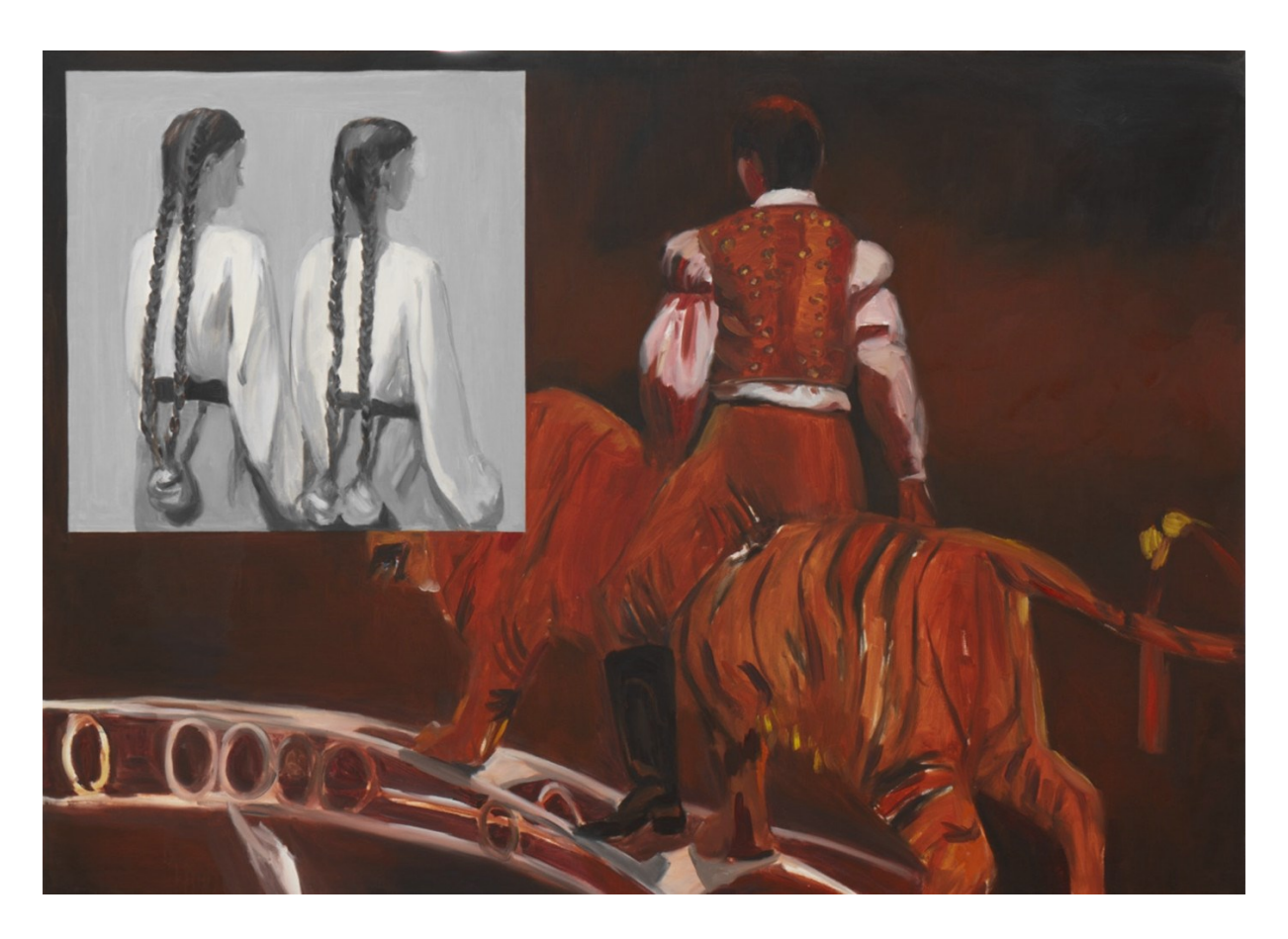
Yifei He, Solo show, Emotional Labour, J: Gallery, Shanghai, 2018. (installation 2, view 5)