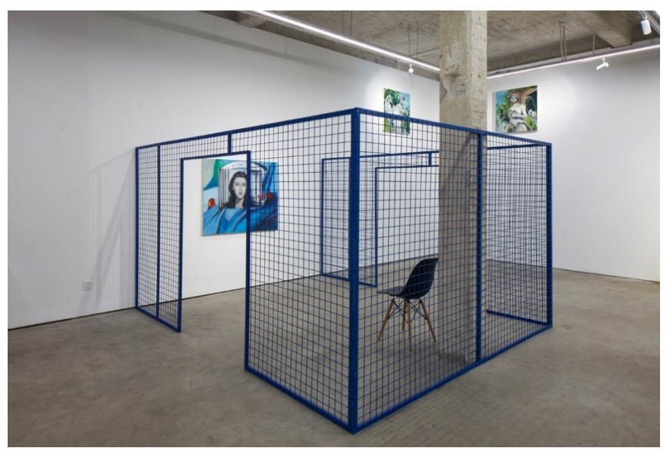
Yifei He, Solo show, Emotional Labour, J: Gallery, Shanghai, 2018. (installation 1, view 2)