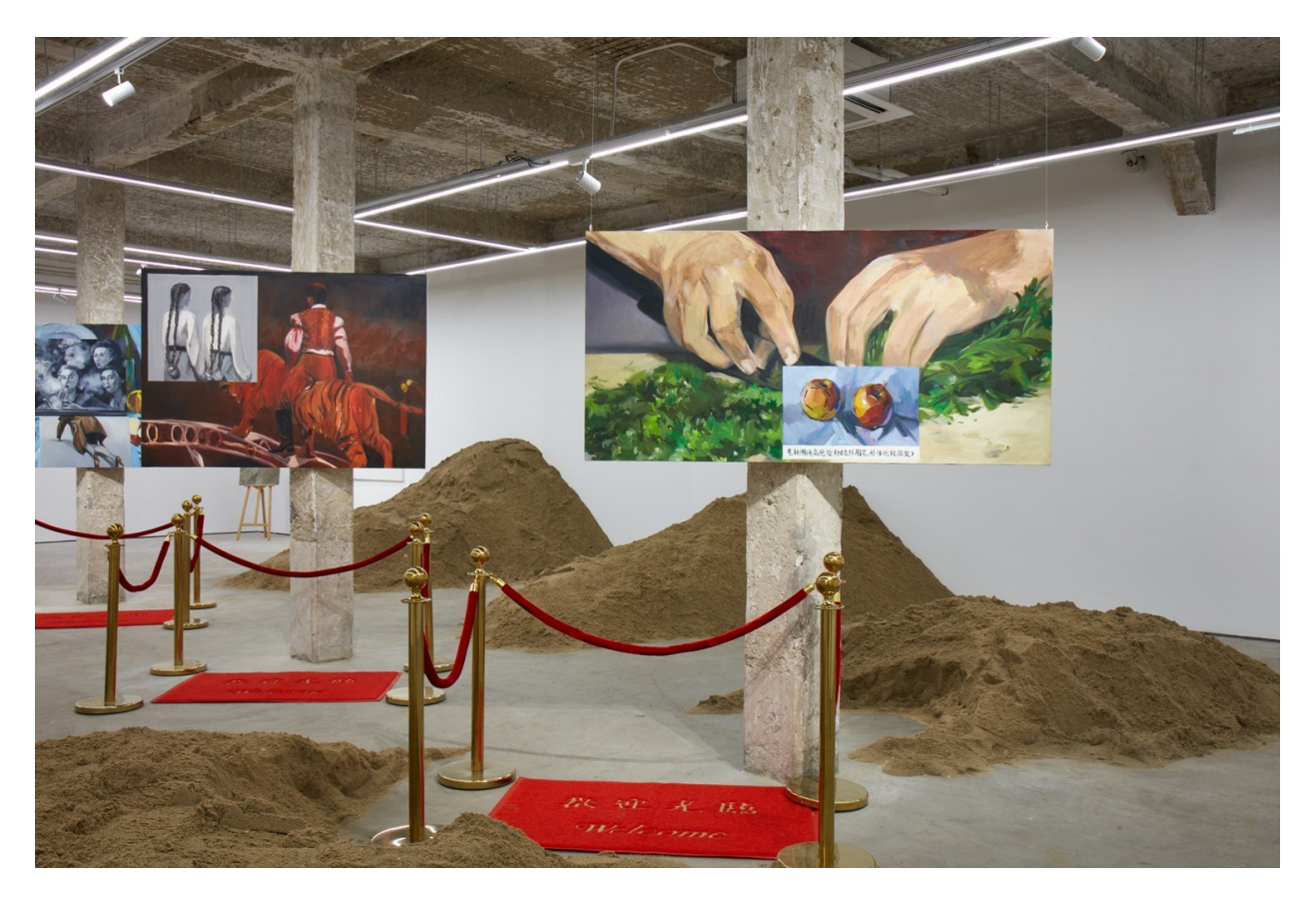
Yifei He, Solo show, Emotional Labour, J: Gallery, Shanghai, 2018. (installation 2, view 1)