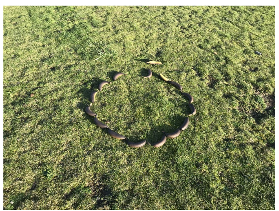
Yifei He. You ate my exhibition No.2, installation, London, 2020. (view 5).