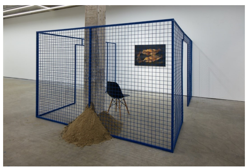
Yifei He, Solo show, Emotional Labour, J: Gallery, Shanghai, 2018. (installation 1, view 2)