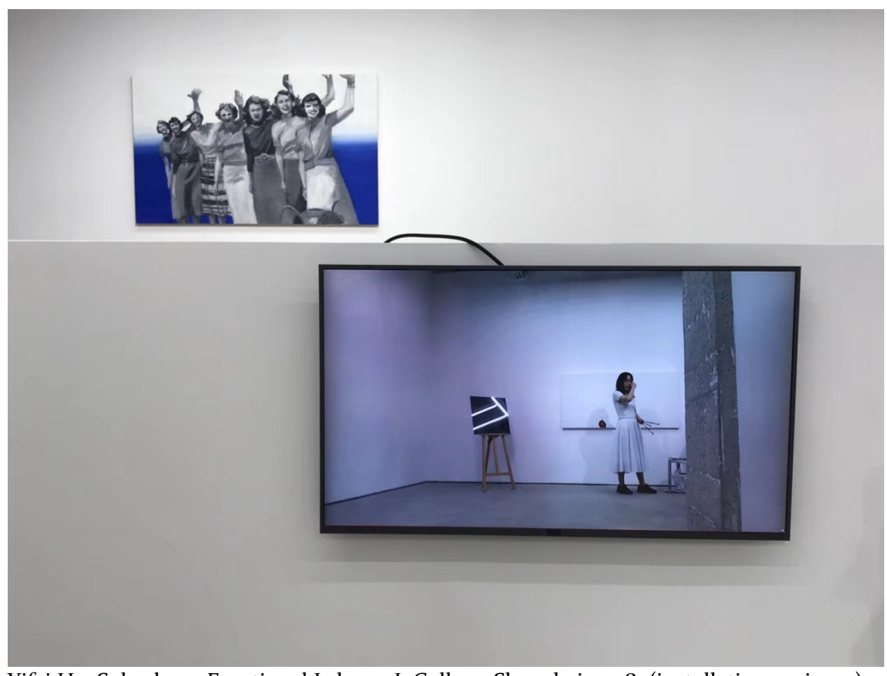
Yifei He, Solo show, Emotional Labour, J: Gallery, Shanghai, 2018. (installation 3, view 2)