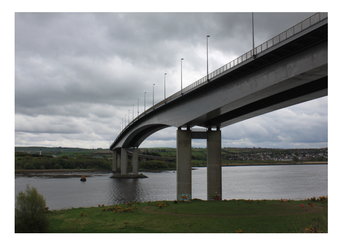
Figure 2 The Foyle Bridge (Our Future Foyle 2016)

Combined consideration of these geographical, social and historical factors have been crucial in building co-design relationships with Derry/Londonderry communities and addressing how the project is presented to the community and how consultation will engage.