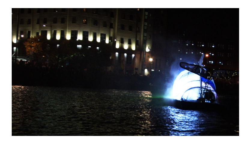
Figure 5 'Dopey Dick' on the river for Halloween celebrations

It should be noted that the consultations and activities did not directly discuss the issue of suicide. Participants did comment on incidents and the area's association with suicide behaviour but it was decided that this would not directly be addressed during these public engagements, so that the tone of the event remained positive and highlighted opportunities for future development around the River Foyle. The key question asked at these events was 'what do you want your riverfront to become?'