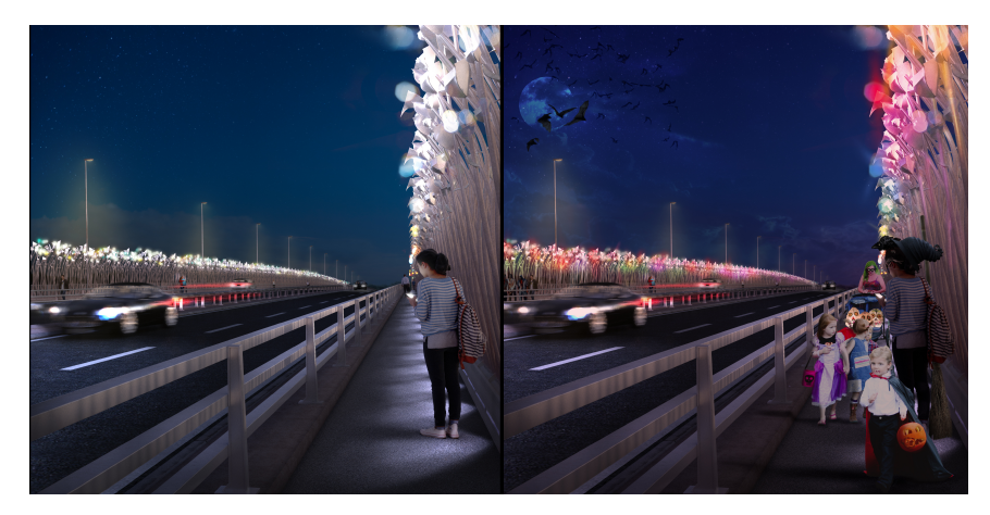
Figure 6 Proposed 'Foyle Reeds' light installation on the Foyle Bridge showing daily and special event adaptation (Our Future Foyle 2017)

All five of these design proposals directly involve the communities of Derry/Londonderry in their development, and as much as feasibly possible, the building and delivery of the proposals, ensuring a community led initiative that can proudly announce that it was conceived, built and delivered in the city for the city.