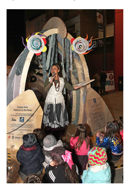
Figure 4 Dopey as community performance space (Our Future Foyle 2016)

Derry/Londonderry is also known locally as 'LegenDerry' and this status is reflected in the cities world-renowned status for hosting Halloween celebrations. Dopey would return, this time as the 'Ghost of Dopey Dick' and set up in the city centre for four days over the Halloween weekend. During this event an estimated 3,000 people visited the research space, and consultations were extended to include video interviews and recorded 'voxpops' of people's thoughts about the river and the opportunities it may present. During the Halloween event, the space also became a central point for community activities and performances including a choir, poetry recitals (Figure 4) and a music performance.