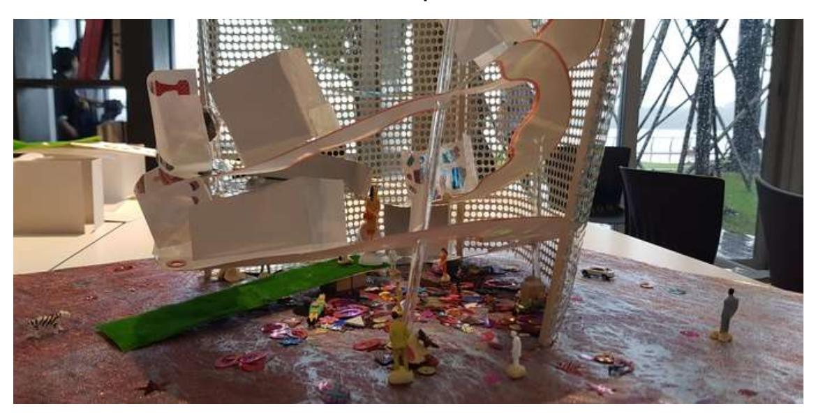
Box 5. The Art Fair shifts to entertainment and performance