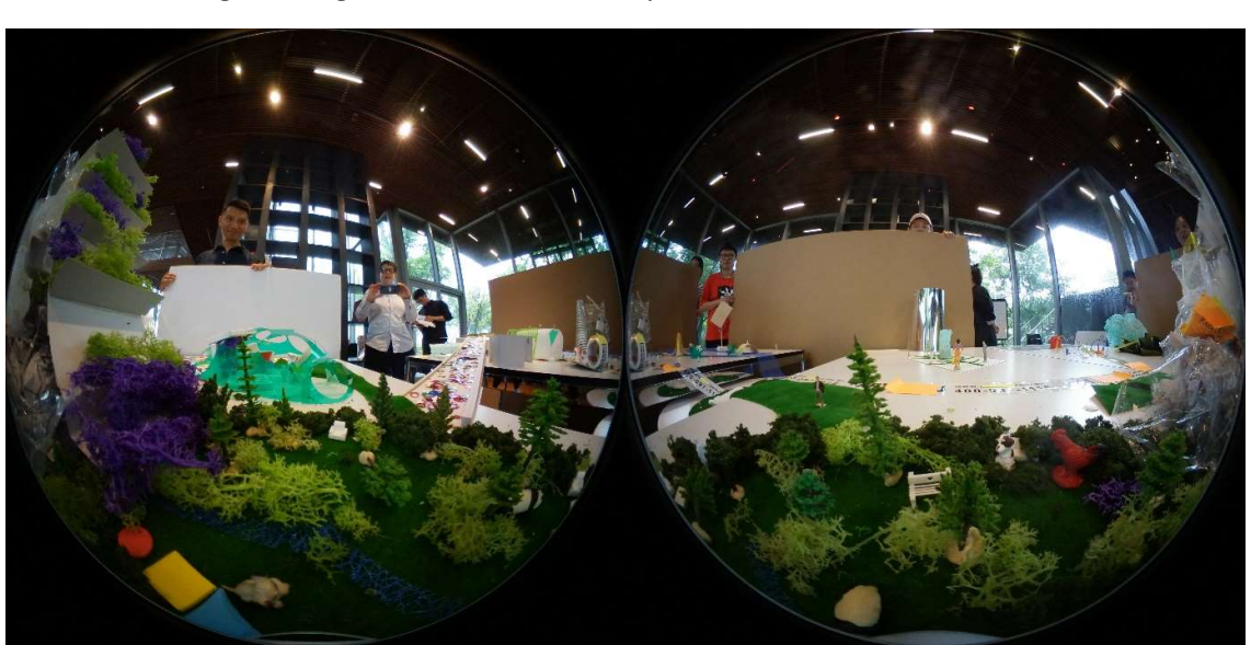
Box 9. A 360-degree image of the Art Fair conceptual model from the inside.

The participant who created this model felt that VR should replace the Art Fair completely to make it sustainable and inclusive. However, VR in its current, most predominant form, does not easily allow dialogue with others, but Social VR might change that situation in the next few years. Prototyping a Social VR Art Fair could be a useful exercise.