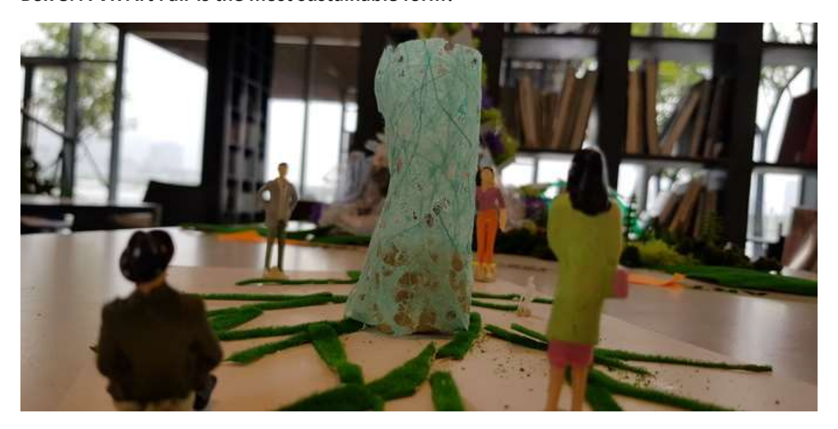
Box 8. A VR Art Fair is the most sustainable form?

The participant who created this model felt that VR should replace the Art Fair completely to make it sustainable and inclusive. However, VR in its current, most predominant form, does not easily allow dialogue with others, but Social VR might change that situation in the next few years. Prototyping a Social VR Art Fair could be a useful exercise.