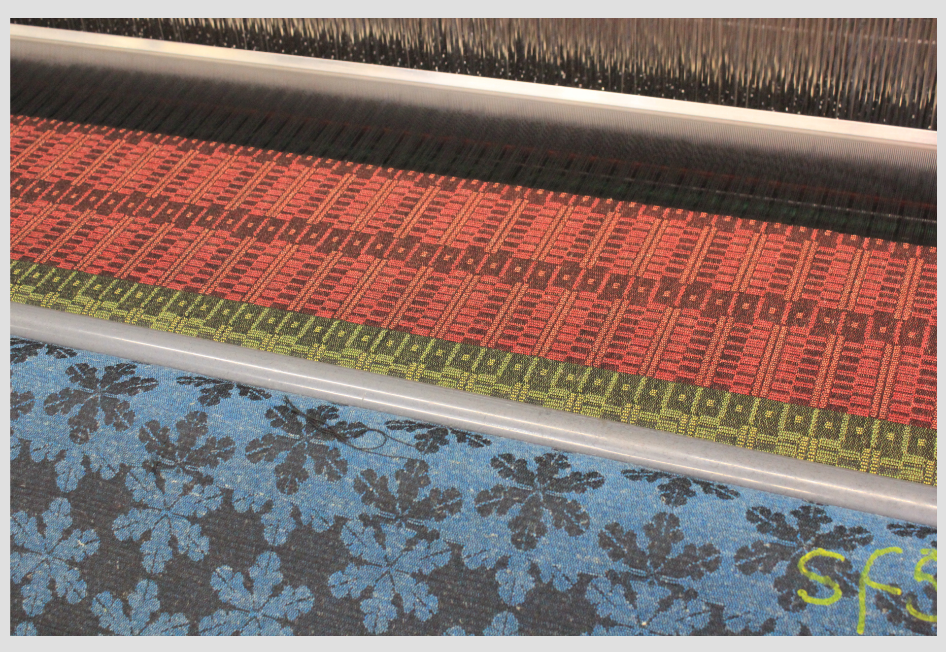
Repeat snow design; Repeat Deco in red colourway