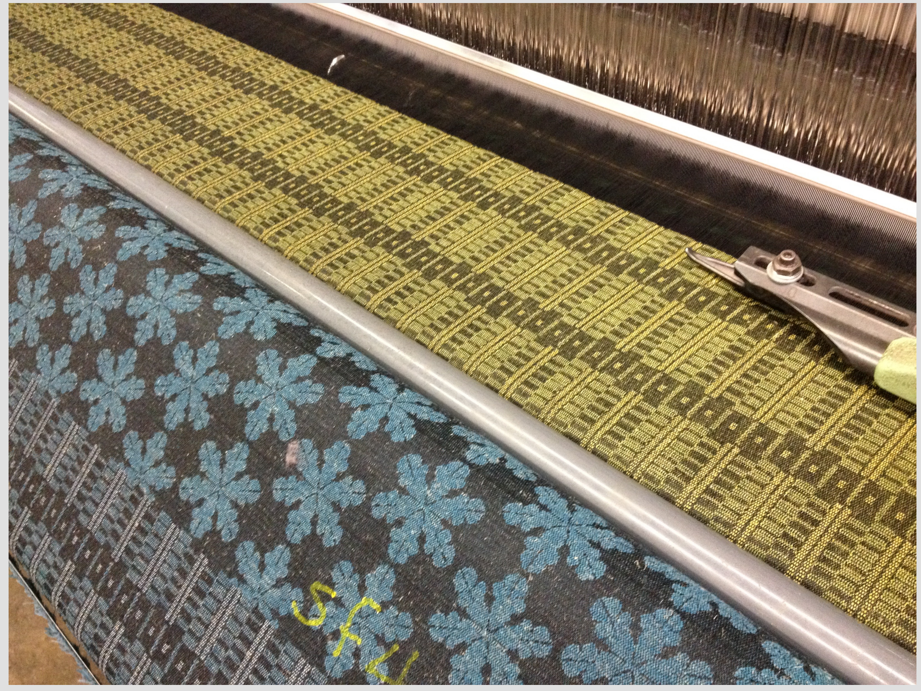
Repeat snow design; Repeat Deco in yellow colourway