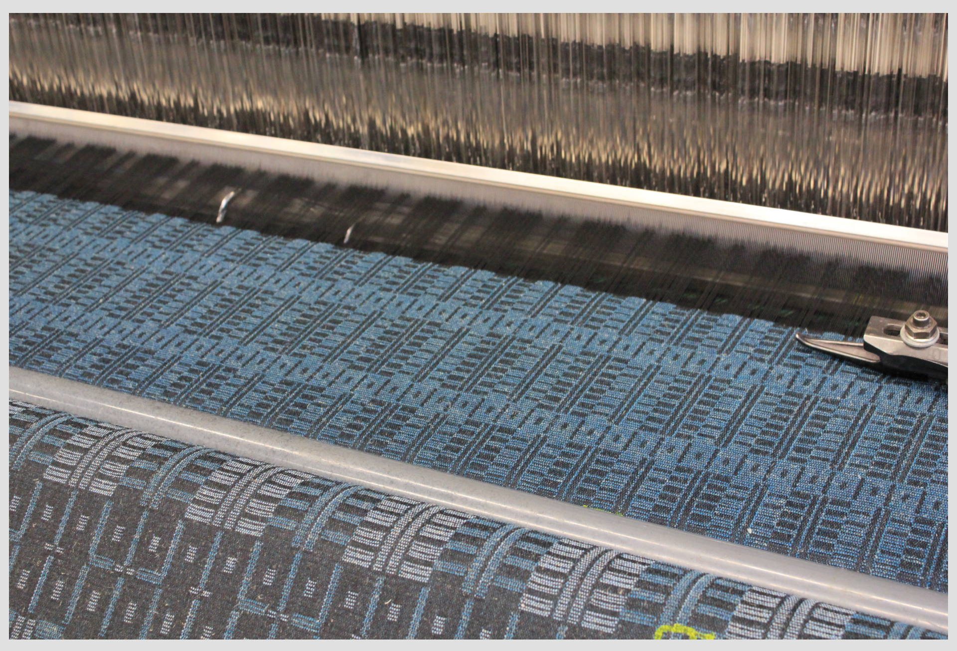
Weaving different colourways and scales of Repeat Deco design