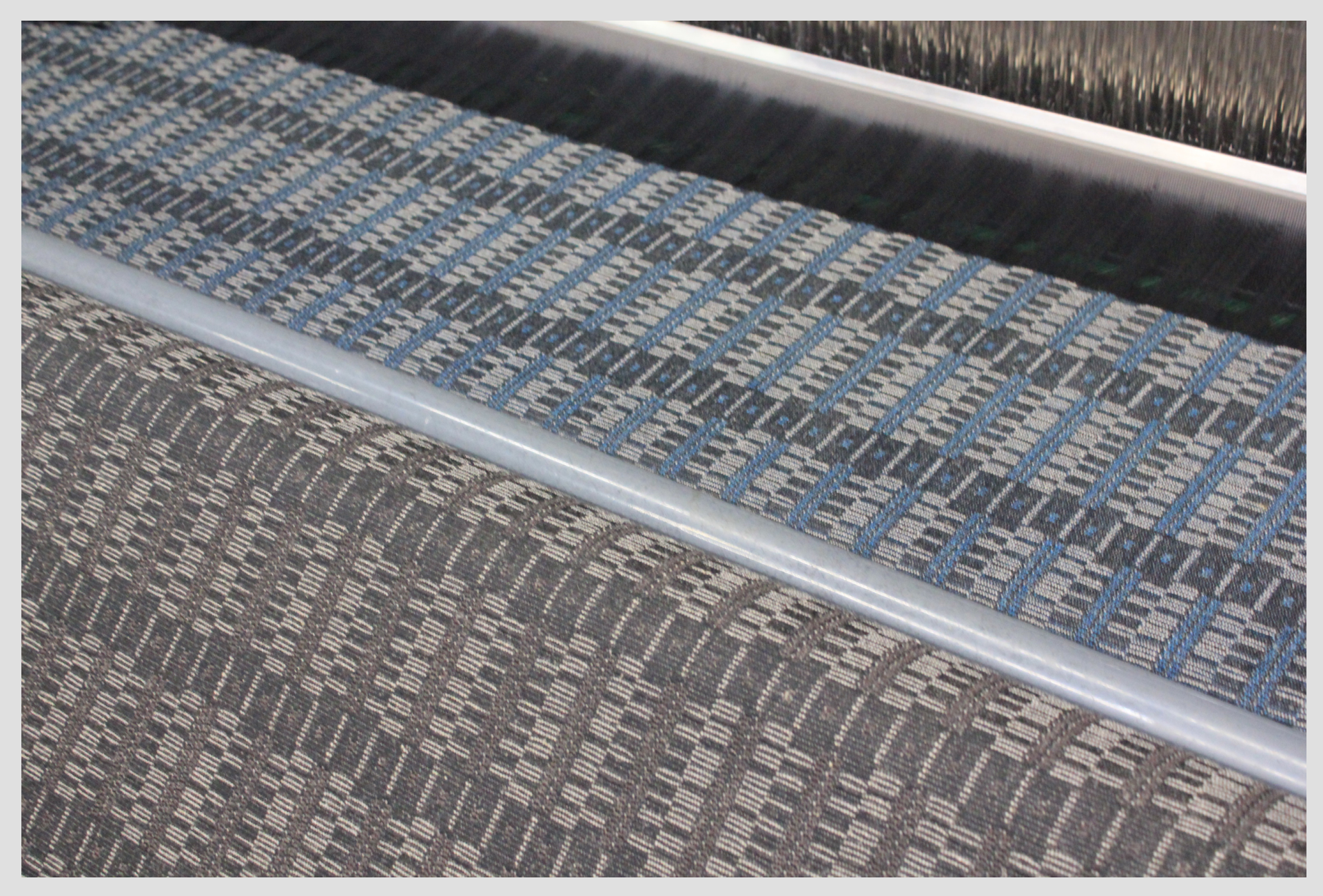
Weaving different colourways and scales of Repeat Deco design