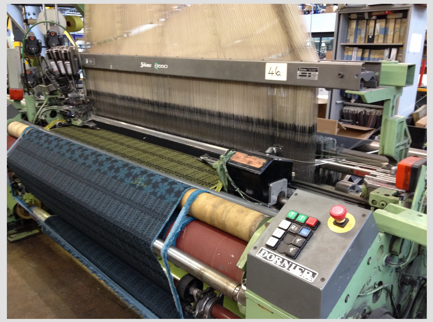
Dornier jacquard loom at Camira weaving my textiles