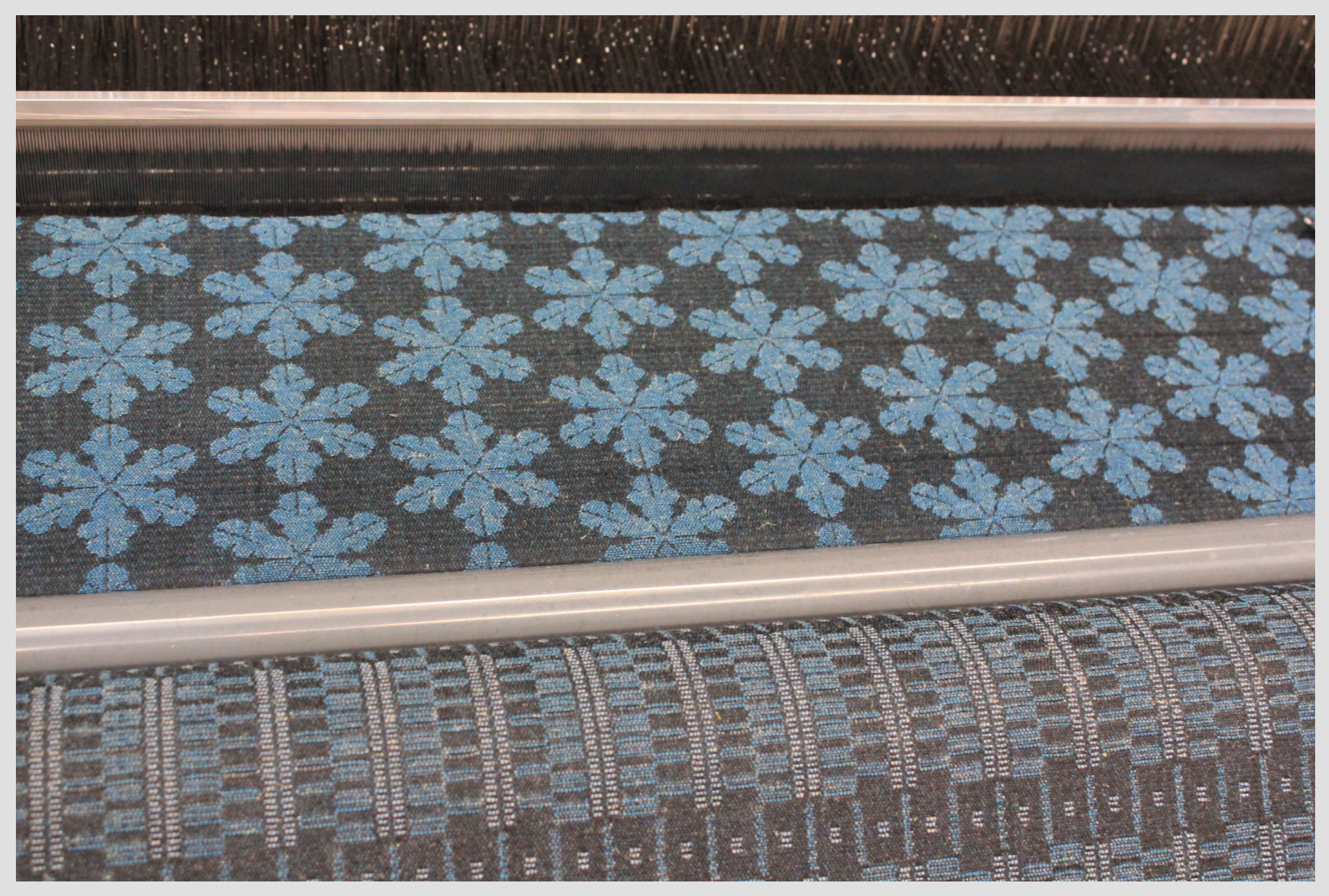
Weaving Repeat snow design