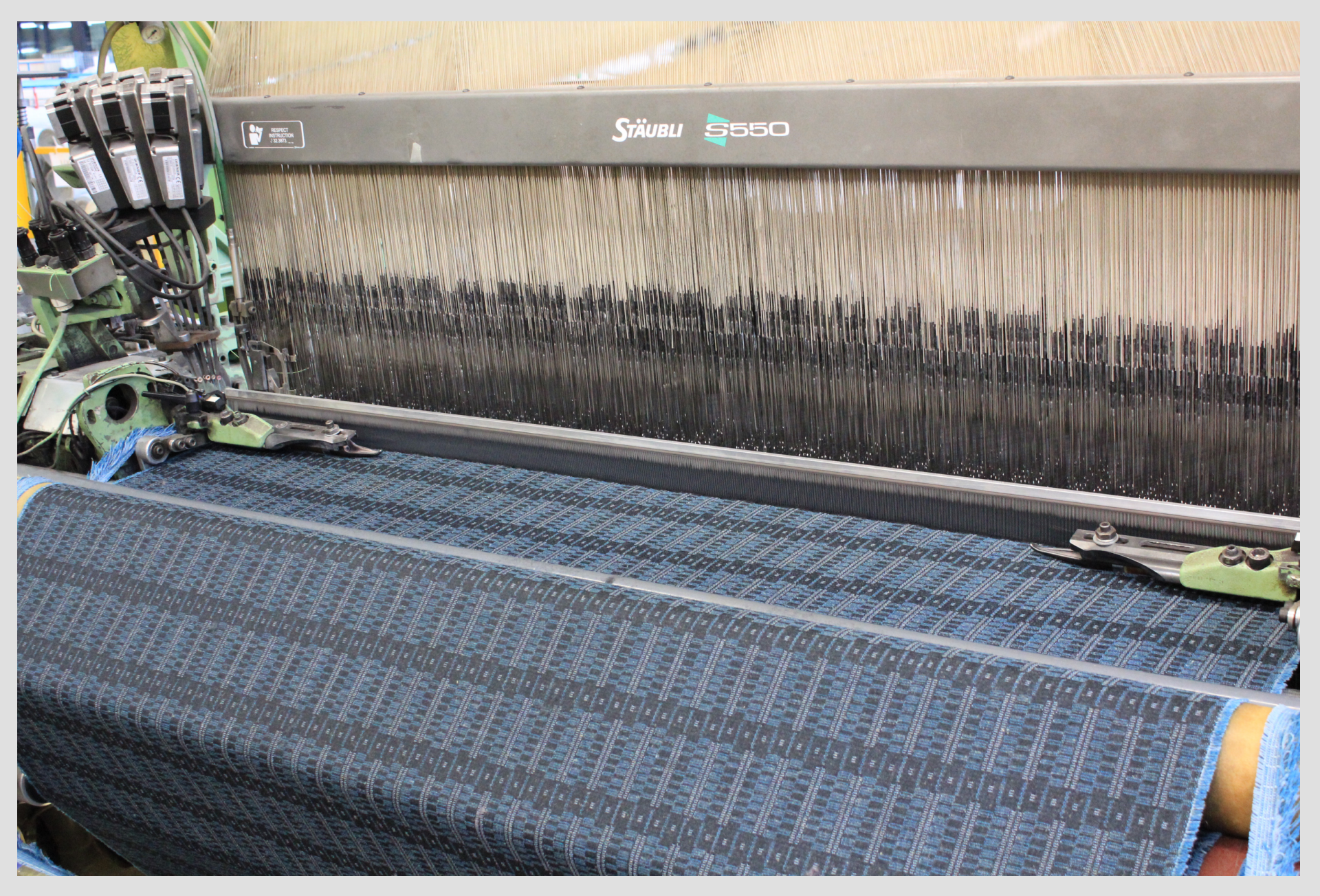
Repeat Deco design in main colourway at final scale