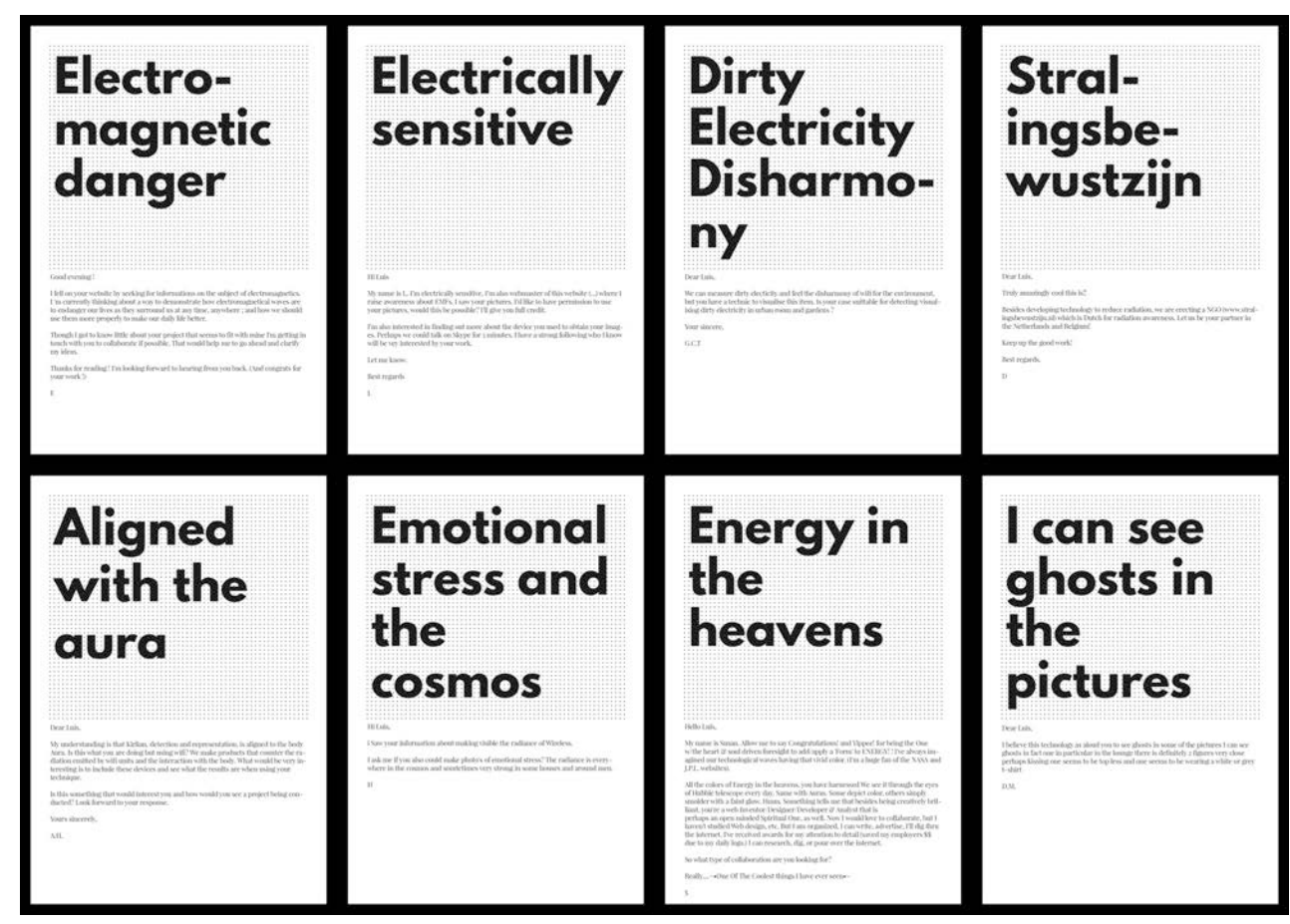
Figure 4: Anonymised correspondence showing mystical and health narratives unearthed by the project.

The ether has a mystical lineage. It is a central figure of Greek mythology, located among the primordial elements out of which the world was created, constituting the mist of light that enveloped the world