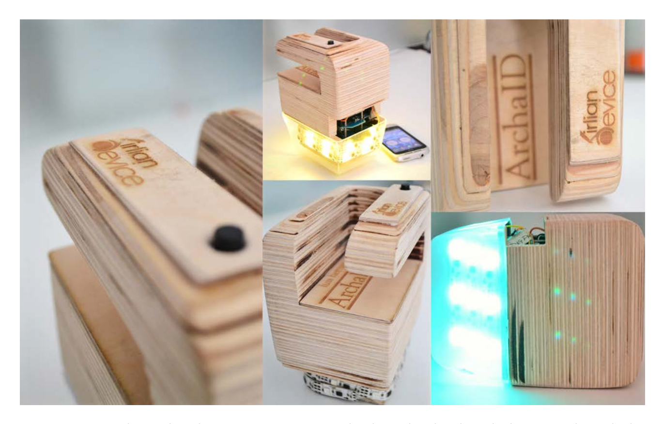
Figure 1: Composite showing the Kirlian Device, an instrument produced to explore the relationship between wireless technologies and the human body.

Digital Ethereal attempts to subvert cartographic representations by thinking of these technologies as spectres. The conceit is inspired in the cultural history of wireless technologies. The 19<sup>th</sup> century saw a period