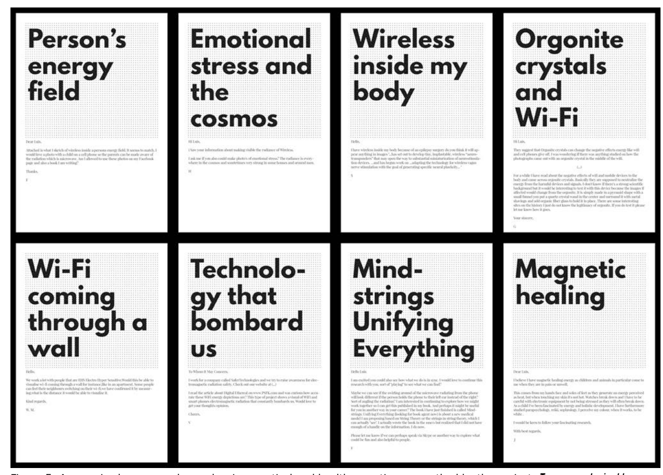
Figure 5: Anonymised correspondence showing mystical and health narratives unearthed by the project.

invisible fluids: a public imagination in which invisible technologies, such as early wireless and x-ray