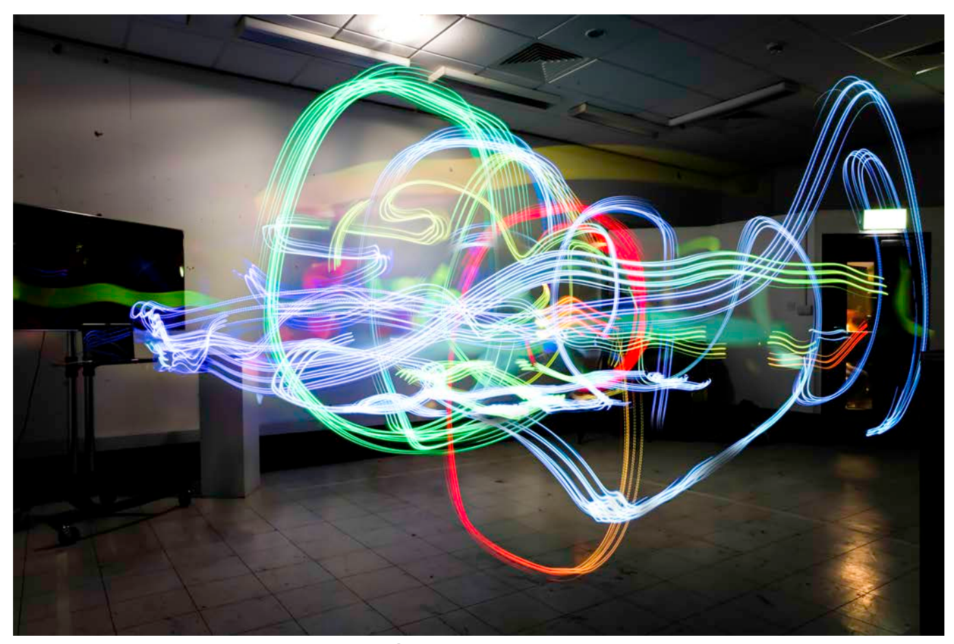
Figure 3: Image produced as part of Digital Ethereal .

distance: without a chain of direct mechanical contact. In 1820 however, Hans Christian Oersted discovered that when electrical and magnetic forces combine, they create a new form of wave that cannot be explained