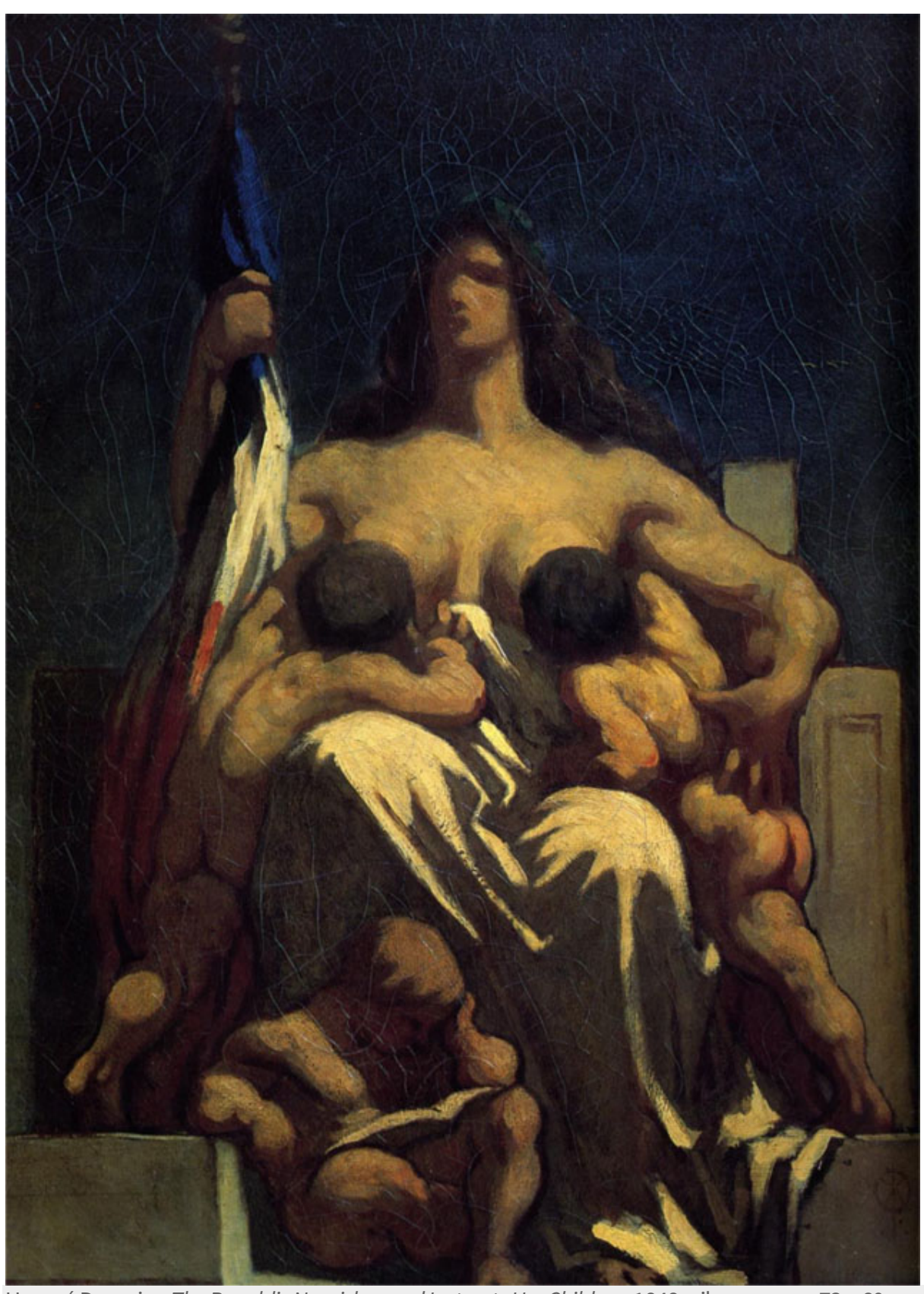
Honoré Daumier, The Republic Nourishes and Instructs Her Children , 1848, oil on canvas, 73 × 60 cm Musée d'Orsay, Paris.