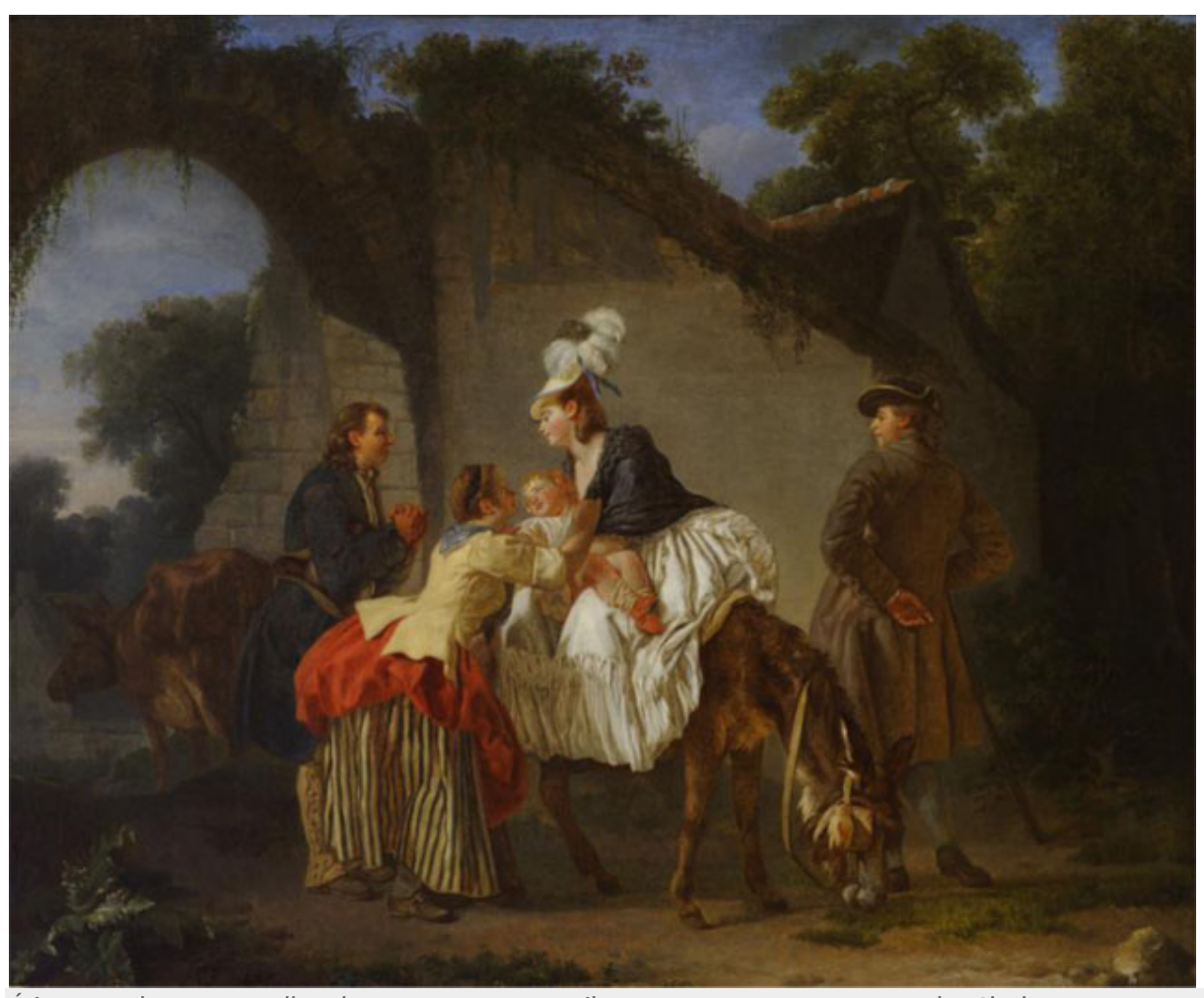
Étienne Aubry, Farewell to the Nurse, 1776–77, oil on canvas, 51.9 \times 62.8 cm, The Clark Museum, Williamstown.

While the animal aspects of breastfeeding were acknowledged in the pre-modern period, such that images of interspecies nutrition were available without concern or horror, the modern period introduces a series of separations and divisions of class and status. Attendant on this is a philosophy of Humanism dependent on hierarchies of beasts and humans, as well as a pyramidal structure within humankind, which renders these other hierarchies problematic. The very act of breastfeeding, of women feeding babies, begins to appear as an animal act, suitable only for those who live amongst animals and are themselves considered more animal-like. Why would a woman of status wish to turn herself into a Milchkuh ? At other times, and on other women's breasts, animals like puppies, kittens, piglets and monkeys have fed, to toughen up the nipples and improve the milk flow, to relieve engorgement, and to prevent conception. In the case of Mary Wollstonecraft on her deathbed, puppies sucked milk that was thought to be tainted out of her breasts, to divert poison milk from the lips of the newly born.