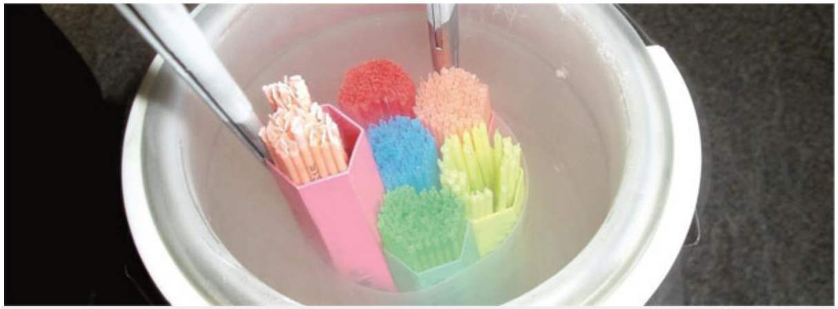
Bull Semen Straws, copyright Animal Breeding Europe < <a href="http://www.abreeds.co.uk/">http://www.abreeds.co.uk/</a>> [accessed April 2018].