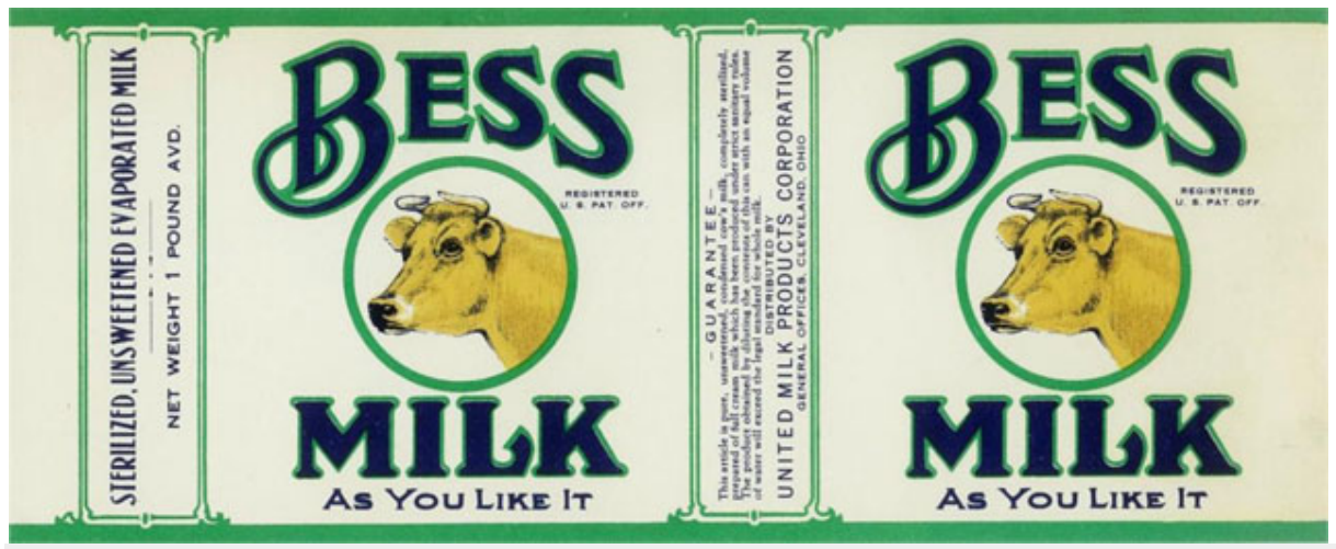
'Bess', Condensed Milk Label, 1915.

In the 1910s, evaporated milk began to be widely commercially available at low prices. Milk corporations funded clinical studies that suggested that babies who were fed on evaporated milk formula thrived better than breastfed babies, when their weight gain was compared. In North America particularly, some paediatricians promoted the view that bottle-feeding was as good as breastfeeding, based on progressive weight gain. The monitoring of growth then became a benchmark justifying the charts and weighing clinics. As infant welfare and health surveillance grew, there was a notional standard established on the basis of readings from these formula-fed babies. In today's climate, there may be more concerns that these weight gains and formulae contribute to diabetes and obesity in later life – and now feeding 'success' is as likely to be measured in achieving cerebral milestones. In the rapidly growing Asian markets, breast milk substitutes make unsubstantiated claims that the addition of vitamins will increase height, weight and intelligence. A mother from Vietnam, who spends nearly all of her income on formula milk from a German manufacturer, observed that: 'Most people here look for the weight and the height ... We always see chubby children on formula packages and on TV. We all want that.'8