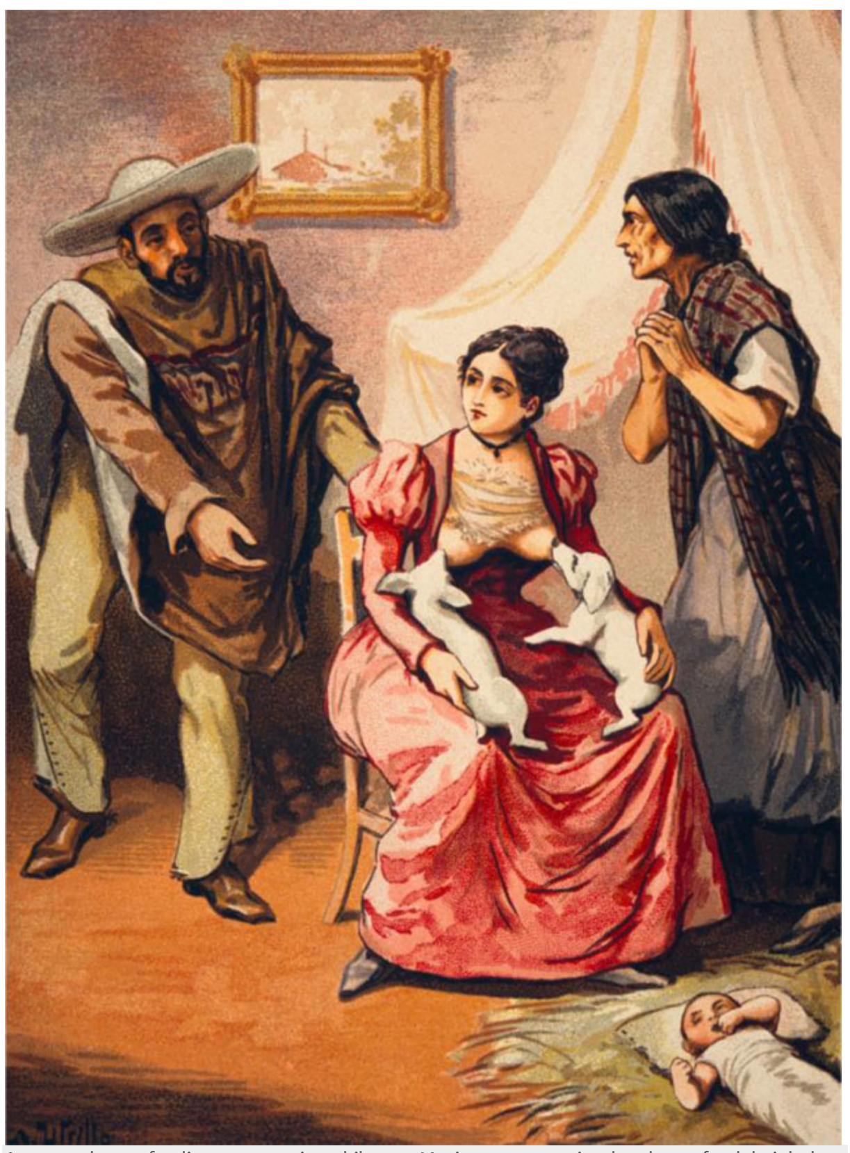
A woman breast feeding two puppies whilst two Mexican peasants implore her to feed their baby, which is lying on the floor on a bed of straw. Chromolithograph after A. Utrillo, Wellcome Collection no. 17506i.