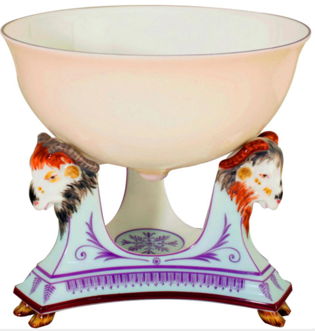
Nipple-cup known as the Breast bowl: Jatte-téton, dite bol sein, 1788, Sèvres Porcelain Manufactory, Musée National de la Céramique, Sèvres, France.

In the pleasure dairies, the women of the elite indulged in a public fantasy of being nurturing, in touch with nature, maternal, fertile – every quality that France needed to regenerate itself without suffering the agonies of revolution. It did not work. And for these elite women, a separation of significance came with it. It was that of their heads from their bodies, as the new regime overturned the hierarchy: 'au reste, après nous, le Déluge'.