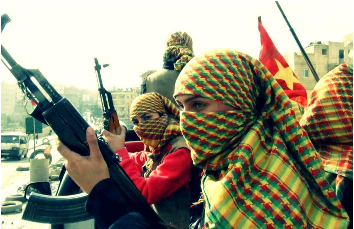
Rojava defenders, Rojava, Northern Syria, 2016.