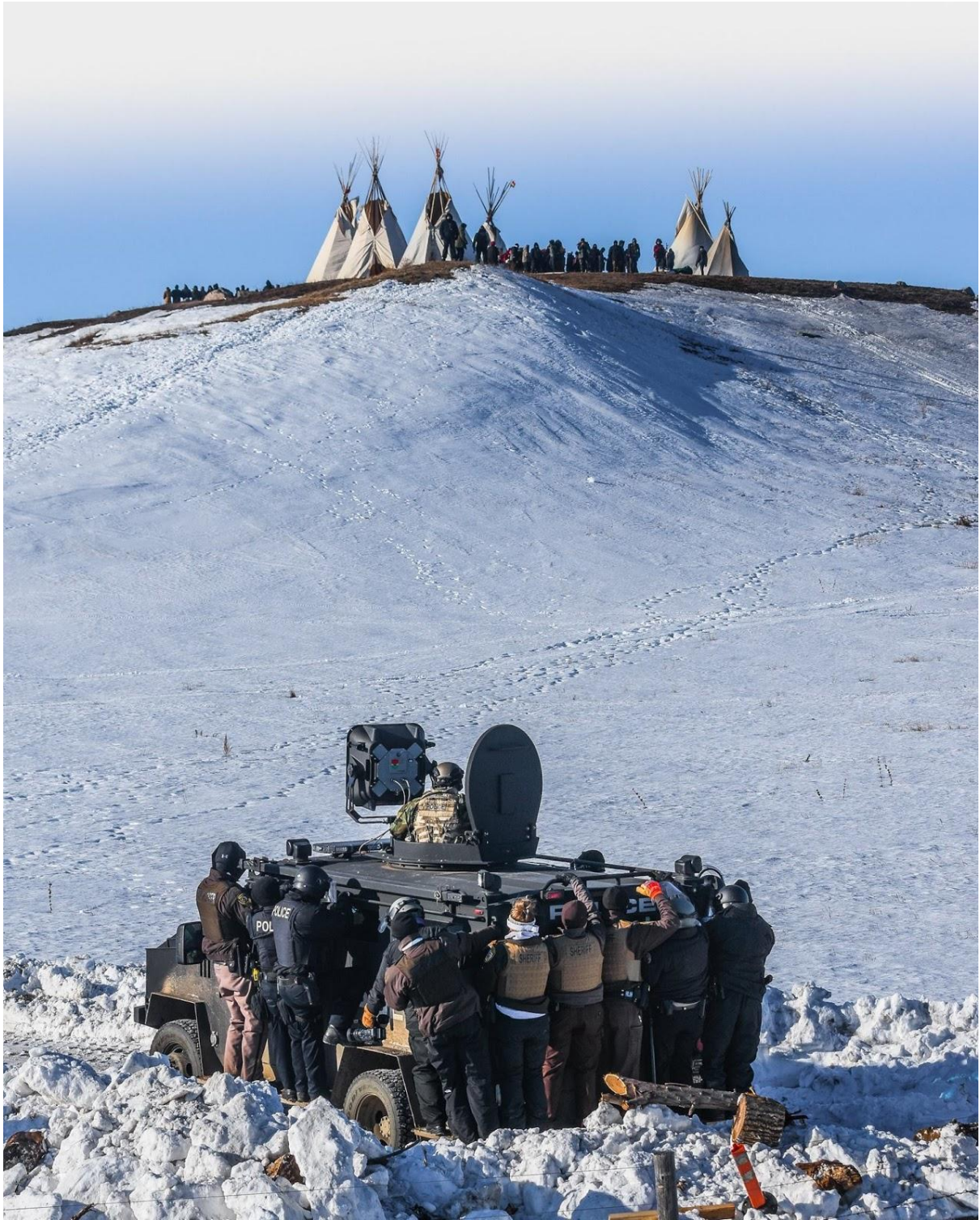
Standing Rock, North Dakota, USA. Protesters face off with police and the National Guard on Feb. 1, 2017.