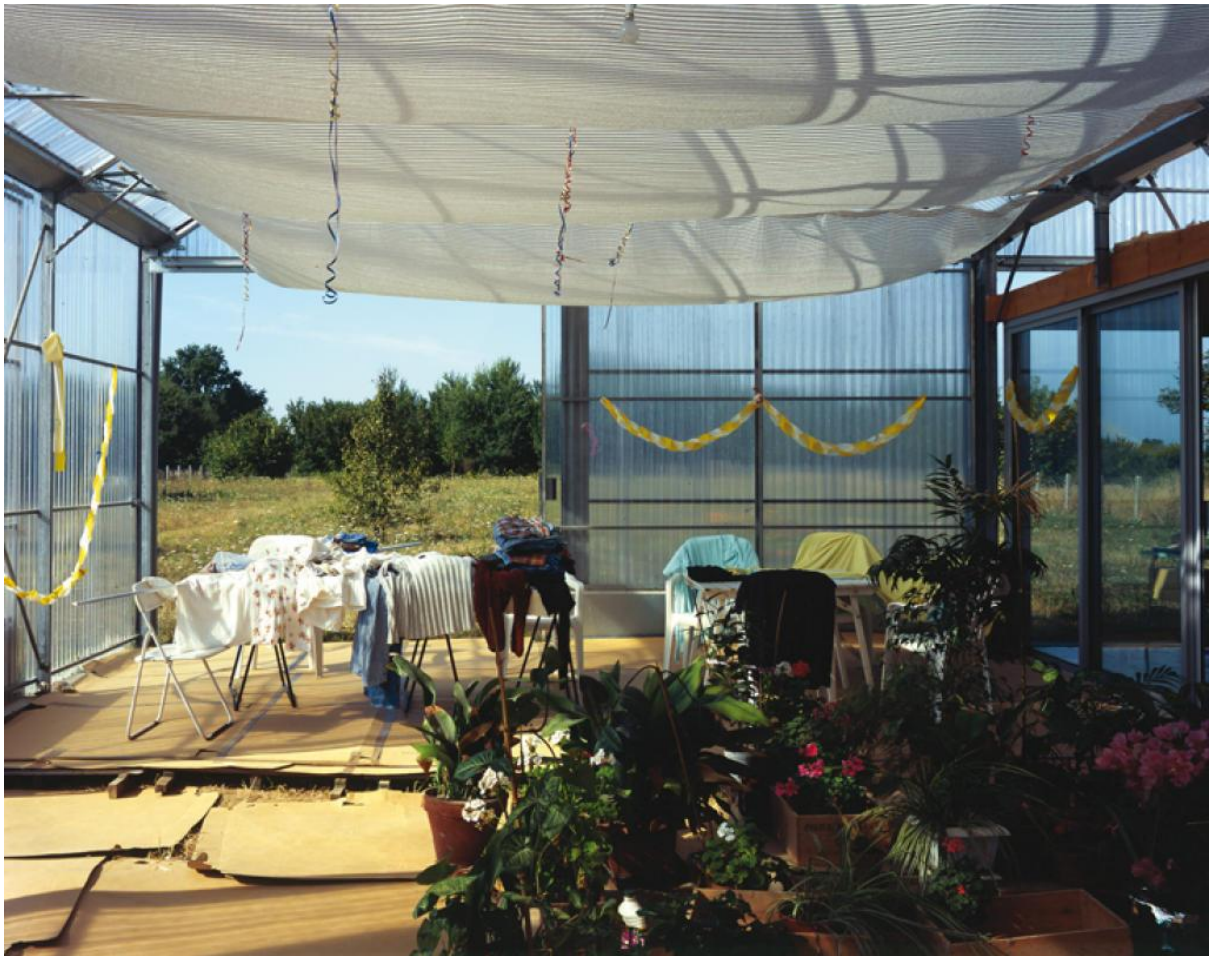
Lacaton & Vassal, House in Coutras . 2000.