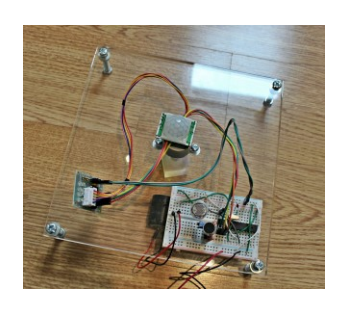
Figure 2: Silent Scene: stationary status