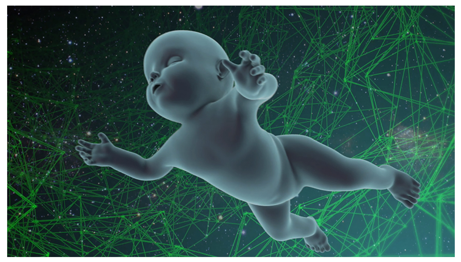
Melanie Jackson and Esther Leslie, Deeper in the Pyramid, 2018, production still.

impression of a feedback loop, a publication literally without an ending. These essays, interrelated but fully functional as standalone pieces, give the reader the option of jumping in at whatever point they like, of reading as much as they like, whether that's five pages or a hundred, and as such, the authors have created a publication that is dense with information but one that doesn't feel overbearing.