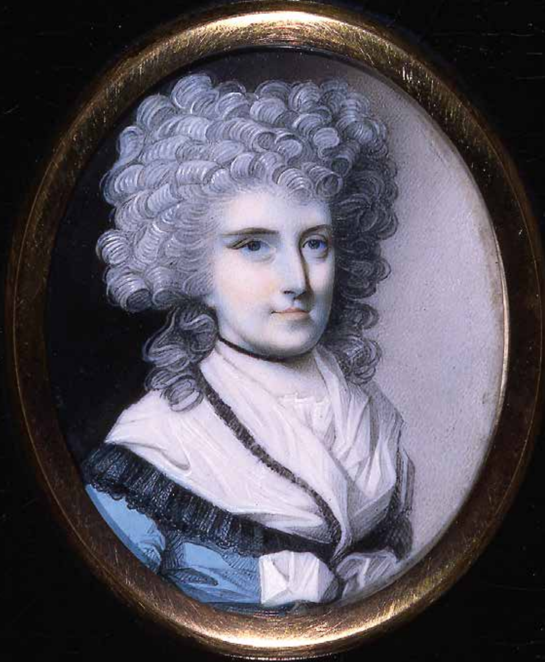
Mary Eleanor Bowes 1800, John Cox Dillman