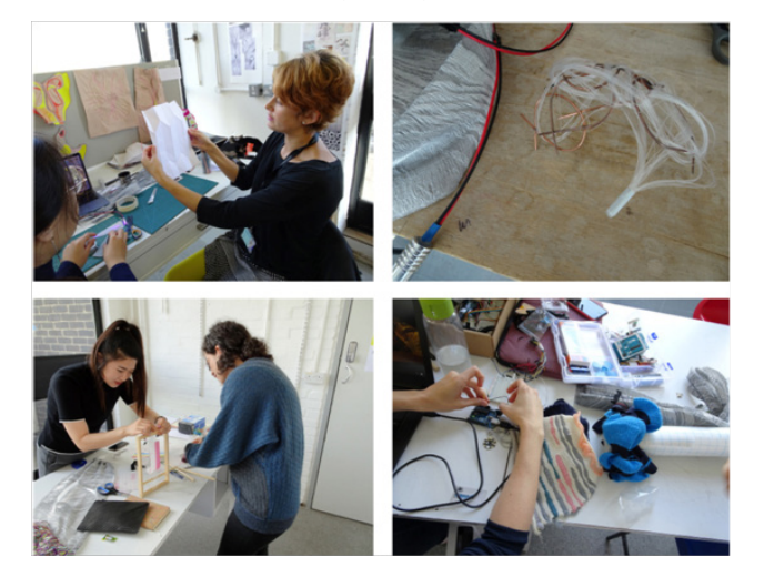
Figure 5 The case studies showed that regardless of design motivation, material development is crucial to the design process.

The case studies showed that regardless of design motivation, material development is crucial to the design process (Figure 5). Practitioners of different disciplines create innovation within their medium of choice such as fibre, textile, electronics and silicon.