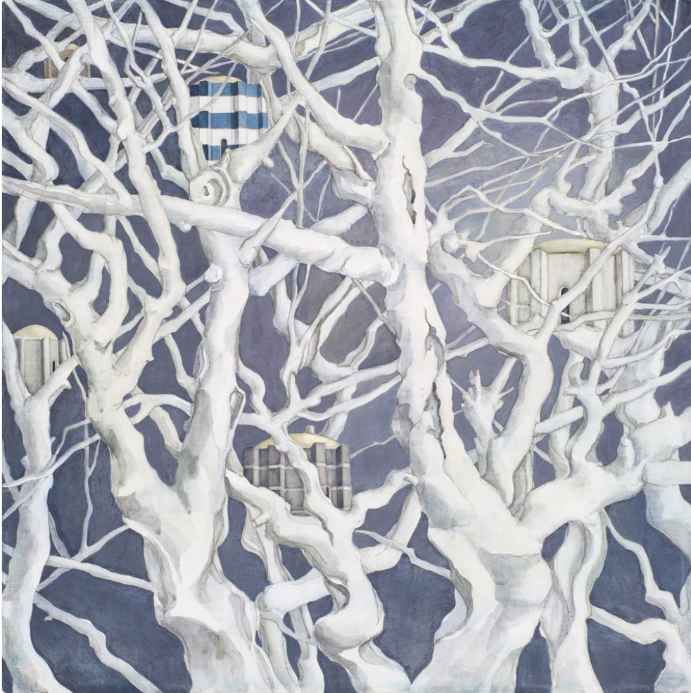
HARRIET MENA HILL Winter Night, 2016, oil on gesso, 30 x 30cm