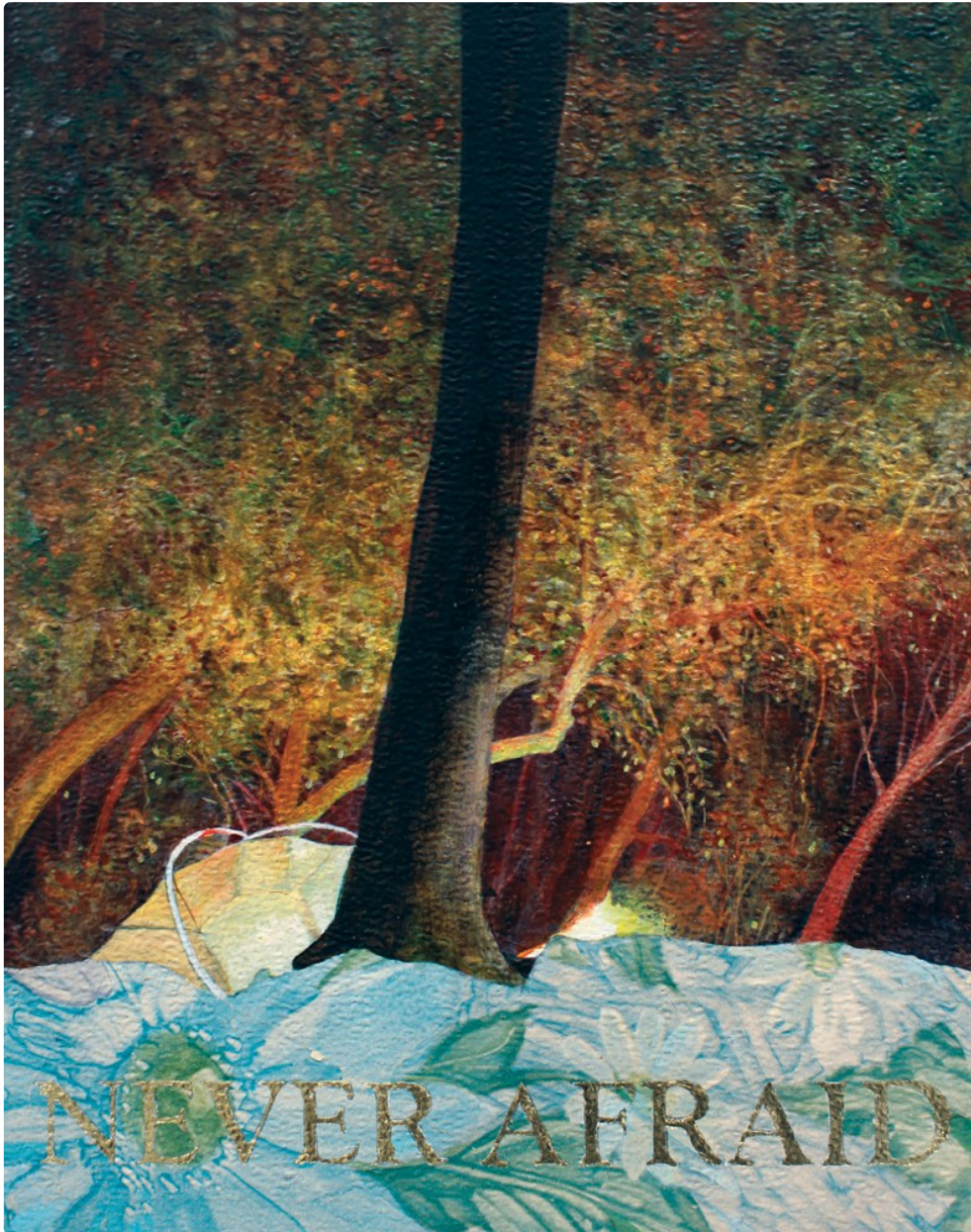
SARAH SPARKES Big Sur, 2015, acrylic and gold leaf on wallpaper, 23cm x 29cm