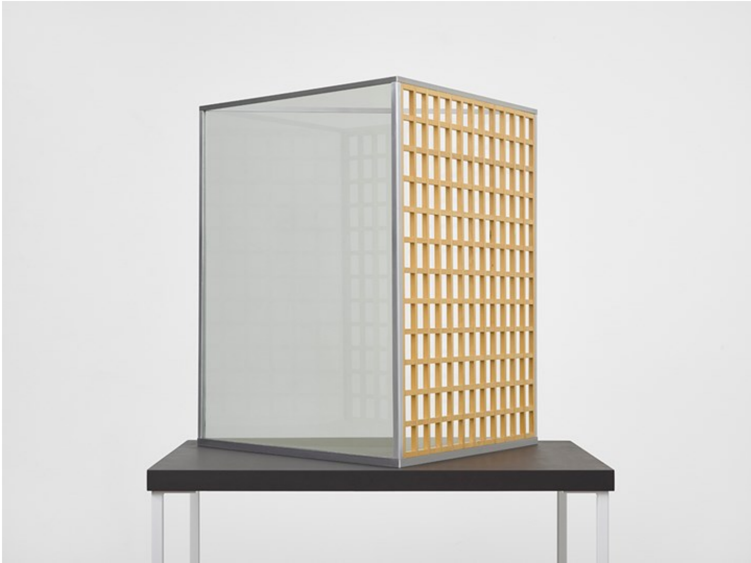
Dan Graham, Model for Triangular Pavilion with Shoji Screen (1990). Aluminium, glass and maple wood. 87 x 87.5 x 76 cm. Courtesy Lisson Gallery. © Dan Graham.

Actually, I've seen Chinese art of the eighties, which is very much like my work—conceptual art.