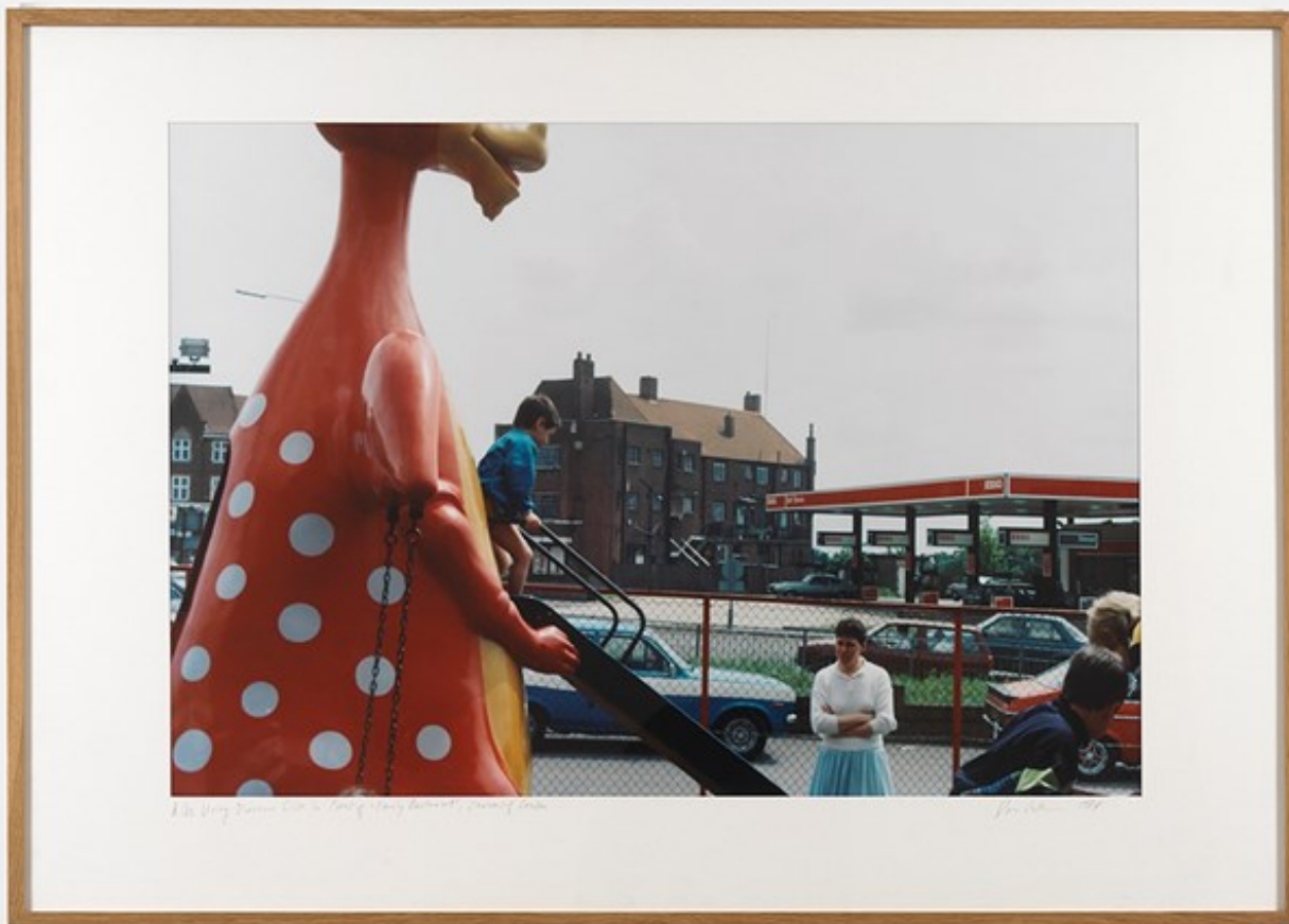
Dan Graham, Kids Playing in Playground in Front ... (1984). Cibachrome. 130.5 x 160.5 cm. Courtesy Lisson Gallery. © Dan Graham.

This brings up the fact that my best work is not exactly pavilions, but something that is functional and used. Maybe I was very influenced by Russian Constructivism. It was an important early influence.