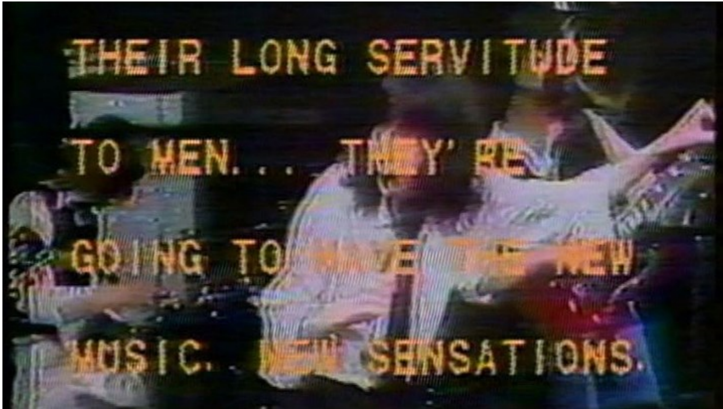
Dan Graham, Rock my religion (1982-84) Single channel video tape, black and white and colour, stereo sound. 55 min 27 sec. © Dan Graham.

It's not a work of art. It's just something I do for friends. It was begun by you.