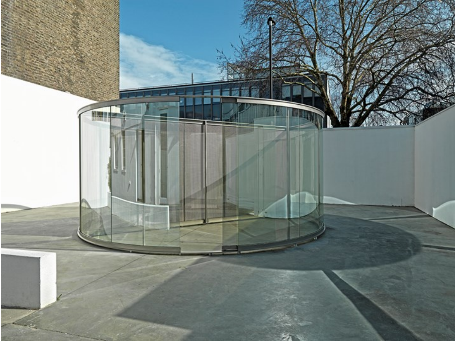
Dan Graham, 2-Way Mirror Cylinder Bisected By Perforated Stainless Steel (2011–12). Stainless steel, perforated steel, 2-way mirror. 230 cm x 520 cm x 90.6 cm. Installation view: Dan Graham: Pavilions, Lisson Gallery, London (21 March–28 April 2012).

For more than 50 years Graham has shaped a practice that encompasses curation, writing, pavilion architecture, video, photography and performance in a trans-media mode. Graham was born in Urbana, Illinois in 1942, but only because his father went to university there (Dan grew up in New Jersey). He loves rock and roll and idolises Ray Davies, even naming his pavilion atop the Hayward Gallery, which overlooks the Thames in London, Waterloo Sunset (2002–03). Ray approved.