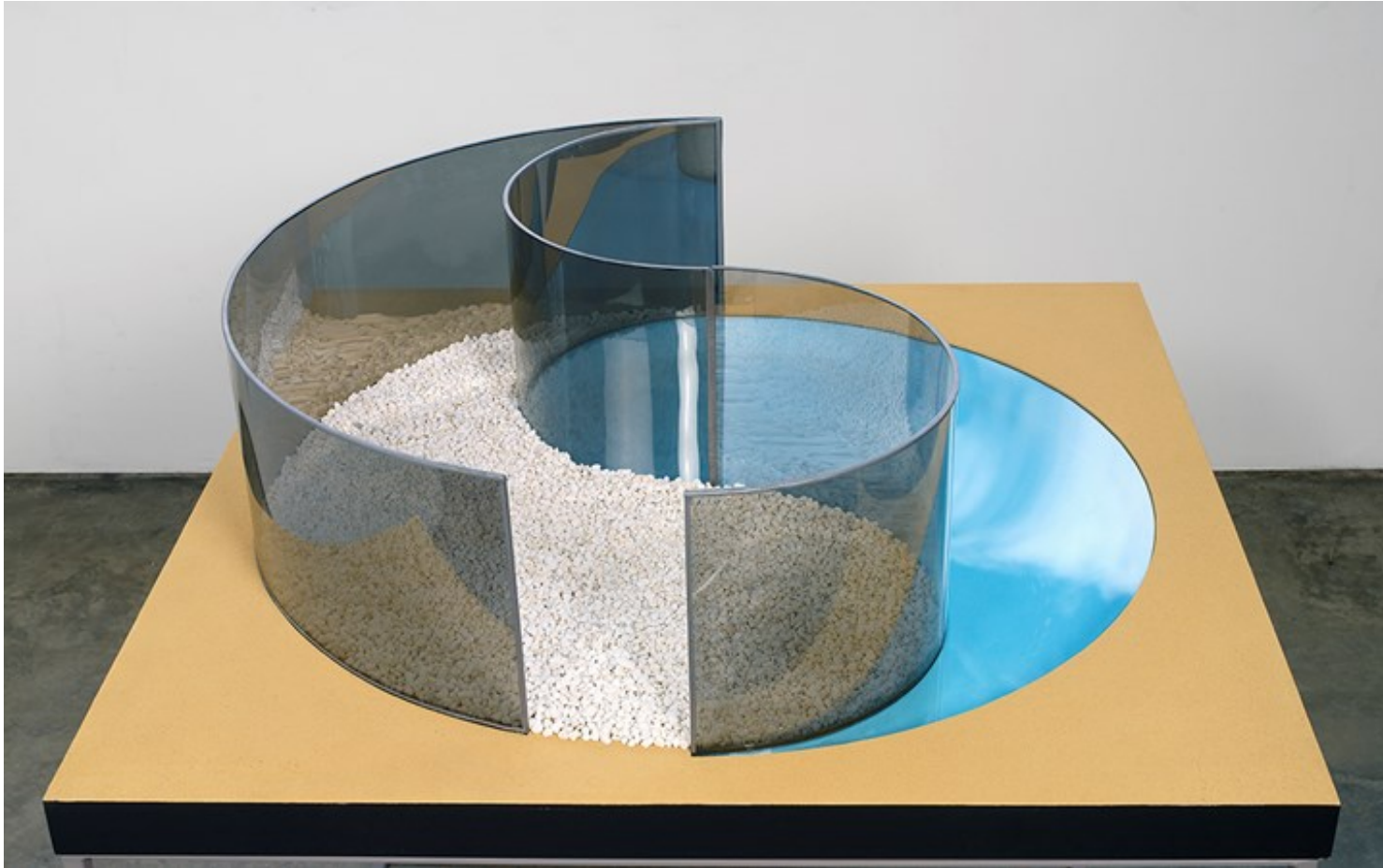
Dan Graham, Model for Ying Yang (1997). MDF, Perspex. 31.5 x 107 x 107 cm. Courtesy Lisson Gallery. © Dan Graham.

Here we talk about his first solo survey in China Dan Graham – Greatest Hits (7 November 2017–25 February 2018), which is showing at Red Brick Art Museum in Beijing. The interview took place before the show opened.