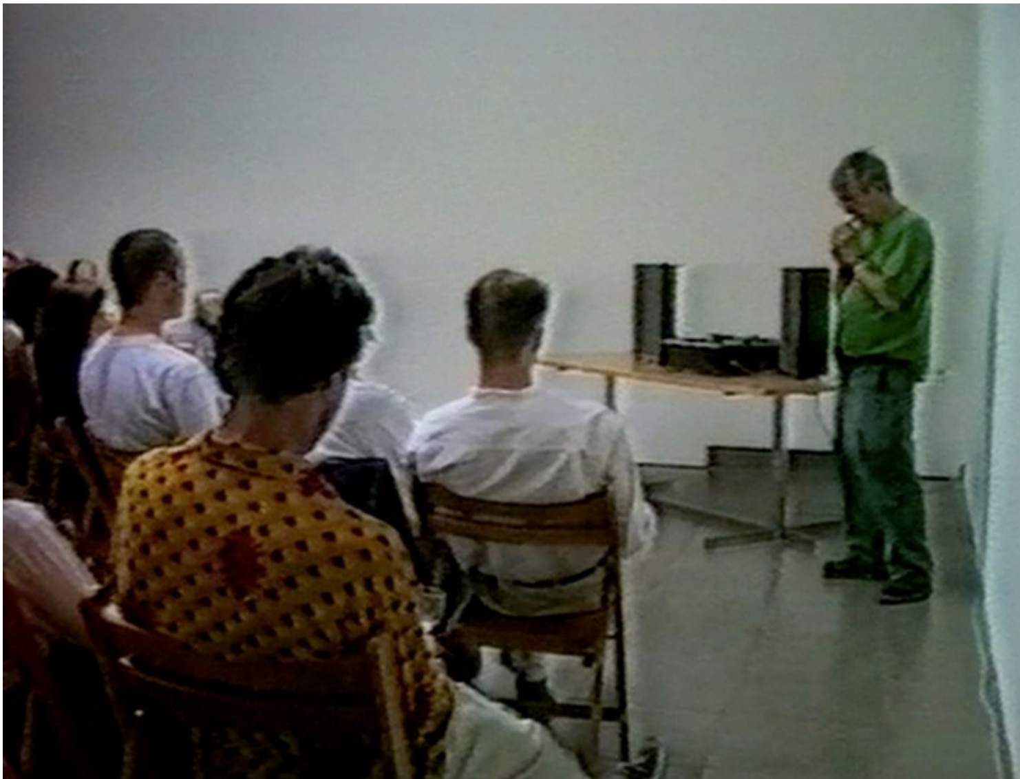
Dan Graham, Lax / Relax (1969-1995). VHS colour video.

No, because I've been quite sick. They don't want me to travel right now. I actually don't know how the show will be received—particularly the magazine page pieces because I now know that there was a kind of Chinese conceptual art in the eighties. In fact, there are great artists of the eighties who tried that in China. —[O]