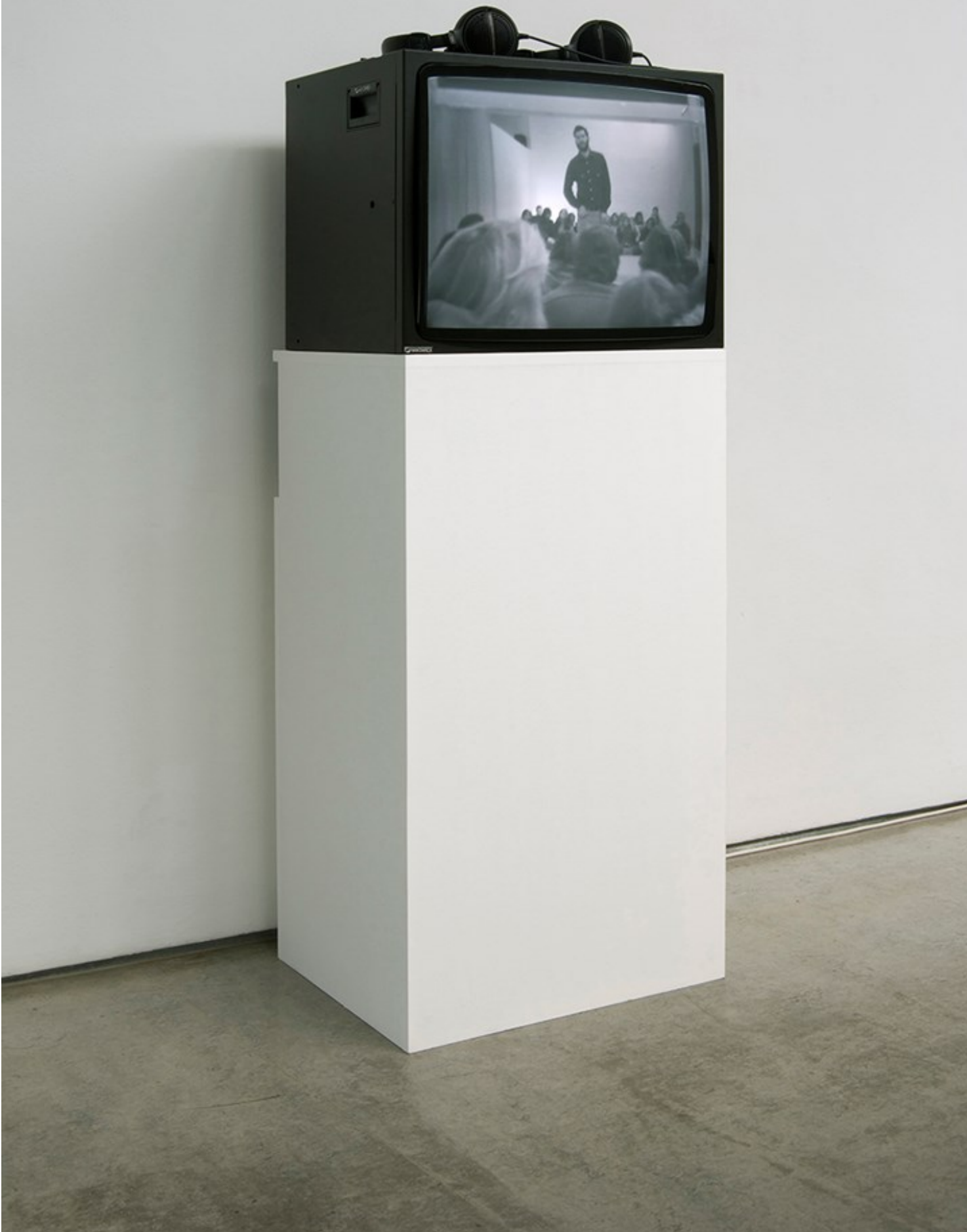
Dan Graham, Performer / Audience / Mirror (1975). Single channel black and white video with sound. Courtesy Lisson Gallery. © Dan Graham.