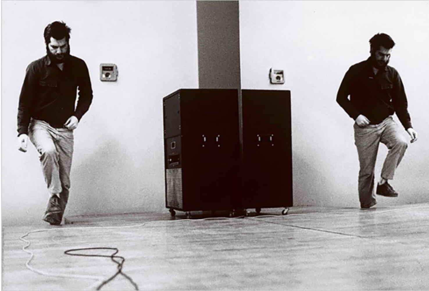
Dan Graham, Performer / Audience / Mirror (1975) (Still). Single channel black and white video with sound.

I met [Ray Davies]. I went to a dinner at Waterloo Sunset at the Hayward gallery. He had just learned to drive and we went out for a ride. He drove me to my hotel. We talked about song writers. I mentioned Neil Simon, and he said, yes, he's a big fan of his, and then Tommy James and the Shondells. I think the secret of Ray Davies and the Kinks is that the family took them to music halls when they were young.