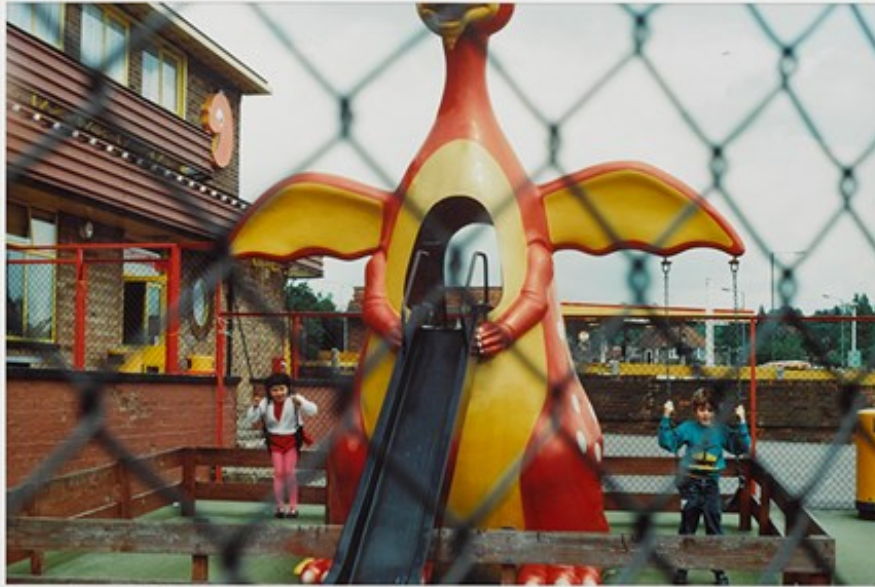
Dan Graham, Kids Playing in Playground in Front ... (1984). Cibachrome. 130.5 x 160.5 cm. Courtesy Lisson Gallery. © Dan Graham.

Absolutely. Well, your Waterloo Sunset pavilion here in London is always fun. Whenever I've been in it, there have been, if not families, different generations having fun there. I think I sent you a few pictures every once in a while when I'd see some people using it correctly.