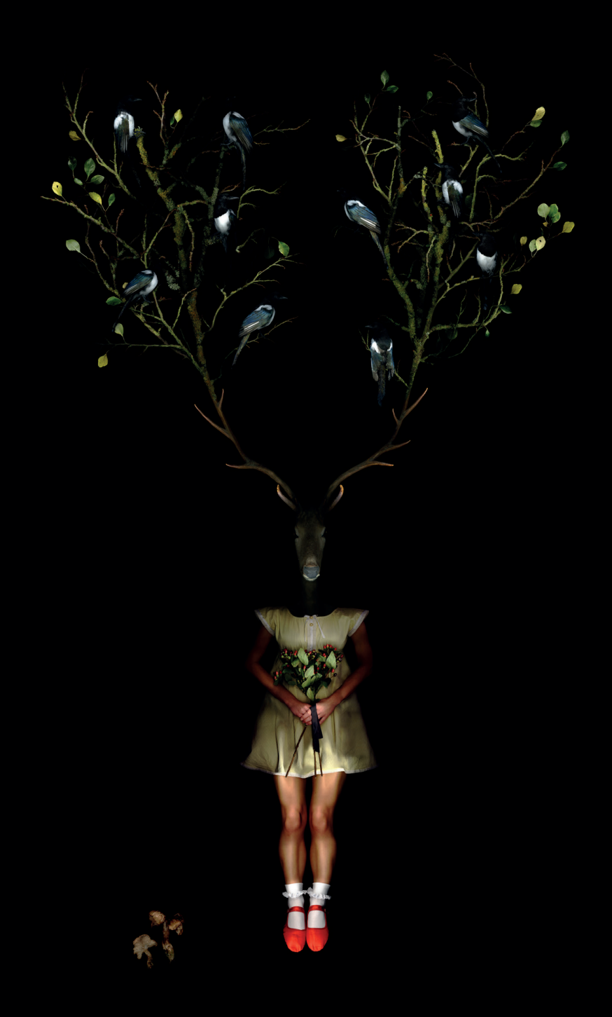
THE CRUELTY OF THE CLASSICAL CANON