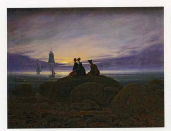
Caspar David Friedrich, Moonrise Over the Sea, 1822

But let me make a slight digression, because this transition in which humanized space has lost what I might call the depth of depth makes me think of an essay from 1935 by Roger Caillois, "Mimicry and Legendary Psychasthenia," in which the French writer notes a mental condition he describes as "a disturbance in the perception of space." What a strange psychosis. It's since been debunked as sheer literary imagination, but what Caillois described was a trembling fear in people who thought they'd lost the difference between themselves and the space around them, that they leaked into space, that their personality dissolved