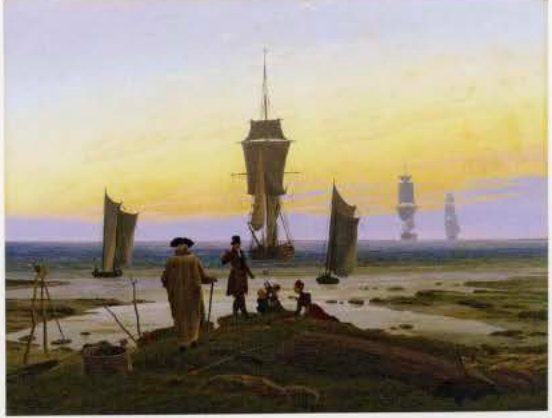
Caspar David Friedrich, The Stages of Life, 1835