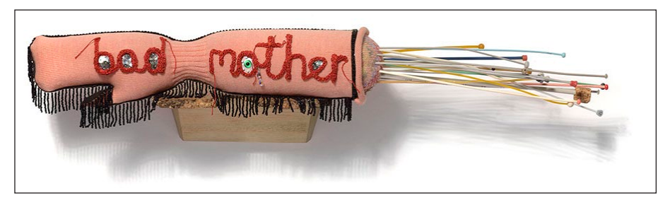
Figure 4: Bad Mother, 2013, machine knitted wool, machine knitted lurex, expanding foam, broken knitting needles, glass beads, sequins, dress pins, crystal beads on an oak and maple wood shelf, 780 \times 160 \times 160 mm.