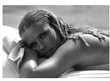
Bo Derek, 1979

The Afro, also known as the Natural, is a potent symbol of black power because it exploits the natural texture of African hair. This texture was regarded in derogatory terms as 'woolly' by supporters of slavery in the 19th century, and 'nappy' or even 'bad' within 20th-century African-American hairdressing cultures that favoured hair-straightening. 'Nappy' hair was finally accorded positive value in America in the context of the Black Rights movement of the 1970s. Black beauty was reclaimed with reference to the natural qualities of the African body as an emancipatory source of identity. But, at the same time, the Afro was a fashion statement, influencing a generation of 'groovy' as well as politically active white people to adopt Afro-inspired styles.