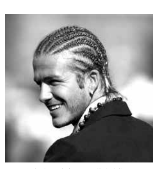
David Beckham, 2003

Historians can point to a continuous tradition of cornrow braiding from ancient African civilizations such as the Nok of Nigeria, through the dislocations of slavery and into the present day hairdressing skillset of the African diaspora. Even where hair straightening has been the norm, the practice survived through the braiding of young girls' hair to resurface on adult heads as fashions as the political climate changed. There is no doubt that cornrows are a highly creative and symbolically powerful way of dressing black hair and celebrating the cultural identities of people of African descent. But was the media furore justified when cornrows were fleetingly adopted by white Kardashian celebrity Kylie Jenner last year? When David Beckham comments that his 2003 cornrows were a 'mistake', does he speak of the cringing personal embarrass-