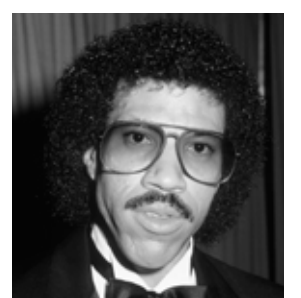
Lionel Ritchie, 1983

The Afro, also known as the Natural, is a potent symbol of black power because it exploits the natural texture of African hair. This texture was regarded in derogatory terms as 'woolly' by supporters of slavery in the 19th century, and 'nappy' or even 'bad' within 20th-century African-American hairdressing cultures that favoured hair-straightening. 'Nappy' hair was finally accorded positive value in America in the context of the Black Rights movement of the 1970s. Black beauty was reclaimed with reference to the natural qualities of the African body as an emancipatory source of identity. But, at the same time, the Afro was a fashion statement, influencing a generation of 'groovy' as well as politically active white people to adopt Afro-inspired styles.