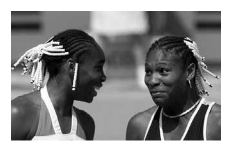
Venus and Serena Williams, 2000

All cultures borrow from one another in search of artistic inspiration, design solutions and cosmopolitan consciousness. Fashion cultures use 'foreign' or 'exotic' motifs, shapes and materials to produce a novel or edgy look, but in the process the originating cultures are mythologized or even ignored. In the fashion media, non-western cultures as a whole are frequently regarded as the providers of traditional, timeless raw materials that western designers can claim to 'discover', 'improve' and make aesthetically viable without needing to credit or financially reward the skilled artistry of the cultures that created them. Having social permission to flirt with the exotic with no negative effects on status and opportunity is also a key aspect of white privilege when it comes to the history of Caucasian cornrows. While some white women wore them as a fashion statement in the Bo Derek era, court cases reveal that African-American women were facing dismissal from the workplace because their well-groomed, practical and culturally appropriate cornrows were being branded an 'extreme' style by their employers.