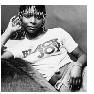
Floella Benjamin, 1977

ment of any past fashion, or does the video footage of Beckham's braided head as he meets Nelson Mandela prompt a deeper consideration of cultural sharing and cultural appropriation when it comes to hair?