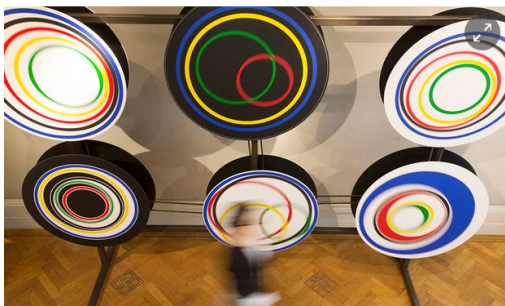
A piece by Gavin Turk is part of the Marcel Duchamp exhibition.

Duchamp is the father of conceptual art and best known for his readymades, as in the urinal he designated as art in 1917 . His first pure readymade was a galvanised bottle rack from 100 years ago.