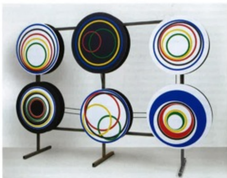
Rotor Rings , 2014, by Gavin Turk

Duchamp represents an inescapable intellectual condition, in which communicative play and unconscious rambling describe reality. He is now publically attributed with getting the ball rolling for the kind of art that is known as conceptual – a strange category, since even conceptual art has to take some sort of thought-free form. Umh... conceptual... I get it! Or is it that I don't, and