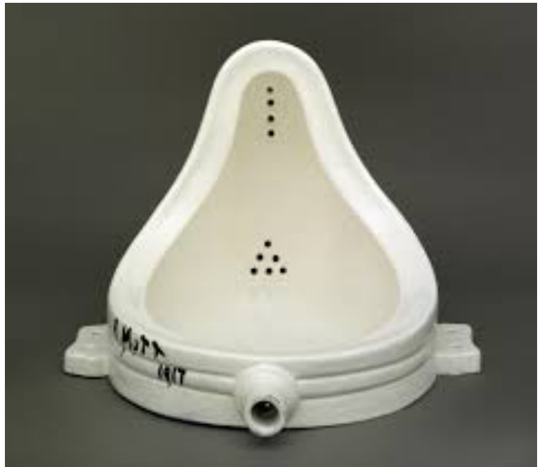
Marcel Duchamp, Fountain 1917