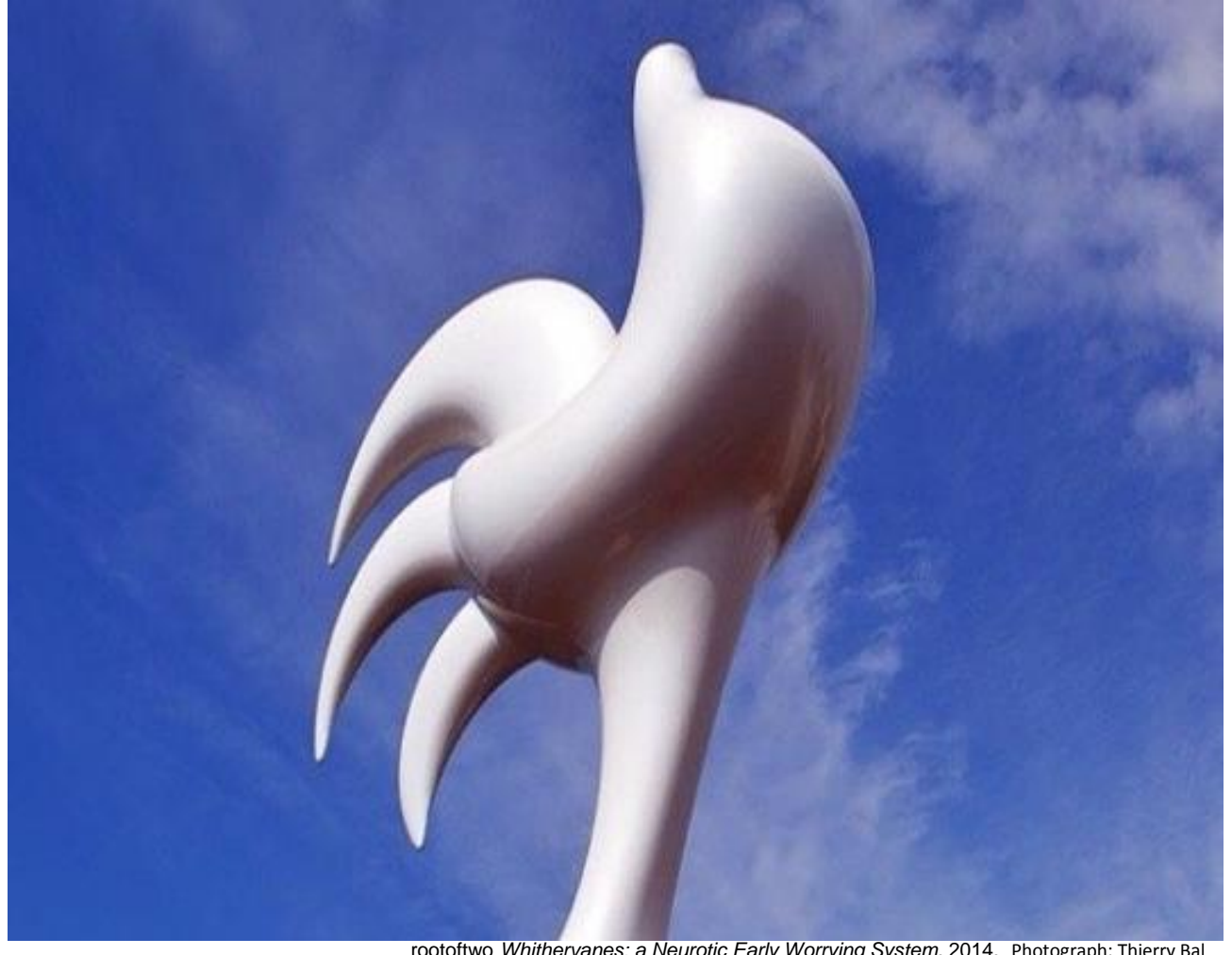
rootoftwo Whithervanes: a Neurotic Early Worrying System, 2014.