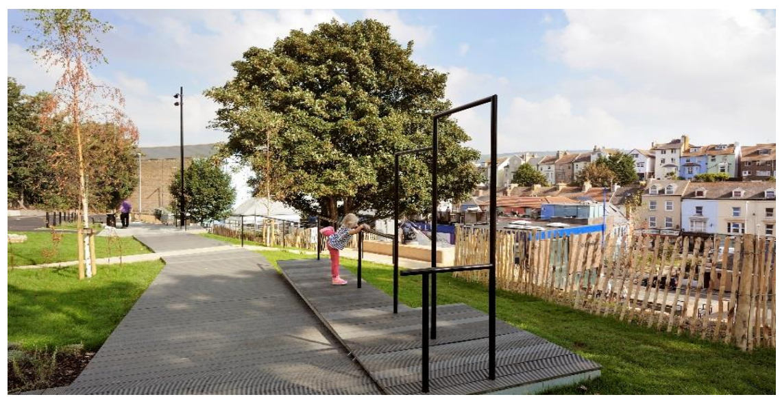
muf architecture/art Payers Park, 2014.