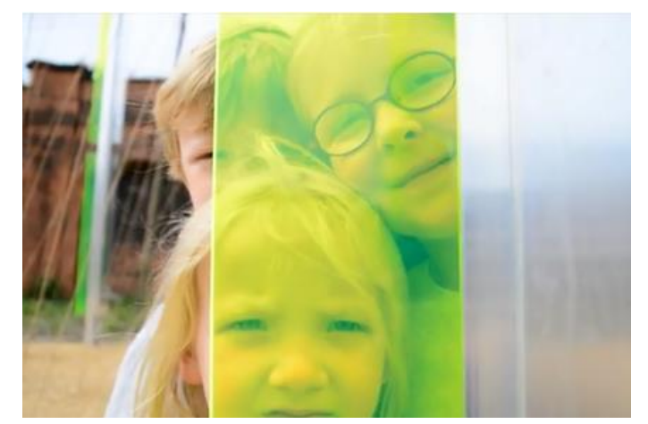
Children at Jyll Bradley Green/Light (for M.R.)