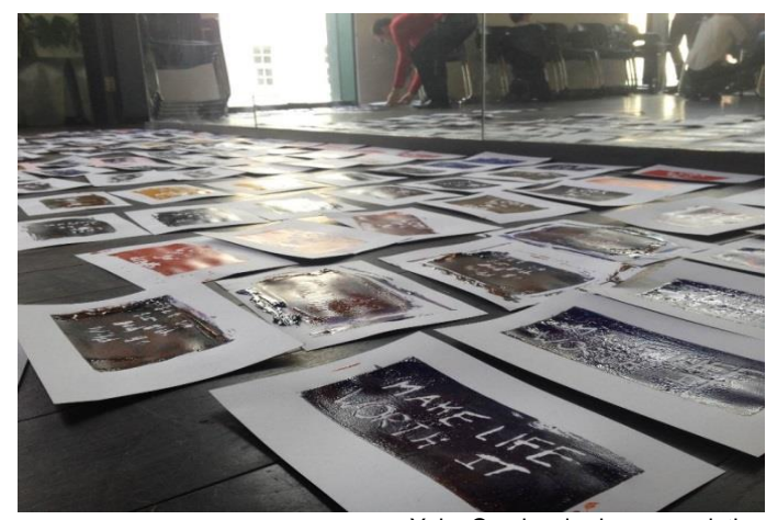
Yoko Ono inspired screen printing