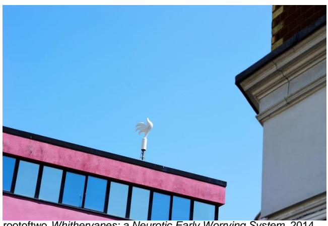
rootoftwo Whithervanes: a Neurotic Early Worrying System, 2014.

Visitors to Lookout were physically and emotionally transported to glimpse different perspectives on the future through this array of fabulous new artworks. They were invited to reflect on the artists' hopes and fears about universal issues: the gap between rich and poor, climate and environment, demography and migration, sustainability, regeneration, technology and communication, urban design, social engineering, food security and all the other aspects of our daily lives that are changing ever faster. With a population of just 45,000, Folkestone can be a lens through which we look out at the world and question what's happening now and what's coming next.