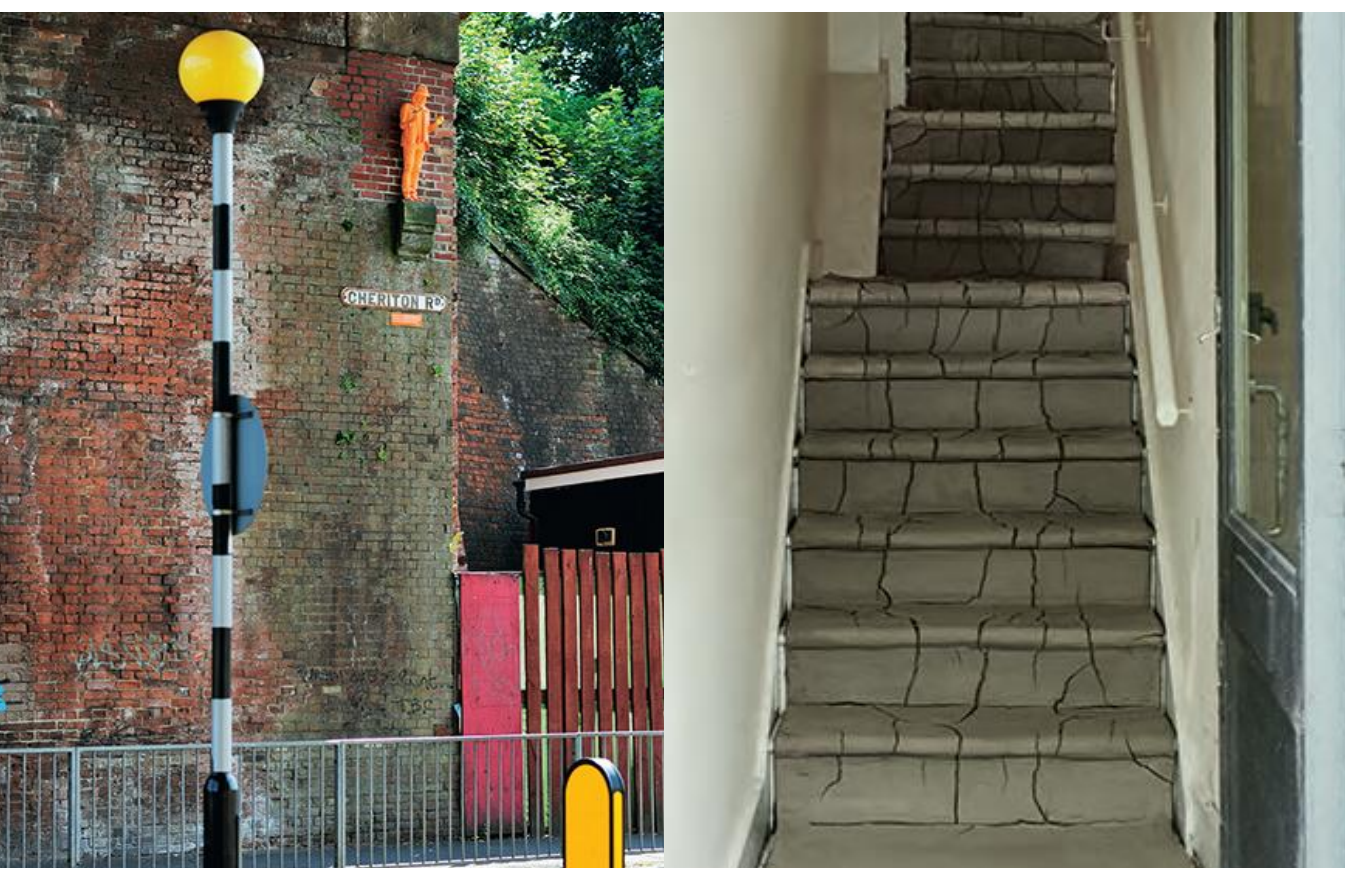
Strange Cargo The Luckiest Place on Earth , 2014.