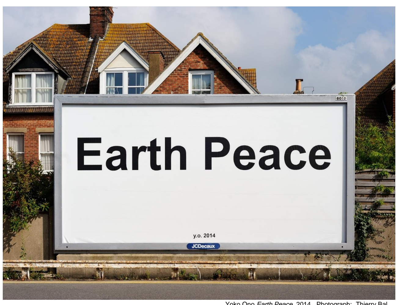
Yoko Ono Earth Peace, 2014.