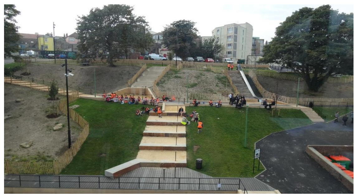
muf architecture/art Payers Park, 2014.