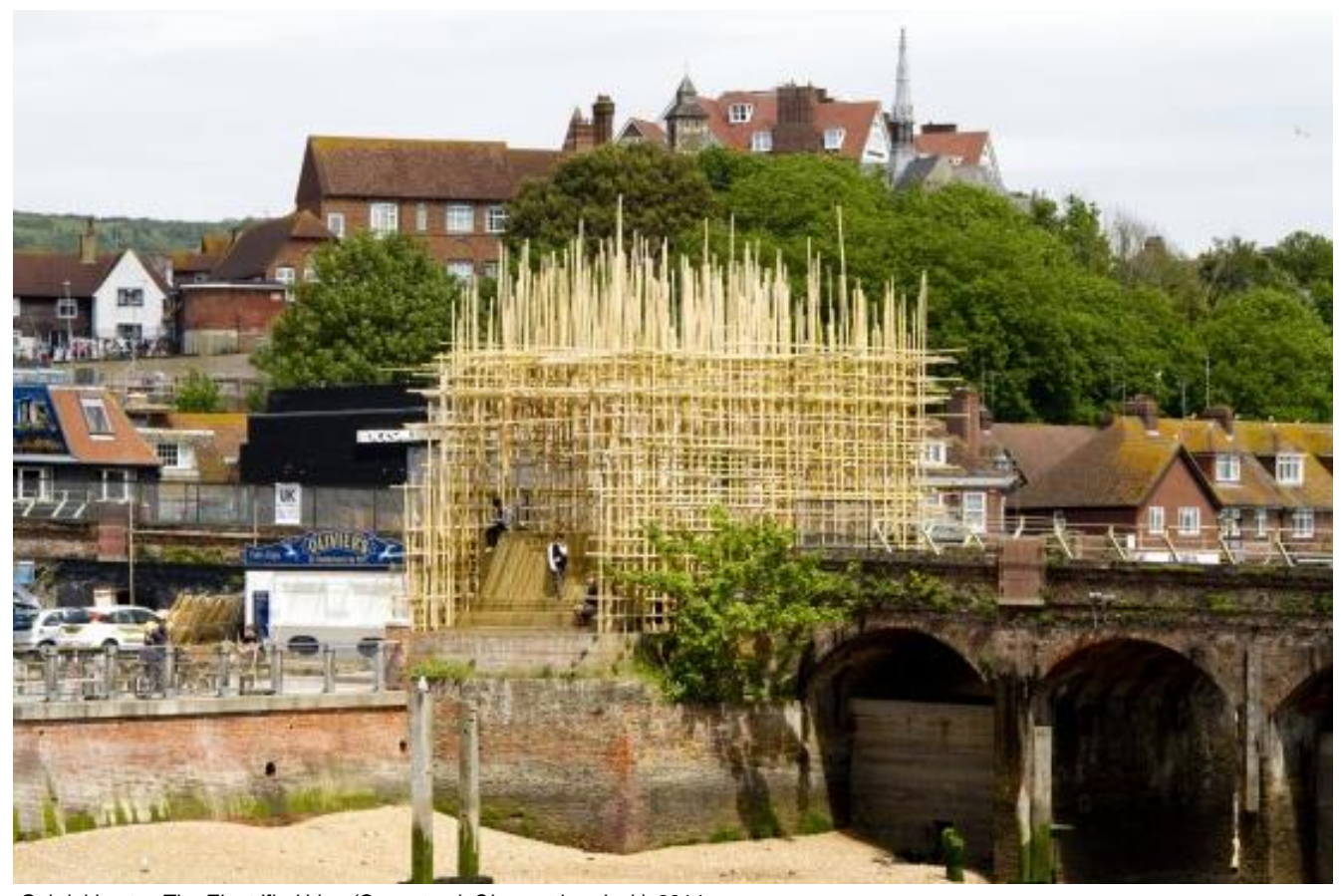
Gabriel Lester The Electrified Line (Cross-track Observation-deck) , 2014 Photograph: Gabriel Lester

To the east of the harbour looking out onto local fishing boats is the Stade, where Sarah Staton's quirky steel sculpture Steve, informed by the practice and theory of architecture and design, characterises leisure, in contrast to the surrounding working environment. Steve's 'children' are steel asymmetric planters with welcoming seats.