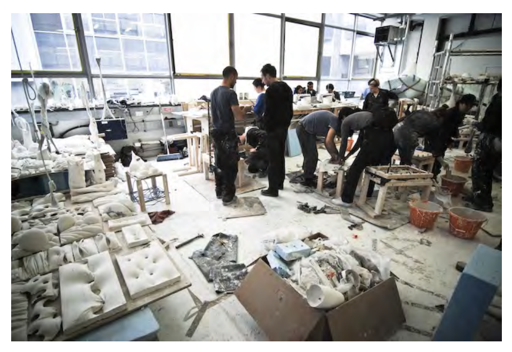
Figure 2. IDE-AADRL Collaboration, work in progress.

The material computation masterclass ran in 2009 as a collaboration between the RCA IDE and the AADRL graduate students aimed at uniting architectural and industrial design physical and conceptual skills in a materials computation masterclass. It was focused around the use of latex and plaster to explore flexible forming of components and structures. The value of the collective environment was leveraged through the interfacing of architectural notions of structure and programme with Industrial design process, manufacturing and component detailing inputs. During the 5 day workshop 60 students used 2 tonnes of plaster to make over 100 castings in a continuous evolution of forms (see Figure 2). The modus operandi began directly with making as a conscious strategy to quickly integrate the groups. The final outcome allowed students to collaboratively explore tactile empirical forms of form making outside of CAD environments and to realize that some forms and their methods of generation fall outside of the digital domain.