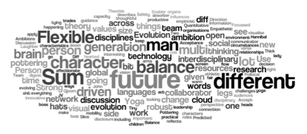
Figure 4. Wordle Word Cloud of the Future Interdisciplinary Character

Participant M stated a balanced two heads of theory and funding driven skills would be desirable. This participant emphasised the importance of "balance" as an attribute across several spectrums including "theorist – empiricist", "teacher and leader as well as a collaborator", "quantitative – qualitative", whilst being "flexible and robust". Participant H approached the exercise with words, highlighting challenges for the future. Participant H stated "knowledge would be very important" and that the future interdisciplinary character would require a "wide vision and communication". Furthermore, the future interdisciplinary character would need to be "adventurous, flexible, possess a thick skin for protection, be relaxed, be able to laugh and be sociable, have drive, and be well connected". Participant C based her portrayal of the future interdisciplinary character in terms of the ideas and values she has for her children. Thus, participant C stressed that this person should have "political and other values that are based on being fair and decent". Moreover, the future interdisciplinary character should be "committed, perceptive, thoughtful, big-hearted, warm, loving and affectionate". Also "energetic and athletic, and possess abstract thinking but be able to apply it to a future generation".