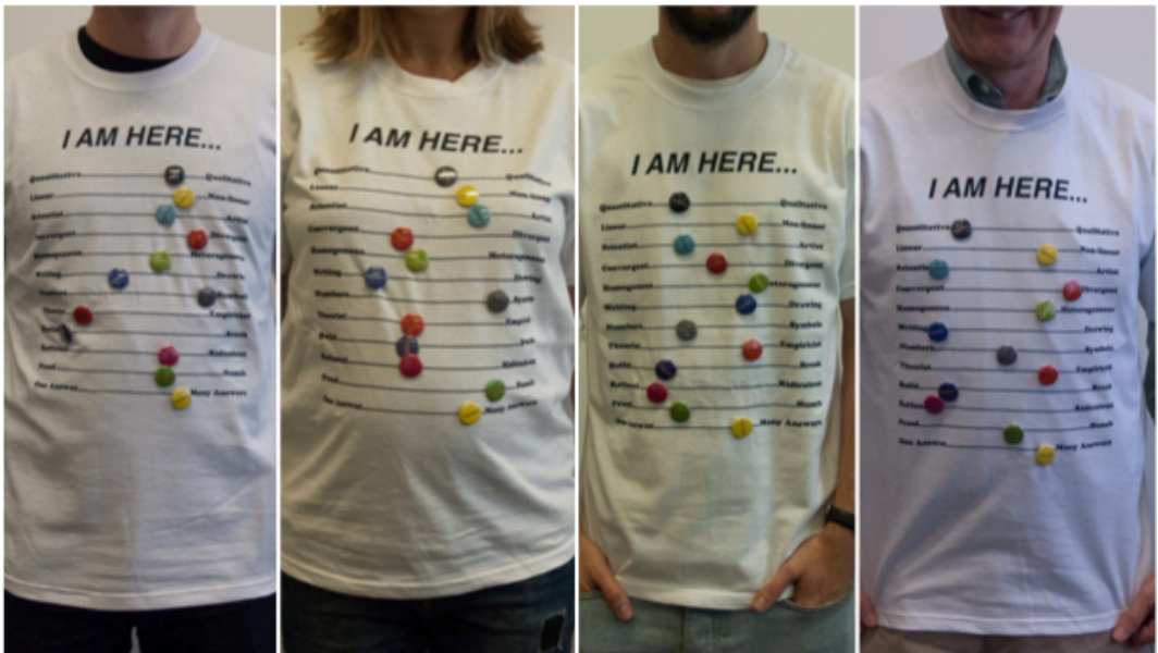
rigure 2. I-Shint Exercise (participants completed versions)

The next exercise, "The Future Interdisciplinary Character", challenged the participants to think about the future, complex, inter-connected world we are set to inhabit and to think about what skills, knowledge and experiences will be needed to best address these issues. Here, each participant was given a "blank character" (Figure 3 - left) and asked to complete it so that it fully described the "The Future Interdisciplinary Character" who might be best positioned to address the world's future challenges.