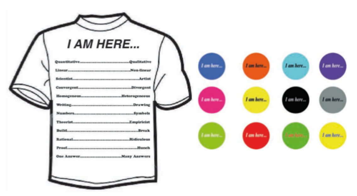
Figure 1. T-Shirt Exercise Tools (T-Shirt and Coloured Badges)

The project's first workshop involved a number of creative activities, which aimed to examine the disciplinary perspectives of each participant that would, in turn, allow comparisons to be drawn between them. The selection of creative activities was carried out after a review of workshop techniques from the experiences of network members and action research techniques. The first exercise involved each participant wearing an identical T-shirt with a series of conceptual linear spectrums printed on it such as "Scientist.....Artist", "Build.....Break", and "Proof.....Hunch" (Figure 1 - left). Each participant was asked to pin a badge labelled "I am here..." (Figure 1 - right) where they felt they belonged on every spectrum.