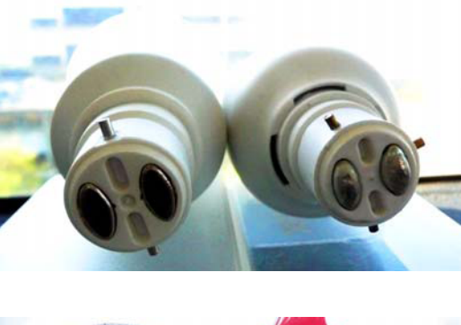
Figure 1 Eaton MEM BC3 bulb and fitting (on the right) compared with standard bayonet bulb and fitting (on the left).