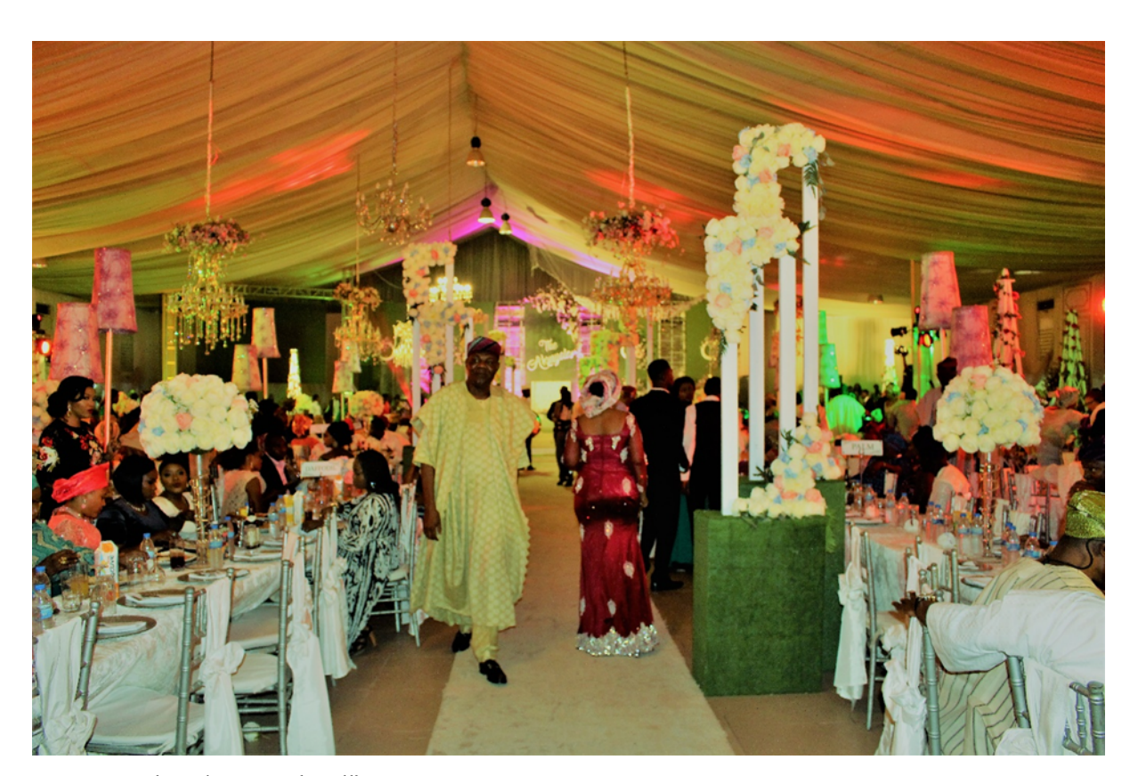
Fig. 39. Opulent decor at a 'small' reception in Lagos.