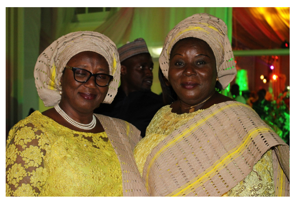
Fig. 36. The Yesufu sisters in ó ńjá'wù sányán aṣọ òkè with yellow stripe.