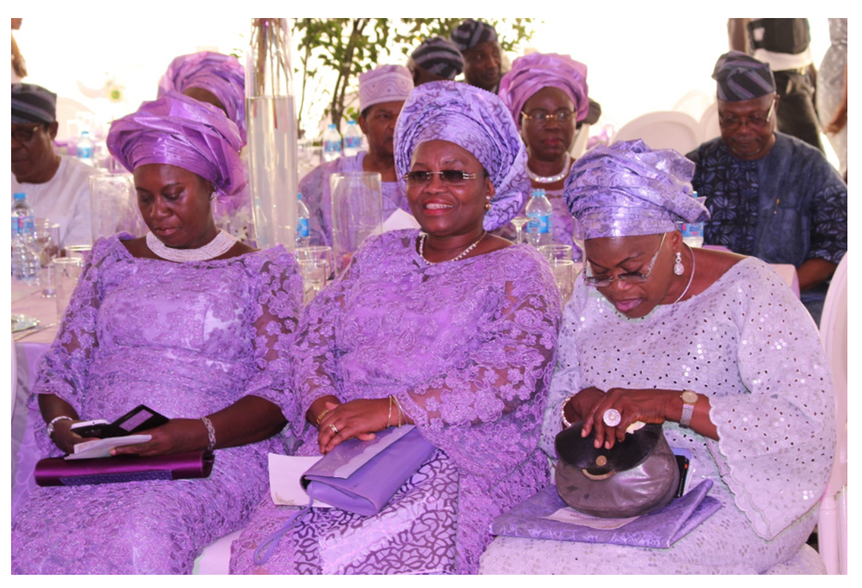
Fig.41. Guests at a traditional wedding reception. The colour code was silver and lilac. The gele although not aṣọ òkè, was aṣọ eþí. The men's fila was both aṣọ òkè and aṣọ eþí. Lagos Island.