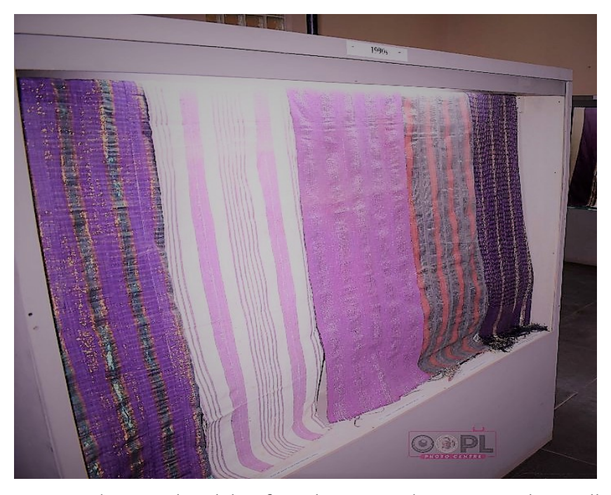
Fig, 29 and 30. aṣọ òkè exhibits from the 1960s and 1990s. Ogunsheye Collection, Olusegun Obasanjo Presidential Library.