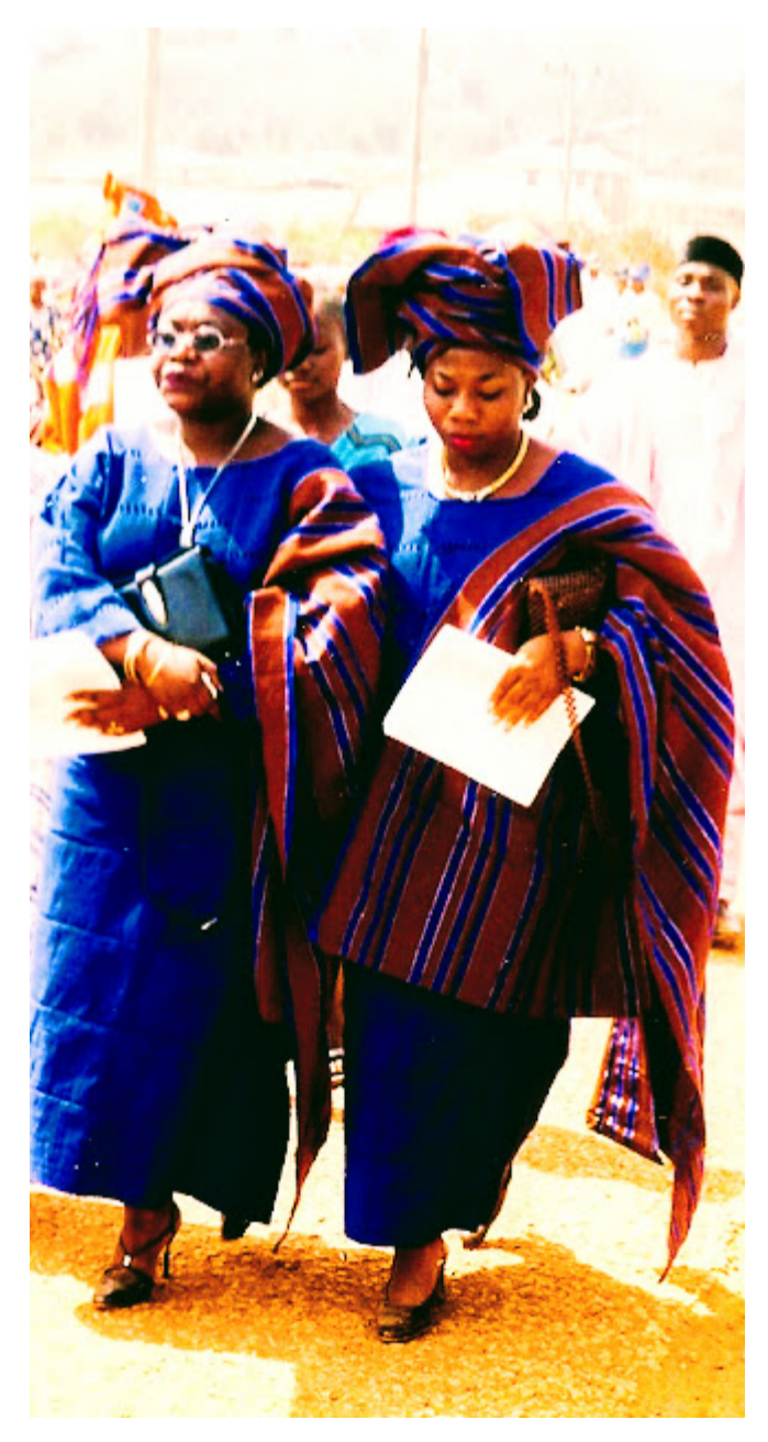
Fig. 37. Full aṣọ òkè aṣọ ebí 'completes'