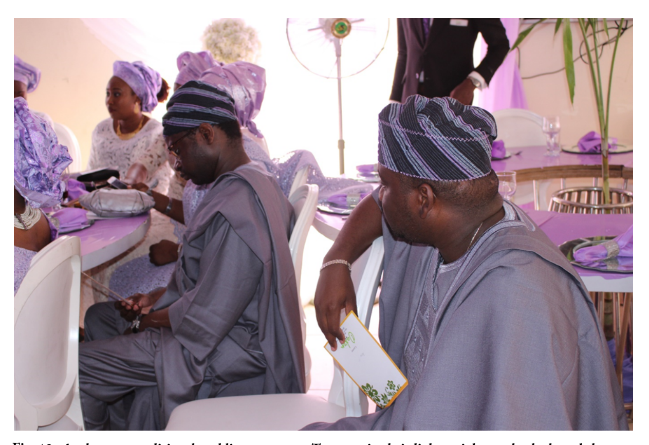
Fig. 42. At the same traditional wedding ceremony. Two men in their light-weight wool agbada and the aṣọ ebí aṣọ òkè fila.