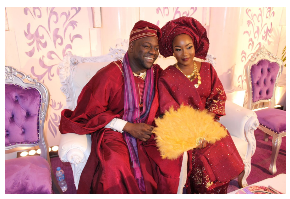
Fig.38. Bride and groom wearing contemporary Àláárì. The bride's aṣọ òkè has been heavily embroidered in gold thread and studded with diamanté. The groom has an heirloom vintage Àláárì stole around his neck in memory of his late father.