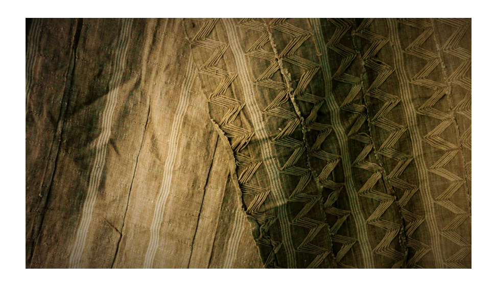
Fig.31. Vintage sányán, embroidered with silk thread. Over 100 year old heirloom cloth from researcher's collection