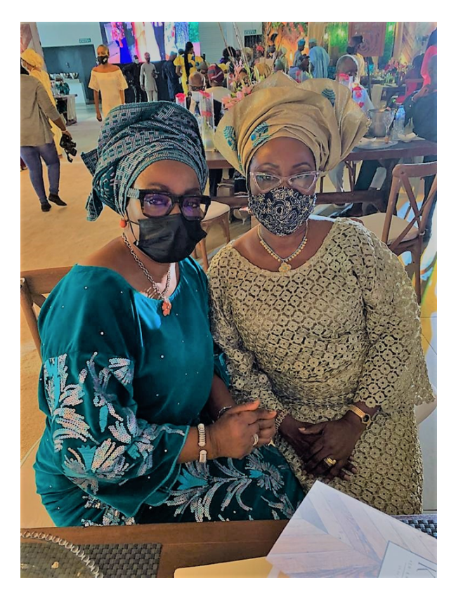
Fig.44 -48. An array of post-COVID sartorial adaptations to accommodate the pursuit of resplendence.