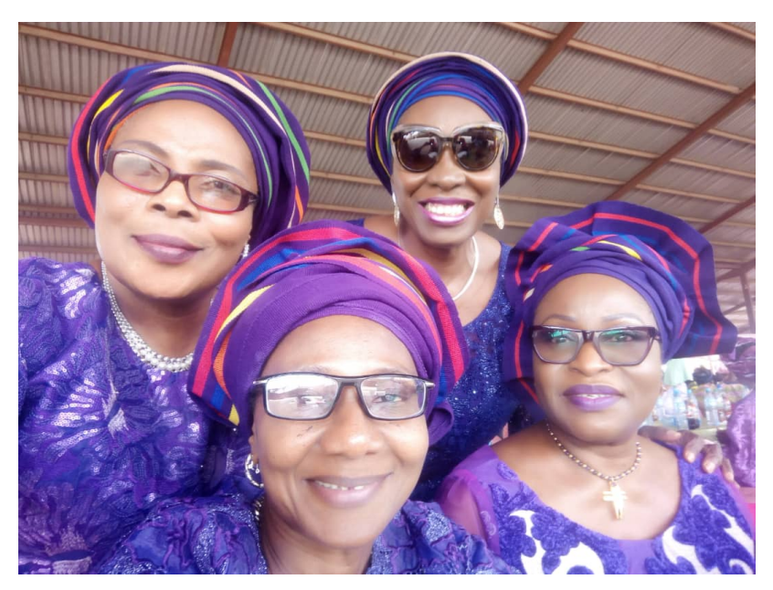
Fig. 43. St. Anne's School, Ibadan alumni at a reunion event wearing the school aṣọ òkè aṣọ ẹgbẹ́. Although not technically aṣọ ẹbí, the two concepts have become conflated and aṣọ ẹbí, as a term, serves for both. Ibadan, 2020.