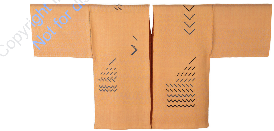
Figure 3: Handwoven linen jacket with Lao-Khrang textile motifs.

1. 2. 3. 4. 5. 6. 7. 8. 9. 10. 11. 12. 13. 14. 15. 16. 17. 18.