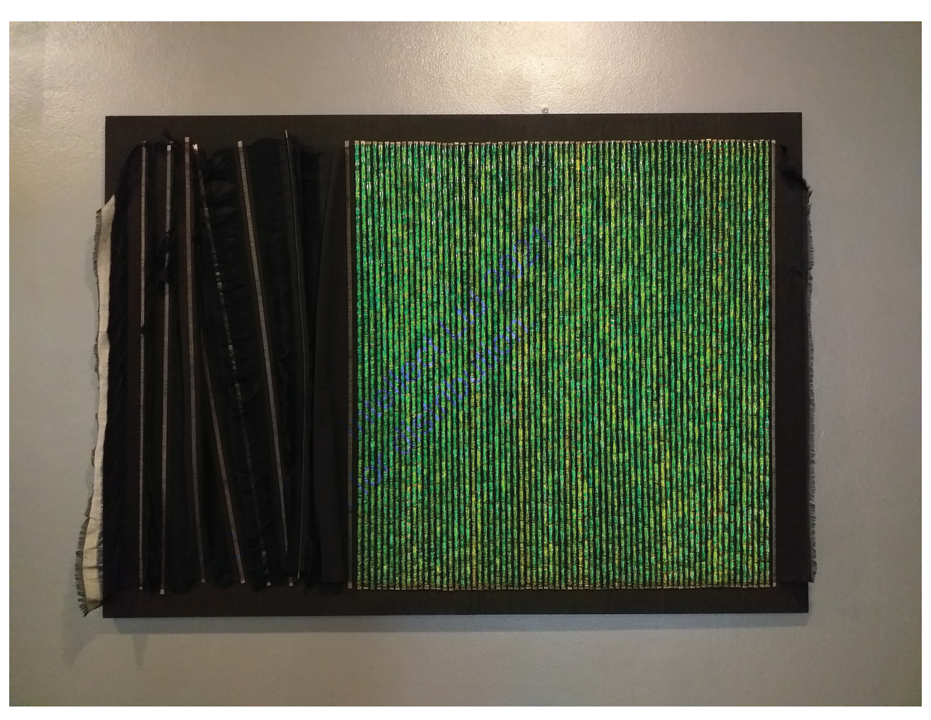
Figure 6: Gleaming Decay, woven panel incorporating jewel beetle wing carapaces.