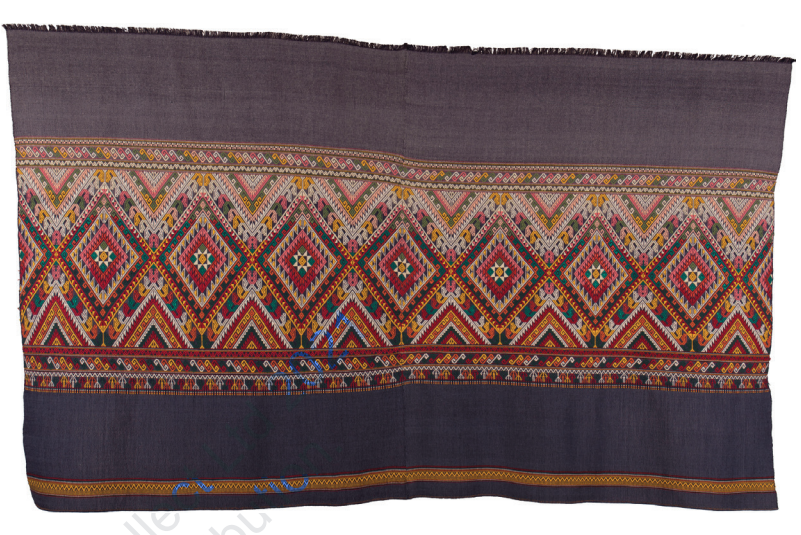
Figure 2: Ethnic Lao-Khrang tube skirt with new colour composition.