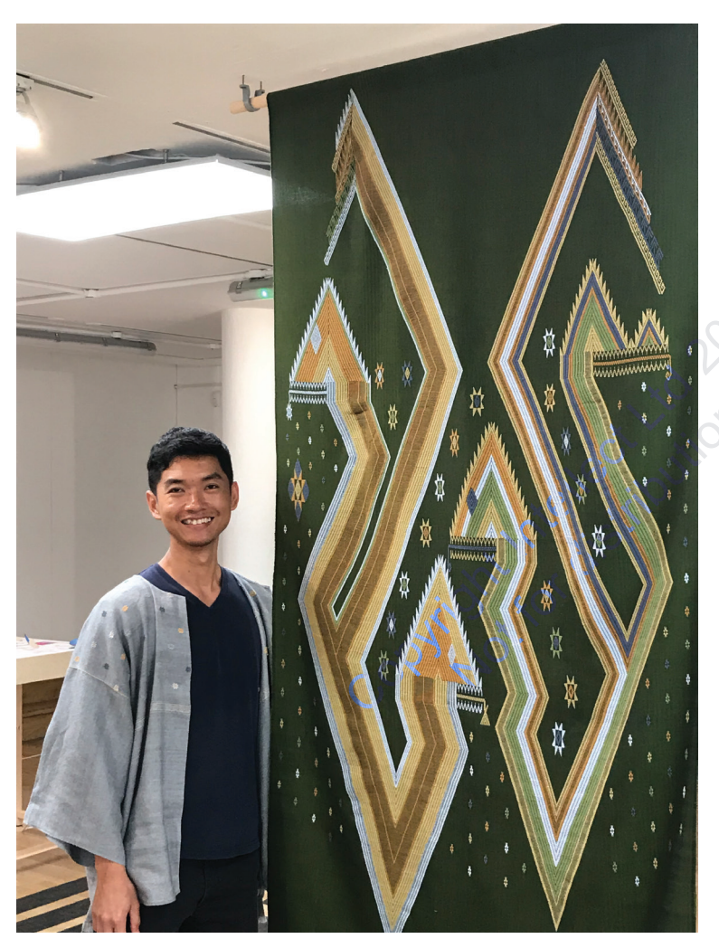
Figure 4: Naga, woven panel created in collaboration with master weaver Jumpee Tamasiri.