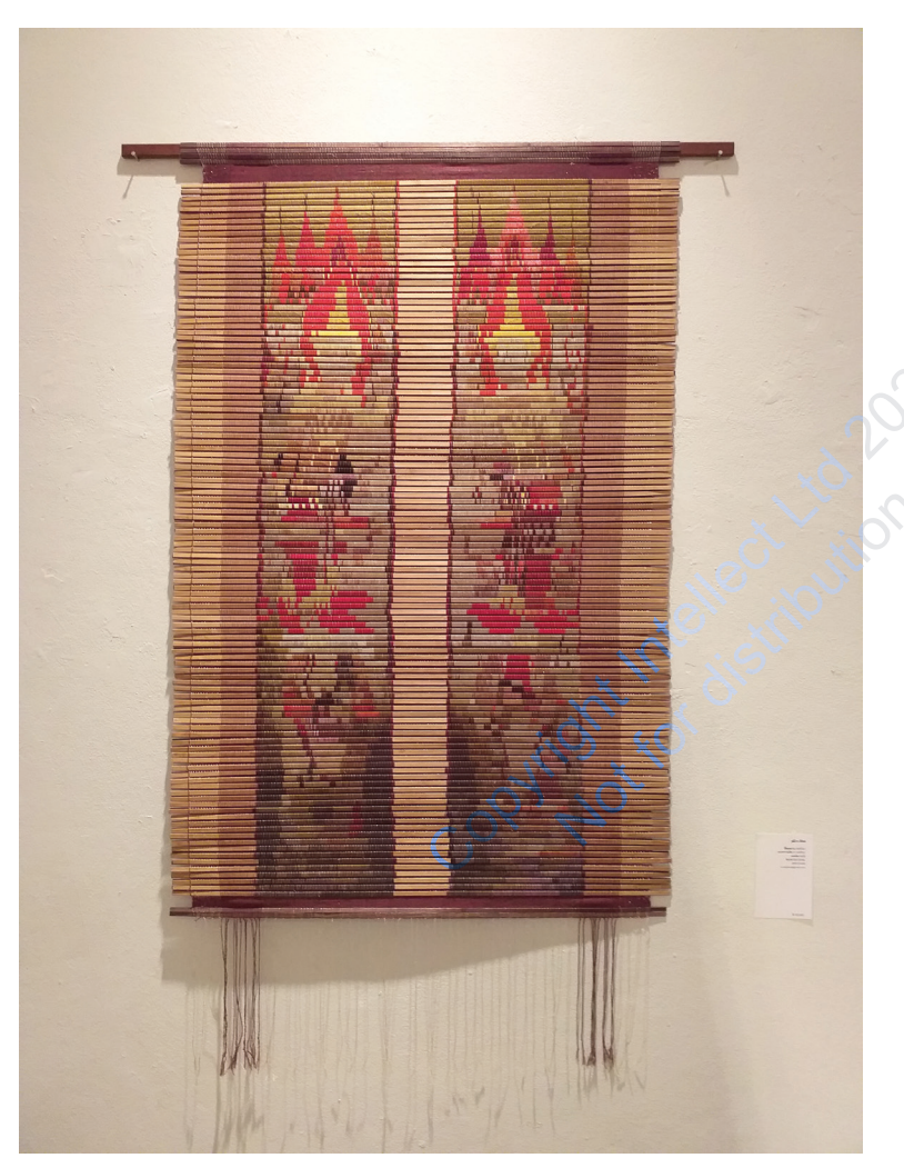
Figure 5: Davarapala, woven panel depicting Buddhist angelic door guardians.