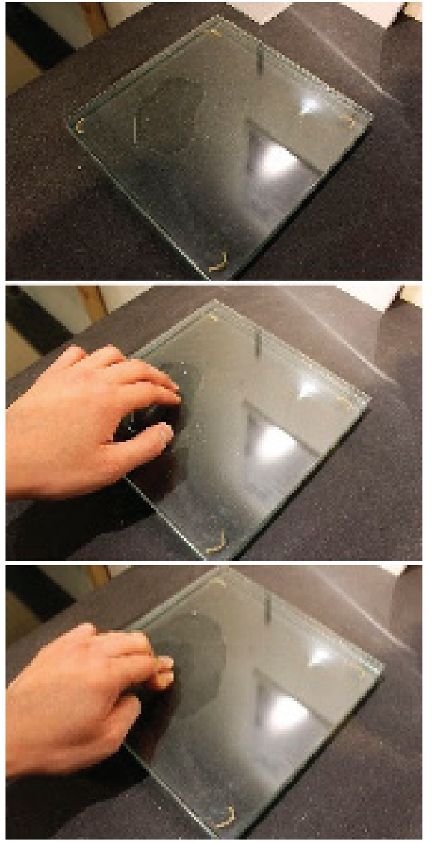
Fig. 1:The sealed liquid between the two glass sheets immediately expands its surface according to the pressure it receives on the glass surface.

Considering that the crew on a long duration space mission to our planetary neighbor will be relatively small, it is imperative to focus on the astronauts' qualitative experiences to ensure their well-being. This needs to complement the support for their basic physiological and psychological needs in Maslow's Hierarchy of Needs [9][10][3]. Addressing higher level needs is expected to have a positive influence of crew health, and could reduce performance related risks for the mission. Especially, when the astronauts travel to explore Mars for the first time, isolated perceptions can become a serious issue for them. A retired NASA astronaut, Nicole Stott, once said: "nothing beats that first hug after landing" after returning to Earth from the ISS [11]. It should be noted that a trip to the ISS is incomparably shorter than that to Mars. As such, improving the feeling of connection and focusing