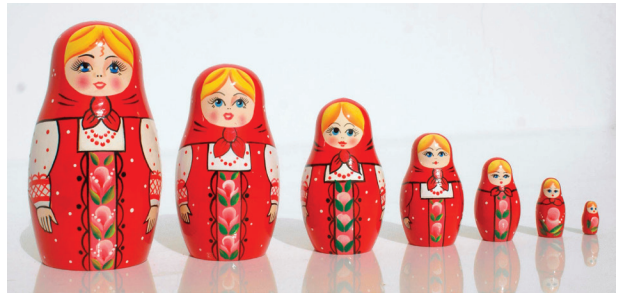
Fig.6: Embedded nature of multiple "surprising" objects can be illustrated through the design of Matryoshka dolls, which are a set of wooden dolls with decreasing sizes, placed one inside another.

subsequent surprises from their loved ones over the course of their journey. This would support the crew's well-being by improving the feeling of connection, and therefore contribute to a successful long-distance/ duration space mission. In the meantime, family or friends on Earth may also imagine their family/friend— the astronaut—being able to take care of their well-being, while they are isolated on their deep space mission.