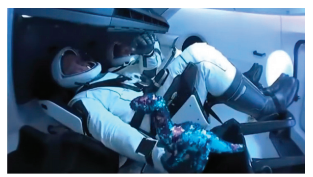
Fig. 2: Astronaut Bob Behnken pushing a floating toy dinosaur around the cabin of the Crew Dragon capsule, as it reaches low-Earth orbit in May, 2020.

In this paper, we challenge this practice by exploring the idea of qualitative contact and decoupled interactions to enhance crew interactions in support of their psychological well-being.