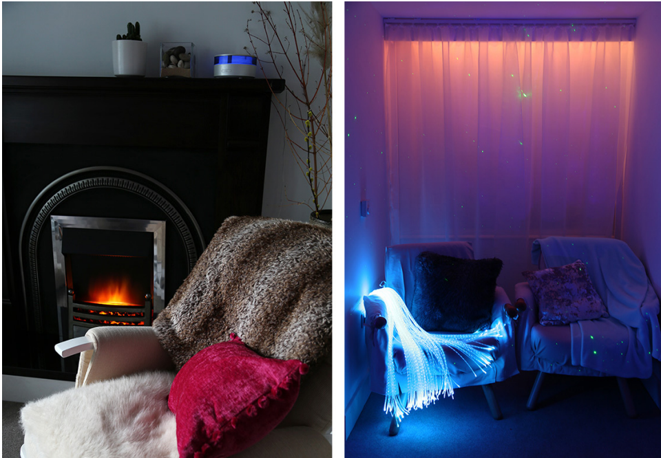
Figure 5 Seating opportunities referencing home-like atmosphere (left) and featuring fibre optics strands and cushions of varying textures (right).