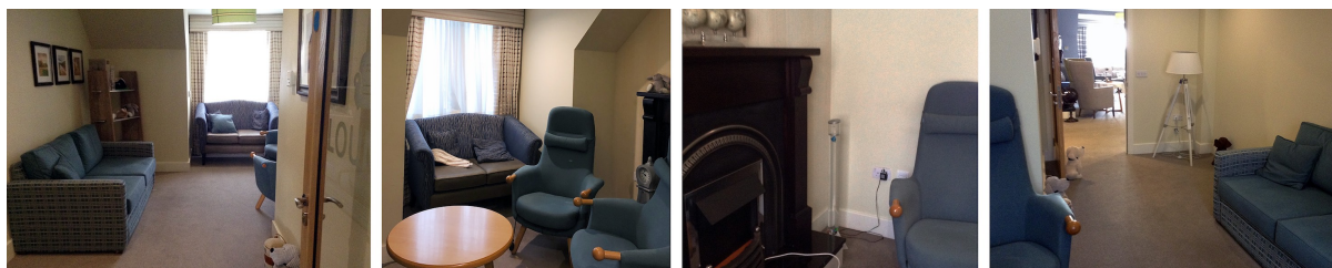
Figure 1 Under-used lounge at Coombe Hill Manor's dementia suite

The project received no external funding. An engagement agreement between the partners (Coombe Hill Manor care-home and the research institutions Kingston University and University of Southampton) established a budget of approximately £2000 for materials, equipment and costs incurred during the installation, provided by the care-home (with £1000 being donated by the families of residents). It was further arranged that the researchers' contribution and service would be in kind in return for continued access to the facility for further research including evaluation sessions with users.