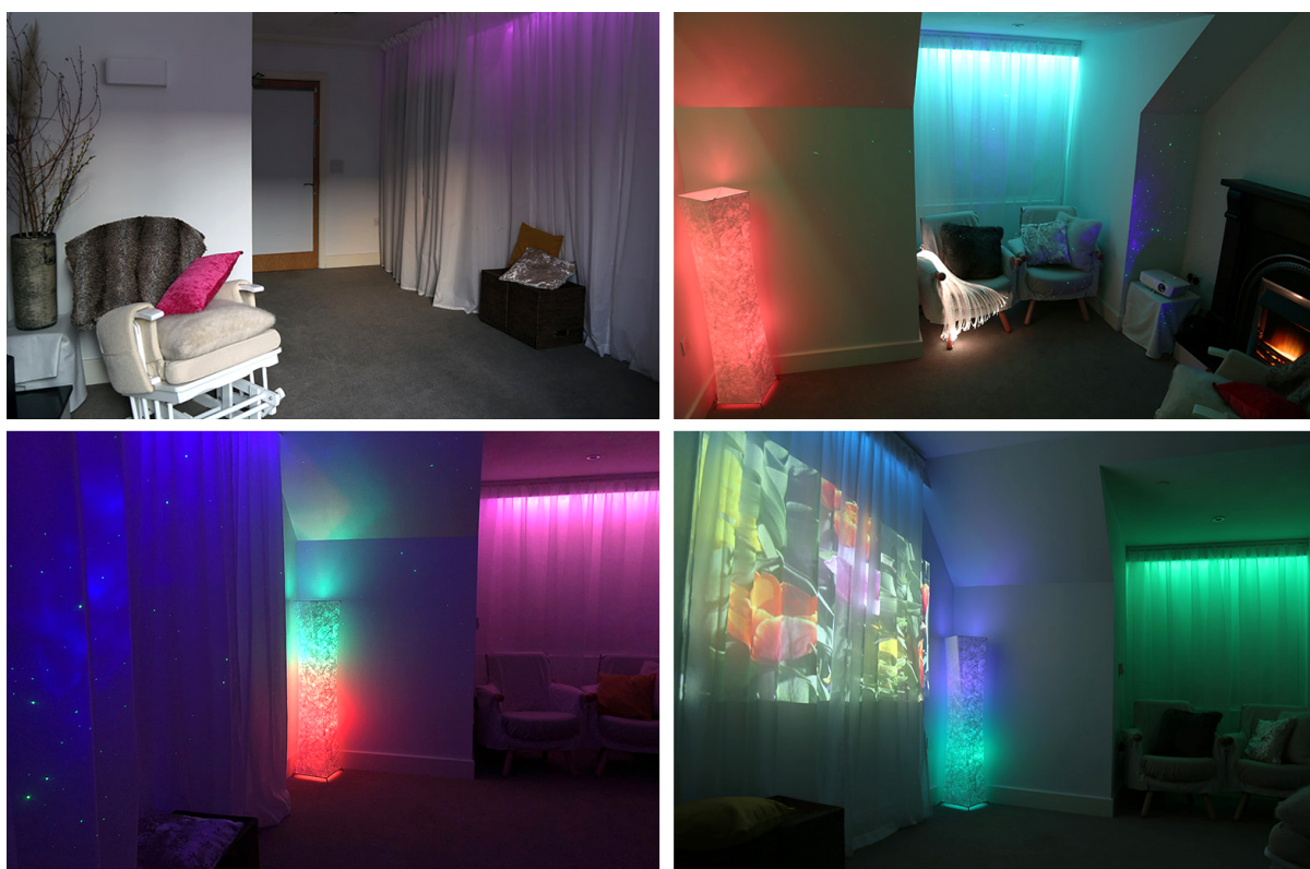
Figure 4 Finished sensory space in different lighting situations.

With the help of the in-house technician, works such as fitting the blinds and curtain rails were completed and, step by step, furniture, lights and technology including the colour-changing floor lamp, a rocking chair (second-hand purchased nursing chair), cupboards for storage, a projector, curtains, fibre optic strands, a star projector, a sound bar and an aroma diffuser were added to the room. Finally, the space was enhanced with accessories such as colourful, textured cushions, dry twigs and a glass bowl containing sand, stones and shells referencing familiar domestic environments and nature (Figures 4 and 5).