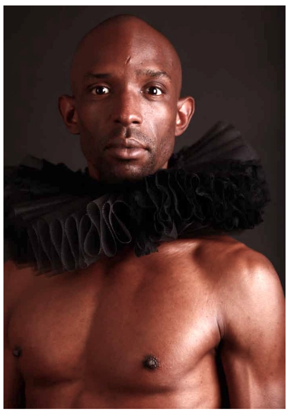
Charl Landvreugd, Molensteenkraag (2010), C-Print Reaction to the emerging debate on Zwarte Piet (blackface figure) in the Netherlands

encoding local issues through the Americo-centric as a way of legitimisation, the intertwining with local linguistic tropes proves not efficient enough to support the Dutch situation.