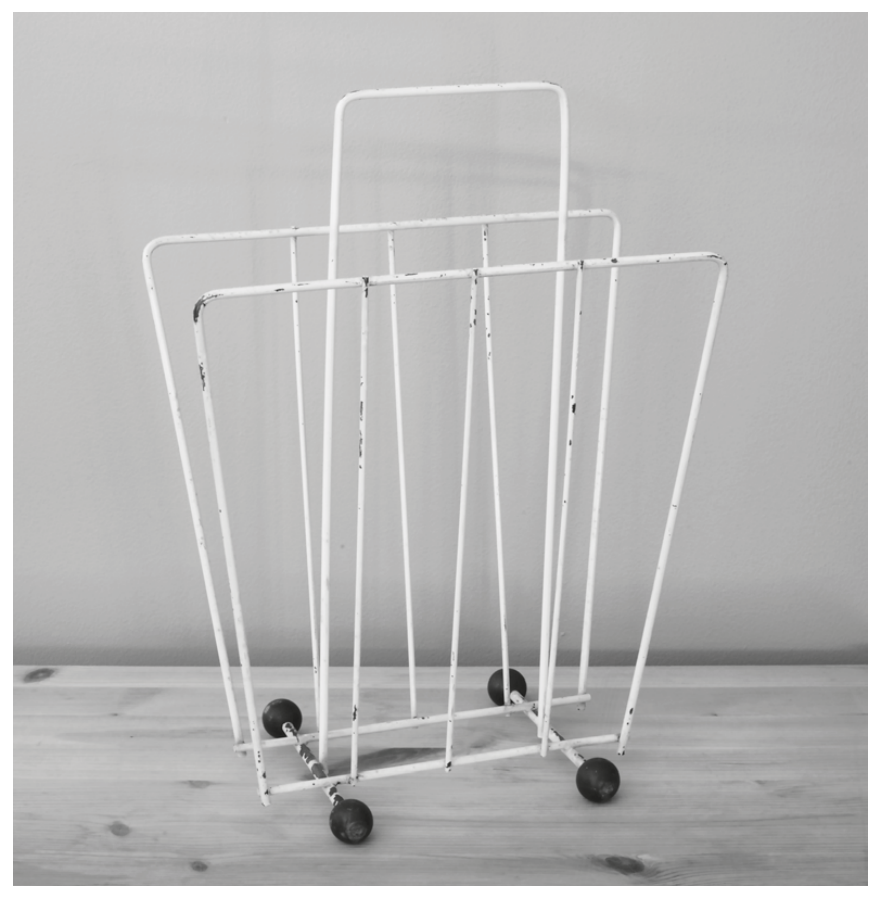
Figure 7.1 British ball-and-rod magazine rack sourced from eBay, most likely produced between the late 1950s and early 1960s, and in a style sold at Woolworths in the period.

is structured by technologies and interactions that did not shape previous forms of retro consumption. The site's operations as an online shopping application are therefore crucial to understanding the solidification and mediation of the historical narratives in which ball-and-rod objects have been embedded as twenty-first-century commodities.