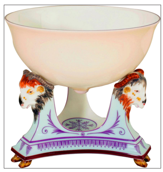
Nipple-cup known as the Breast bowl: Jatte-téton, dite bol sein, 1788, Sèvres Porcelain Manufactory, Musée National de la Céramique, Sèvres, France.