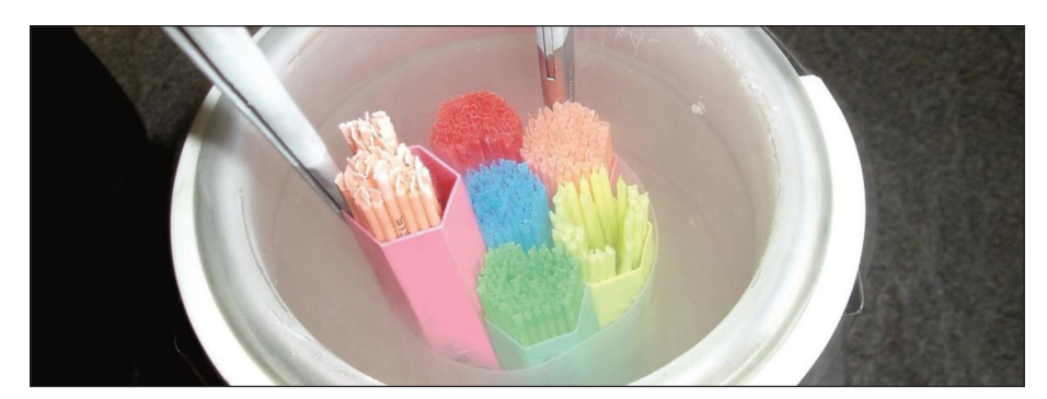
Bull Semen Straws, copyright Animal Breeding Europe <a href="http://www.abreeds.co.uk/">http://www.abreeds.co.uk/</a> [accessed April 2018].

development programs. Humans that do not eat large amounts of meat and dairy, for example, may not be considered 'optimal' eaters.