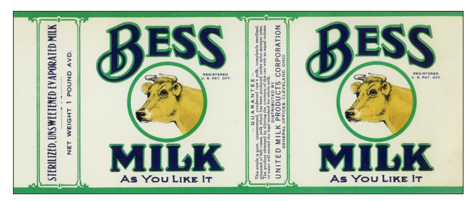
'Bess', Condensed Milk Label, 1915.

In the 1910s, evaporated milk began to be widely commercially available at low prices. Milk corporations funded clinical studies that suggested that babies who were fed on evaporated milk formula thrived better than breastfed babies, when their weight gain was compared. In North America particularly, some paediatricians promoted the view that bottle-feeding was as good as breastfeeding, based on progressive weight gain. The monitoring of growth then became a benchmark justifying the charts and weighing clinics. As infant welfare and health surveillance grew, there was a notional standard established on the basis of readings from these formula-fed babies. In today's climate, there may be more concerns that these weight gains and formulae contribute to diabetes and obesity in later life – and now feeding 'success' is as likely to be measured in achieving cerebral milestones. In the rapidly growing Asian markets, breast milk substitutes make unsubstantiated claims that the addition of vitamins will increase height, weight and intelligence. A mother from Vietnam, who spends nearly all of her income on formula milk from a German manufacturer, observed that: 'Most people here look for the weight and the height ... We always see chubby children on formula packages and on TV. We all want that.'8