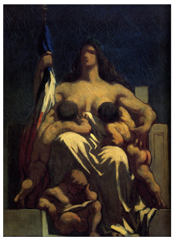
Honoré Daumier, The Republic Nourishes and Instructs Her Children, 1848, oil on canvas, 73 × 60 cm Musée d'Orsay, Paris.

necessary ingredients for healthy life, for milk alone, and the mechanism by which milk is secreted, 'were designed, and made what they are, by the great Creator of the universe': 'In milk, therefore, we should expect to find a model of what an alimentary substance ought to be—a kind of prototype, as it were, of nutritious materials in general'. Industry and the market came rapidly to deliver this ever-so natural and simultaneously divine substance to the masses, in ever newer and improved versions.