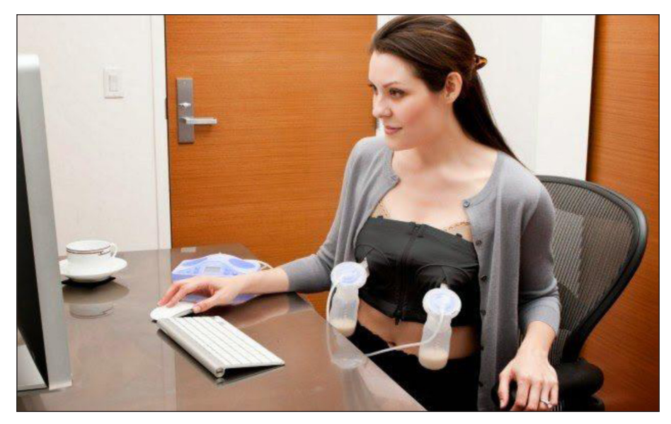
Hands Free Pumping Bra, 2016.

adaptable workforce of the future, extracted remotely from the newly-freed bodies of a female workforce that need not leave its desks to do the work of reproduction.