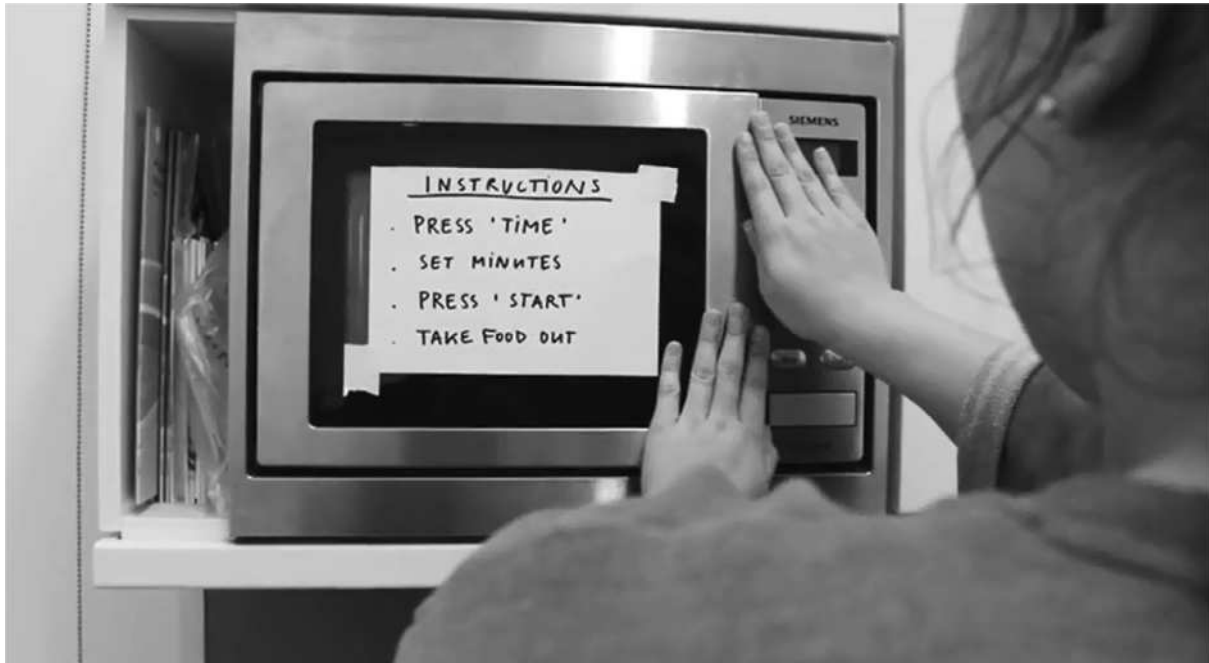
Figures 1a and 1b. Actors recreate scenarios in which people with Dementia struggle to interact with household products to help designers understand this user group and the issues they face.

To be successful, a design must match users' needs and be appropriate for the intended contexts of use. Understanding user needs and abilities can be difficult, particularly if the user group is not familiar to the designer (Figure 1). The designer must have empathy for the user, and drama may be a tool to help them achieve this. Brandt and Grunnet (2000) presented the method of 'frozen images' to understand users and their contexts of work, in this case refrigeration technicians tasked with servicing a device in a supermarket. Initially, users' tasks were broken down into individual components. Thereafter, designers made a physical action as a statue, a 'frozen image', related to one of the task components. The designers added dialogue and scenarios to the frozen images, informed by descriptions of characteristics of users, thus enriching their knowledge of the work and its context, as well as supporting empathy. Brandt and Grunnet (2000) progressed to have designers act out the target scenarios themselves. They dedicated a workshop area to the scenario of interest (refrigerator repair) using simple props such as boxes and chairs. Any ideas for new designs were written on Post-it notes and explored through acting out (Brandt Grunnet, 2000).