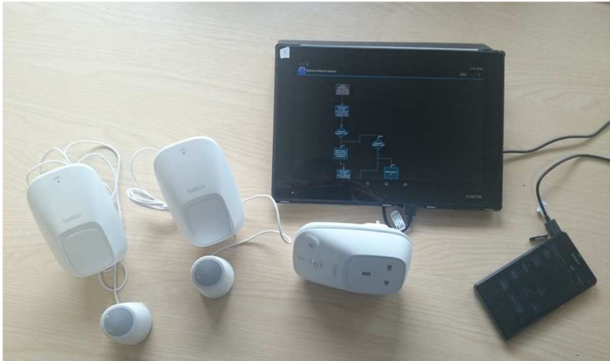
Figure 3. This system used a range of sensors and devices to deliver a narrative representative of living with a person with Dementia, in order to support design research and ideation.

mock-ups as catalysts for creativity or to help envision possible future scenarios involving new designs. After the performance process, designers are able to obtain new ideas and novel concepts from the participants (Kuutti & Iacucci, 2002). In a similar approach, Brandt and Grunnet (2000) provide users with props, and then visit the users' homes to generate ideas in context.