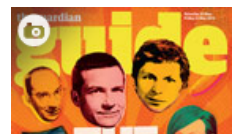
The Guide cover 25 May 2013